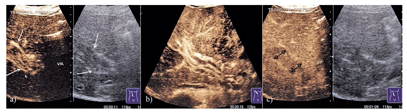
Fig 3. a) Malignant PVT with hyperenhancement of the thrombus in the arterial phase, 12 seconds after SonoVue injection (arrows); b) CEUS examination reveals thrombus vascularization with early arterial enhancement ("linear pattern" described by Rossi [29]) – suggesting malignant portal vein thrombosis; c) Malignant PVT– washout is present in the portal phase of CEUS examination (1 minute after contrast injection) (double arrows).

In the latter years many studies have been completed in order to assess the value of CEUS in the diagnosis of PVT and all demonstrated its high value in the characterization and also for the detection of PVT (Table I).