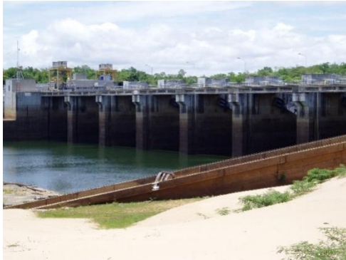
Pak Mun Dam

Fish passes were built into the Pak Mun Dam, but almost completely failed to function correctly (WCD 2000).