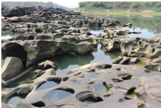
Tana Rapids at the mouth of the Mun River

It is also reported that the forests, which are inundated by rising waters in the rainy season, provide a suitable environment for the breeding of fish species and the growth of young fish (Ternvidchakorn and Horle 2013).