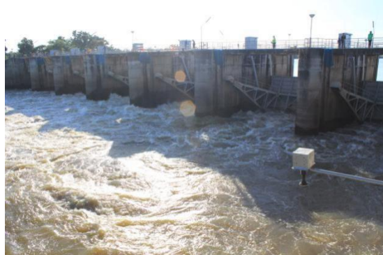
Rasi Salai Dam

The decline in fishery resources and the loss of livelihood opportunities from the use of the wetlands by the local residents led to impoverishment of the local people, who demanded compensation at the time. However, the compensation was not sufficient to recover their livelihoods, and wishing to return to