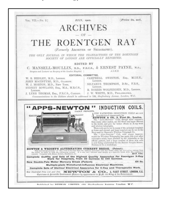
Fig. 3 Archives of the Roentgen Ray from May 1902 with advertisement on the cover

The final change came in 1928 following the amalgamation of the BIR and the Röntgen Society, and the journal The British Institute of Radiology, New Series continues today.