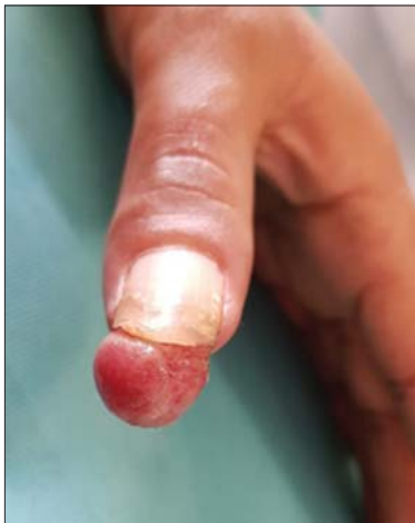
Figure 1: Under ungueal botryomycoma.