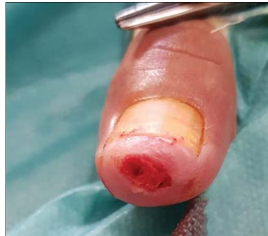
Figure 3: Surgical excision of the pyogenic granuloma.