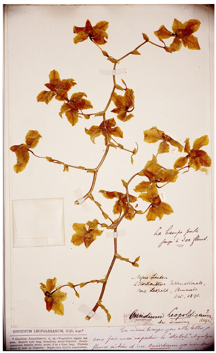
Fig. 1. The holotype of Cyrtochilum leopoldianum , possibly collected by Charles Patin and shipped to Jean Linden in Brussels where it flowered in 1890.

meeting, and was surprised to see the quite distinct but equally handsome O. corvnephorum, Lindley, which had previously only been known from dried specimens. The discrepancy is difficult to account for, as the plant is believed to be one of the original ones, and the respective dried specimens are quite distinct in the structure of the lip. The probable explanation is that the two grow together, and as often happens in the O. macranthum section, may be confused when out of flower. The circumstance affords a clue to the habitat of O. Leopoldianum, which was not recorded. O. corynephorum is a native of Peru and was described by Lindley [1838] from dried specimens collected by Matthews at Moyambambo [sic. Moyobamba; author's note]. With these dried specimens Mr. Ashworth's plant agrees in every respect, and the