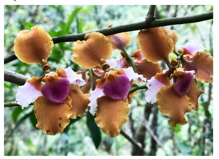
Fig. 6: Flowers of C. volubile from the Huanuco region in Peru.

It appears at this stage that we are dealing with three, possibly four closely related but yet different species. The first one is Cyrt. volubile , or " Onc. corynephorum " fide Lindley, which has brownish flowers and a deep burgundy lip (Figs. 6, 7) The second one is the enigmatic Cyrtochilum leopoldianum (Rolfe) Kraenzl., with white and pale lilac flowers and an obtuse to acute, deep lilac-purple and yellow lip (Fig. 3). The third species would be Mr. Ashworth's awarded plant, which Rolfe erroneously called " Onc. corynephorum ", with a similar coloration as Cyrt. leopoldianum but with a much broader front-lobe of