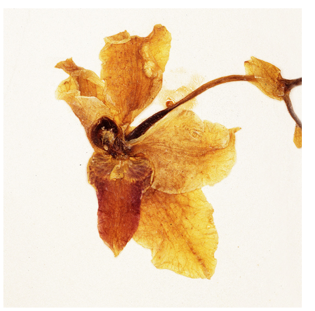
Fig. 2. Close-up of the flower of C. leopoldianum showing the acorn-shaped front-lobe of the lip.

meeting, and was surprised to see the quite distinct but equally handsome O. corvnephorum, Lindley, which had previously only been known from dried specimens. The discrepancy is difficult to account for, as the plant is believed to be one of the original ones, and the respective dried specimens are quite distinct in the structure of the lip. The probable explanation is that the two grow together, and as often happens in the O. macranthum section, may be confused when out of flower. The circumstance affords a clue to the habitat of O. Leopoldianum, which was not recorded. O. corynephorum is a native of Peru and was described by Lindley [1838] from dried specimens collected by Matthews at Moyambambo [sic. Moyobamba; author's note]. With these dried specimens Mr. Ashworth's plant agrees in every respect, and the