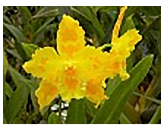
Oda. Wearside Light