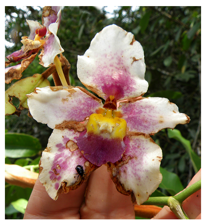
Fig. 16: A flower from the lower part of the same inflorescence as the flower in Fig. 15, showing a broader front-lobe which correlates with the description of " C. villenaorum ".

Cyrtochilum villenaorum (Fig. 16). I also realized that the flowers near the end of the inflorescence had narrower lips than the ones lower down. I could not help grinning. My obvious conclusion was that a strong plant will produce flowers with a broader lip ( villenaorum ), and gradually as the inflorescence develops and drains strength from the plant, the