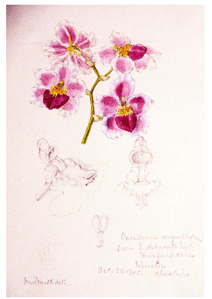
Fig. 4: The colored drawing made by Mr. E. Ashworth, who successfully cultivated the plant that was brought to Robert Allen Rolfe's attention during an orchid meeting in 1905.

species is a very handsome one, as may be seen from the illustration [Fig. 4]. The rounded, undulate sepals and petals are rosy purple, with a broad white margin, and the nearly orbiculate lip is deep violetpurple, with a bright yellow base. In habit and in its long and twining inflorescence the plant recalls O .