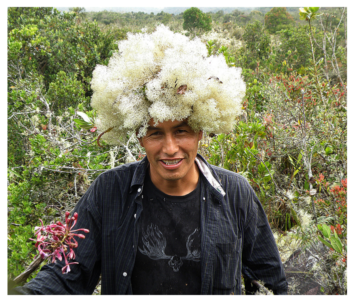
Fig. 12: Local fans of country & western singer Dolly Parton are eager to assist in scientific documentation of new orchid taxa. Here with the flowers of E. septipartitum .