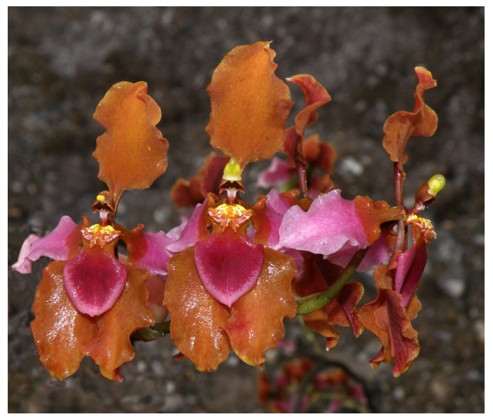
Fig. 7: Flowers of C. volubile from Monopampa, Huanuco, Peru.

former Orchid Identification Center at Selby Gardens for a verification of the species (OIC 15203), where I was the Curator at the time. To my great surprise, there was no doubt concerning the identity of the plant. It was a "dead ringer" for the long lost Cyrtochilum leopoldianum (Fig. 8)!