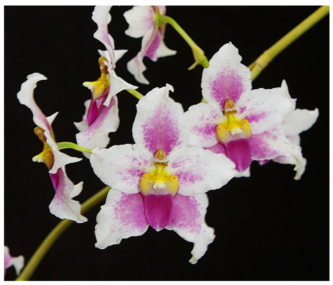
Fig. 20: Cultivated plants of C. leopoldianum from the Moyobamba area maintain much of the distinct and typical flower shape.

Lindley, J. (1838). Oncidium corynephorum. Sertum Orchidaceum. Ridgways & Sons, London. UK. _____. (1855). Oncidium. Folia Orchidacea parts 6 and 7. J. Mathews, London, UK.