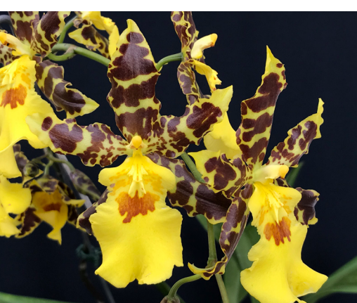
Odontocidium Sol y Sombra

made this cross in September 1980. the seed was sown here at my lab in October 1981, as a green pod. Going still back in the story