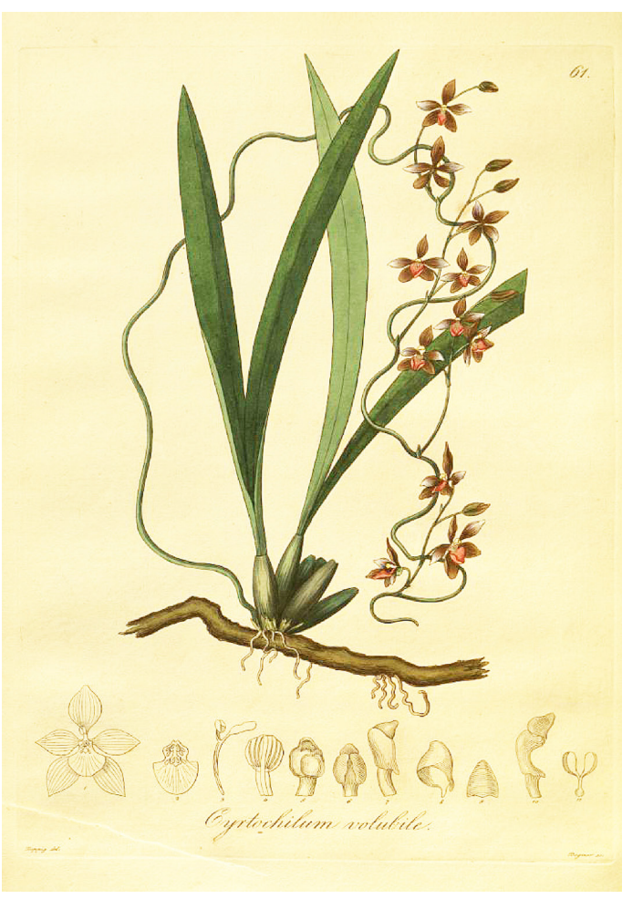
Fig. 5: The type illustration of Cyrtochilum volubile .

The enigmatic identity and origin of Cyrtochilum leopoldianum has been an interesting challenge from day one. The case involves species that are quite distinct and horticulturally desirable, and yet very poorly understood and scarcely represented in live collections. The first plant of this complex was collected in Peru in 1829 by Eduard Friedrich Pöppig (Pöppig # 1799). It was described as Cyrtochilum volubile in Nova Genera ac Species Plantarum [Fig. 5] by Pöppig and Stephan Endlicher (1836). The habitat is later described in English as "tall trees in the mountains of Casapillo, near the hacienda of Cuchero-Pöppig" (Lindley 1855).