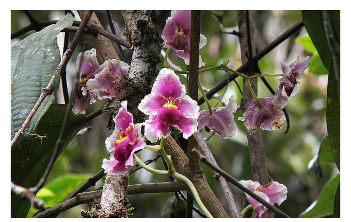
Fig. 18: The magnificent broad-lipped form of C. leopoldianum , misidentified by Rolfe as " Oncidium corynephorum ", and that may need a separate scientific name.

19). The flowers were similar to the ones found near Moyobamba, except that the lip was much broader, the column wings smaller, sometimes lacking entirely, and the pale purple hue on the sepals and petals were without any clear spotting, as can be seen in flowers of C. leopoldianum . This threw a monkey wrench into my ideas about this complex. At this stage there was no longer any doubt in my mind that C. leopoldianum and C. villenaorum indeed are the same species with