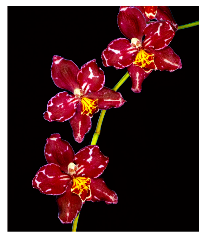
Oda. Prince Vultan × Oda Chargia 'Victor' AM/RHS

Chargia 'Victor', you can see some stunningly patterned results. Now, apparently because of the Cyrtochilum influence, many but not all of