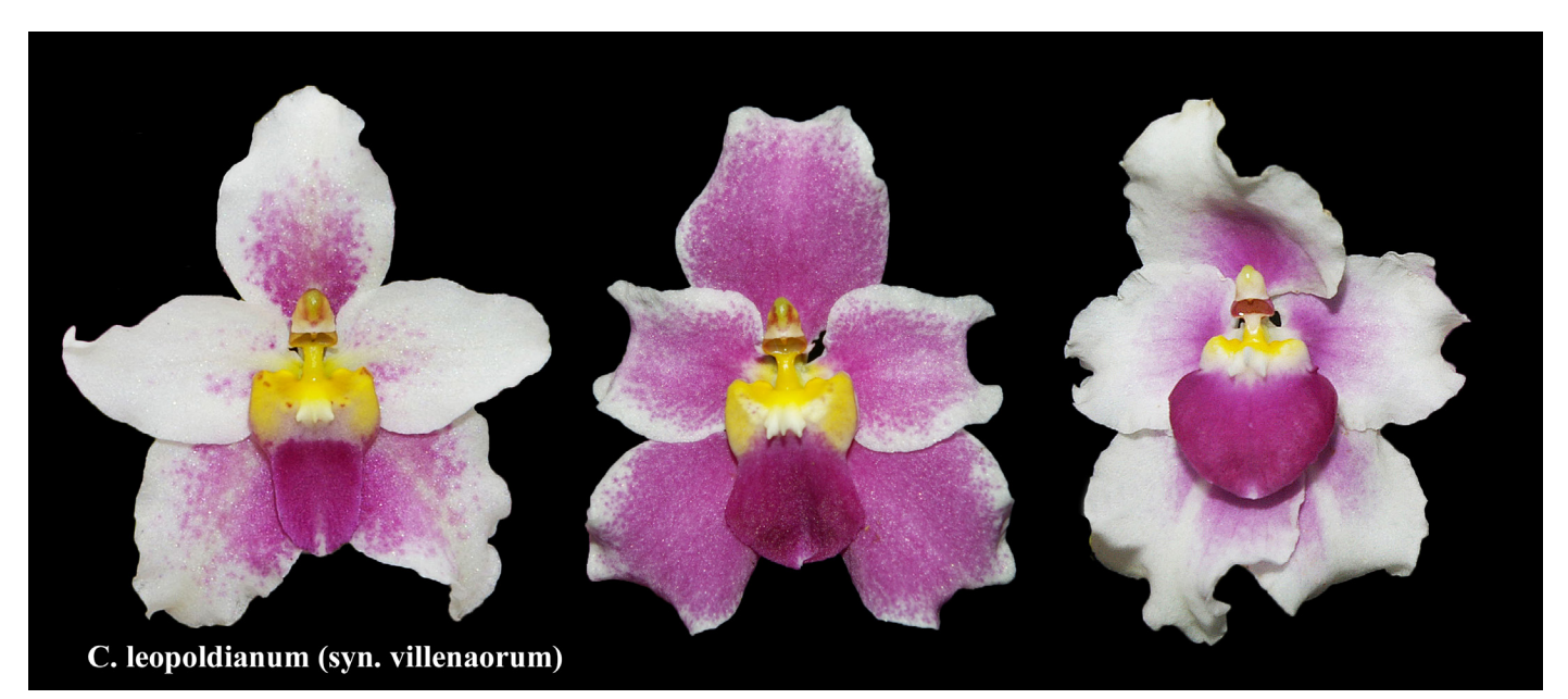
Fig. 22: Natural variation of C. leopoldianum, or distinct species? Photos by Manolo Arias, edited by Stig Dalström.