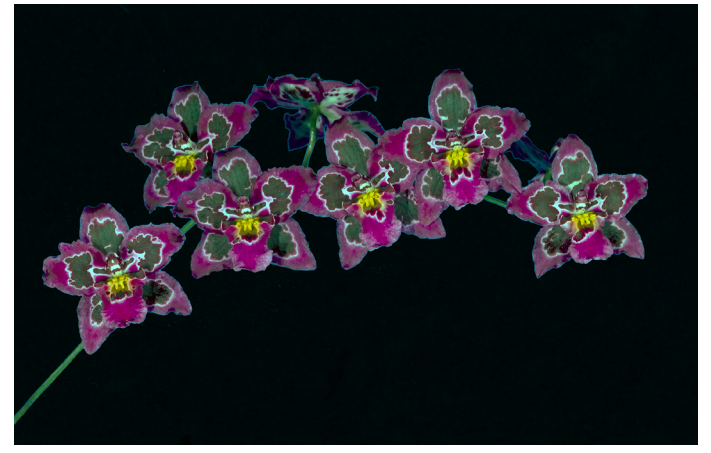
Oda. Chargia 'Victor' AM/RHS

One thing we have to accept if we grow orchids is that some names are incorrect either by an honest error or a deliberate error! This is just a fact of orchid life which we have to live with. The story