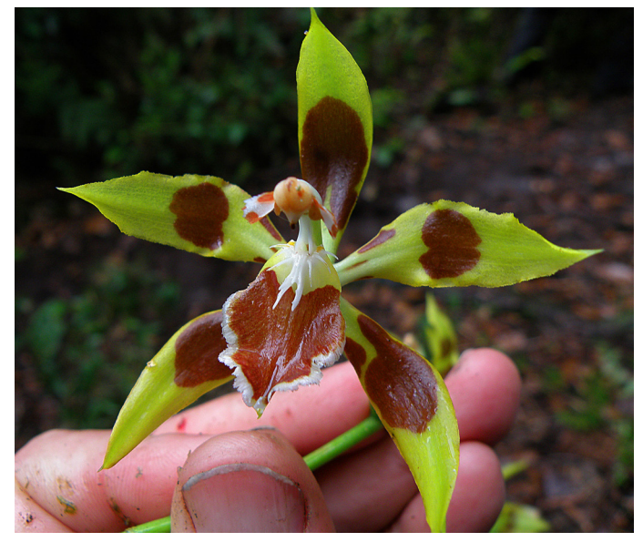
Fig. 13: Flower of Odontoglossum epidendroides , which was discovered not far from the type locality for the genus.

A couple of weeks later, I had the opportunity to visit Moyobamba together with Saúl Ruíz, where we contacted the local orchid matero (professional collector) who had sold the original plant(s) of C. villenaorum to the Villena nursery. After some initial negotiations he agreed to take us to the site where the plants had been found. The plan was to leave Moyobamba "very early" next morning in order to avoid the heat in the middle of the day since there apparently was a considerable climb involved. Our local friend explained that we would have to hike up on a particular ridge and that it would be rather heavy (sweaty) unless we could get there early in the day.