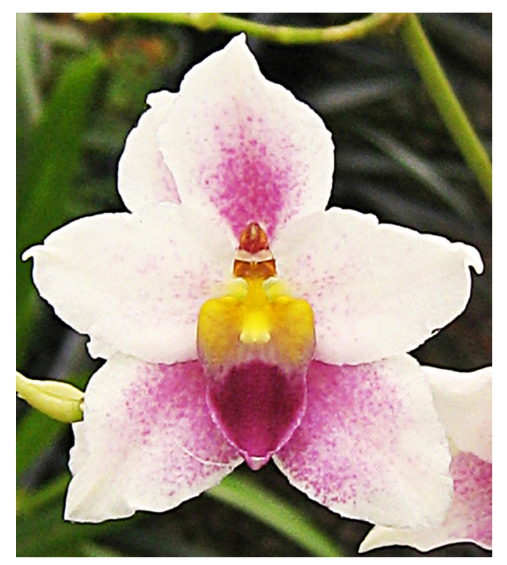
Fig. 8: Tom Etheridge's photo of a plant purchased as "C. villenaorum", but turned out to be the first modern record of C. leopoldianum.

former Orchid Identification Center at Selby Gardens for a verification of the species (OIC 15203), where I was the Curator at the time. To my great surprise, there was no doubt concerning the identity of the plant. It was a "dead ringer" for the long lost Cyrtochilum leopoldianum (Fig. 8)!