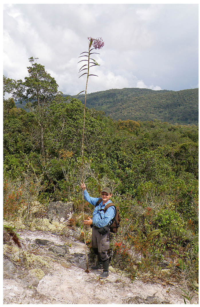
Fig. 10: Epidendrum septipartitum , the world's tallest Epidendrum .