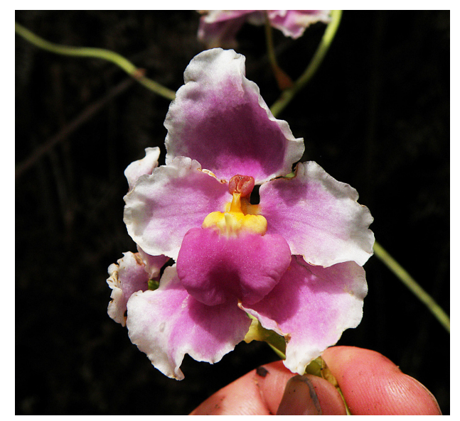
Fig. 19: It doesn't get any better than this! At least not in Cyrtochilum , or...?

the former name having priority over the latter. But how to handle this third "species", with a much broader lip and a different coloration? Coincidently, it agreed perfectly with Mr. Ashworth's awarded plant (Fig. 4), and what Rolfe considered to be "quite distinct" from his Cyrtochilum leopoldianum .