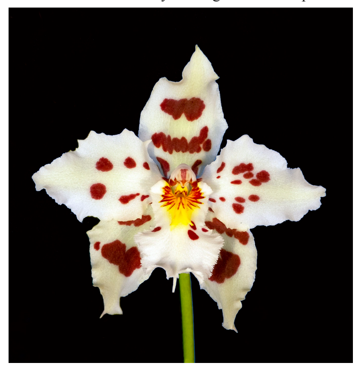
Odm . Warnhamense 4n

This remake of a hybrid first registered over a century ago in a tetraploid version is interesting. The original combination of Odm. hallii × Odm. pescatorei / nobile went nowhere with a hybrid registration endpoint in