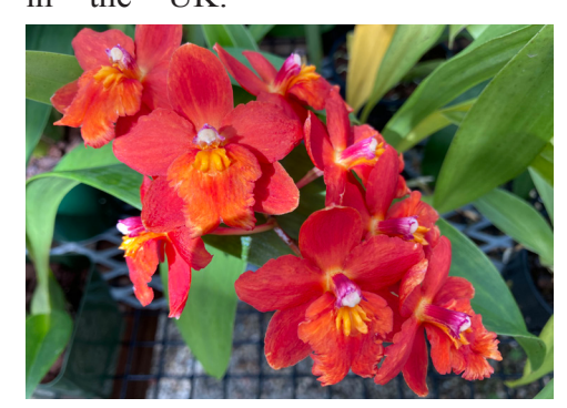
Harry Baldwin is made up in part of Odm. crispum 55%, Cochi oda noezli ana 9%, and Odm. harrya num 8%.