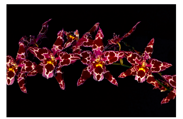
Oda . Shelley 'Spring Dress' × Oda . Chargia 'Victor' AM/RHS

Chargia 'Victor', you can see some stunningly patterned results. Now, apparently because of the Cyrtochilum influence, many but not all of