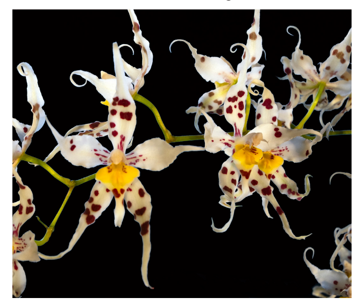
Odm. cirrhosum 4n