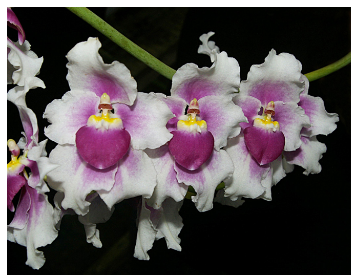
Fig. 21: Does the difference in the lip shape justify describing this taxon as a distinct species?