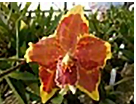
Oda. Mont Remen × Panise

The great thing about breeding with Odonts is that you might not get many flowers turning