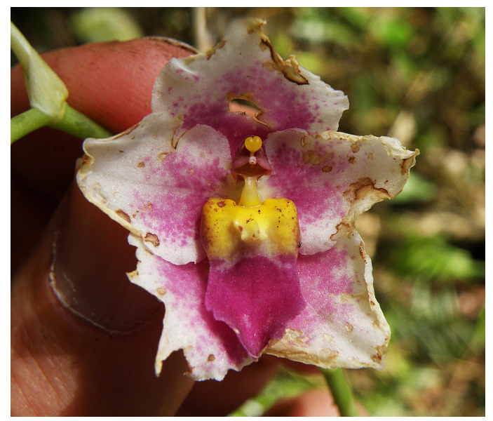
Fig. 15: A weak flower from the top of the inflorescence of a C . leopoldianum plant from the type locality of " C. villenaorum ".

I studied the flowers and could not believe my eyes. The flowers looked just like Cyrtochilum leopoldianum (Fig. 15). Or rather, some of them did while others had a broader lip and hence would be