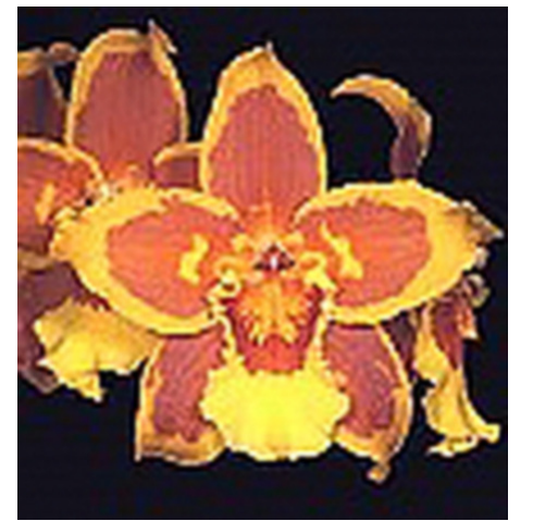
Hamiltonara Golden Harry 'Gold Vision' AM/AOS

But if we wanted to start a new line of breeding, we could combine