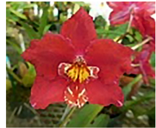
Oda. Leysa 'Mary G.' AM/AOS

back out the purple surface cells results in visually flowred There ers. is more to this story but that can wait for another article.