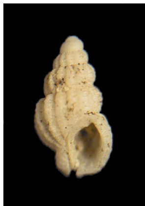
Figure 7 Nassarius albus (Say, 1826) 4mm

The second location that he sampled from was .....(stay tuned for the part 2 in our next issue)