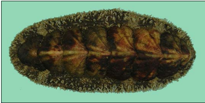
Nuttallina californica [(Nuttall MS) Reeve, 1847] 28 mm Whites Point, Palos Verdes Peninsula a different color form

Most specimens of this species are extremely surf-worn and unattractive. In more protected localities, however, one can encounter unworn examples of this chiton with beautifully sculptured black or dark brown valves streaked with pink, tan and white (see photos). The girdle is somewhat narrow and completely covered with spiny spicules, often in light and dark bands.