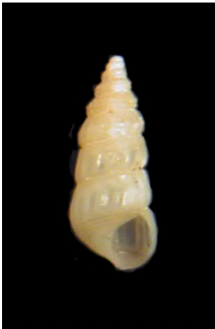
Figure 5 Finella adamsi (Dall, 1889) 2mm