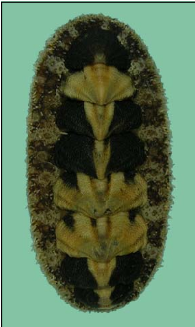
Nuttallina californica 24 mm