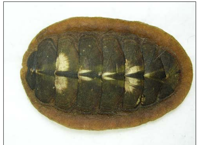
Mopalia acuta (Carpenter, 1855) 62 mm Cabrillo Breakwater, San Pedro, California

Leptochiton rugatus is a white to cream colored species with smooth, rounded valves. Most of the specimens found at the pictured site are stained with black (see photo below).