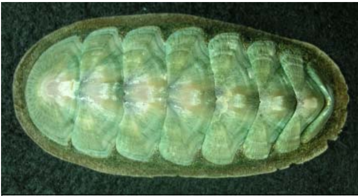
Stenoplax conspicua (Pilsbry, 1892) 73 mm Bird Rock, La Jolla, San Diego County