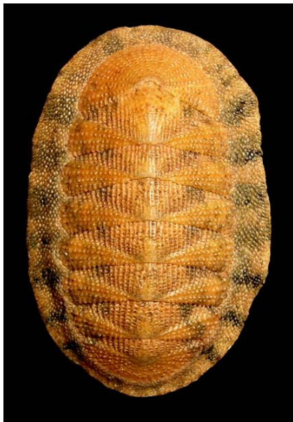
Lepidizona pectinulata Carp. in Pilsbry, 1893) 24.5 mm