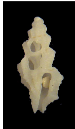
Figure 9 Glyphoturris quadrata diminuta C. B. Adams, 1850 4mm

Finally, one of my favorite families, the Turridae. Once again, another rubble-loving family with beautiful sculpture and form. The two turrids that occurred in this particular lot were Glyphoturris quadrata diminuta C. B. Adams, 1850 (Fig.9) and Pyrgocythara candidissima (C. B. Adams, 1845) (Fig. 10). Several of the Pyramidellidae occurred including species from the genera Odostomia and Turbonilla . Both genera are extremely confusing due to the large number of species in the region and the lack of good references for identifying them. The closest identification I could arrive at was Turbonilla haycocki Dall & Bartsch, 1911 (Fig. 11).