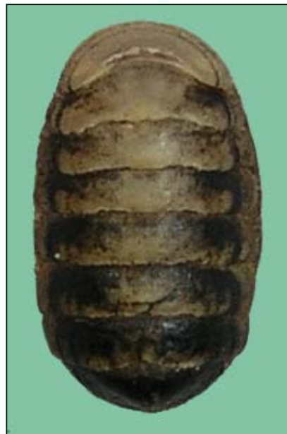
Leptochiton rugatus (Pilsbry, 1892) Palos Verdes Peninsula 7.5 mm