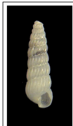
Figure 11 Turbonilla haycocki Dall & Bartsch, 1911 4mm

The bivalves seemed to be more uncommon than the gastropods, particularly because the micro bivalves don't occur as frequently in this particular area. Nonetheless, I did find a valve of Arcopsis adamsi Dall, 1886 (Fig.12). Overall, I was quite satisfied with what turned up in the sand sample and it was astonishing to find so many shells in sand that was sampled by someone without any conchological knowledge.