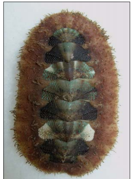
Mopalia cf. lowei (Pilsbry, 1918) Cabrillo Breakwater 39 mm