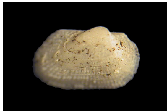
Figure 12 Arcopsis adamsi Dall, 1886 4.5mm