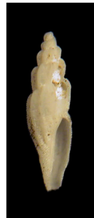
Figure 10 Pyrgocythara candidissima (C. B. Adams, 1845) 4mm