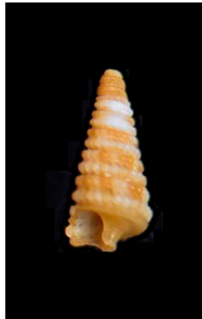
Figure 6 Triphora ornata (Deshayes, 1832) 2mm