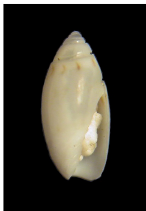
Figure 8 Olivella rosolina (Duclos, 1835) 4.5mm