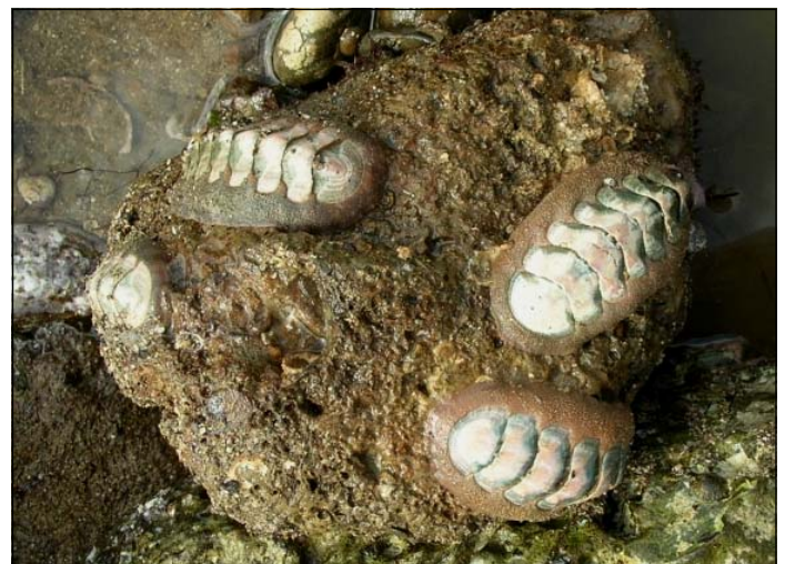
Stenoplax conspicua (Pilsbry, 1894) 4 mature specimens on the underside of a rock from the locality pictured on page 2.