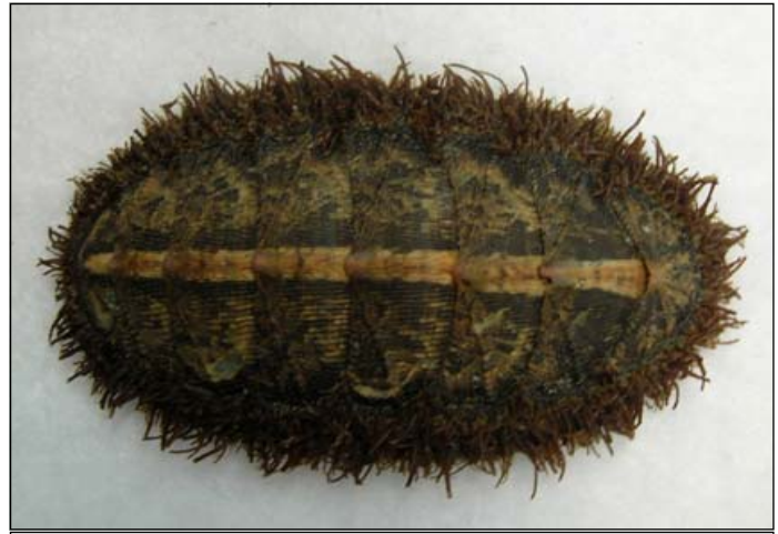
Mopalia muscosa (Gould, 1846) 44 mm Cabrillo Breakwater, harbor side, San Pedro, CA

Lepidochiton hartwegii is a medium sized (under 30 mm) oval chiton with valves usually colored greyish green, sometimes with longitudinal streaks of a darker green or black. The valves appear fairly smooth to the naked eye.