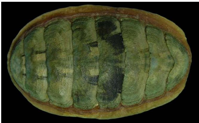
Lepidochitona hartwegii (Carpenter, 1855) 26 mm Palos Verdes Peninsula, Los Angeles Co., California

This species is usually found under clumps of the brown algae, Rockweed ( Silvetia compressa — formerly known as Pelvetia fastigiata ) upon which it feeds. Most of the specimens of this chiton are also heavily eroded due to the normal stresses of their surf-swept environment.