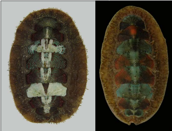
Mopalia cf. lowei (Pilsbry, 1918) 36 mm & 34 mm Cabrillo Breakwater, San Pedro, California Two additional color forms