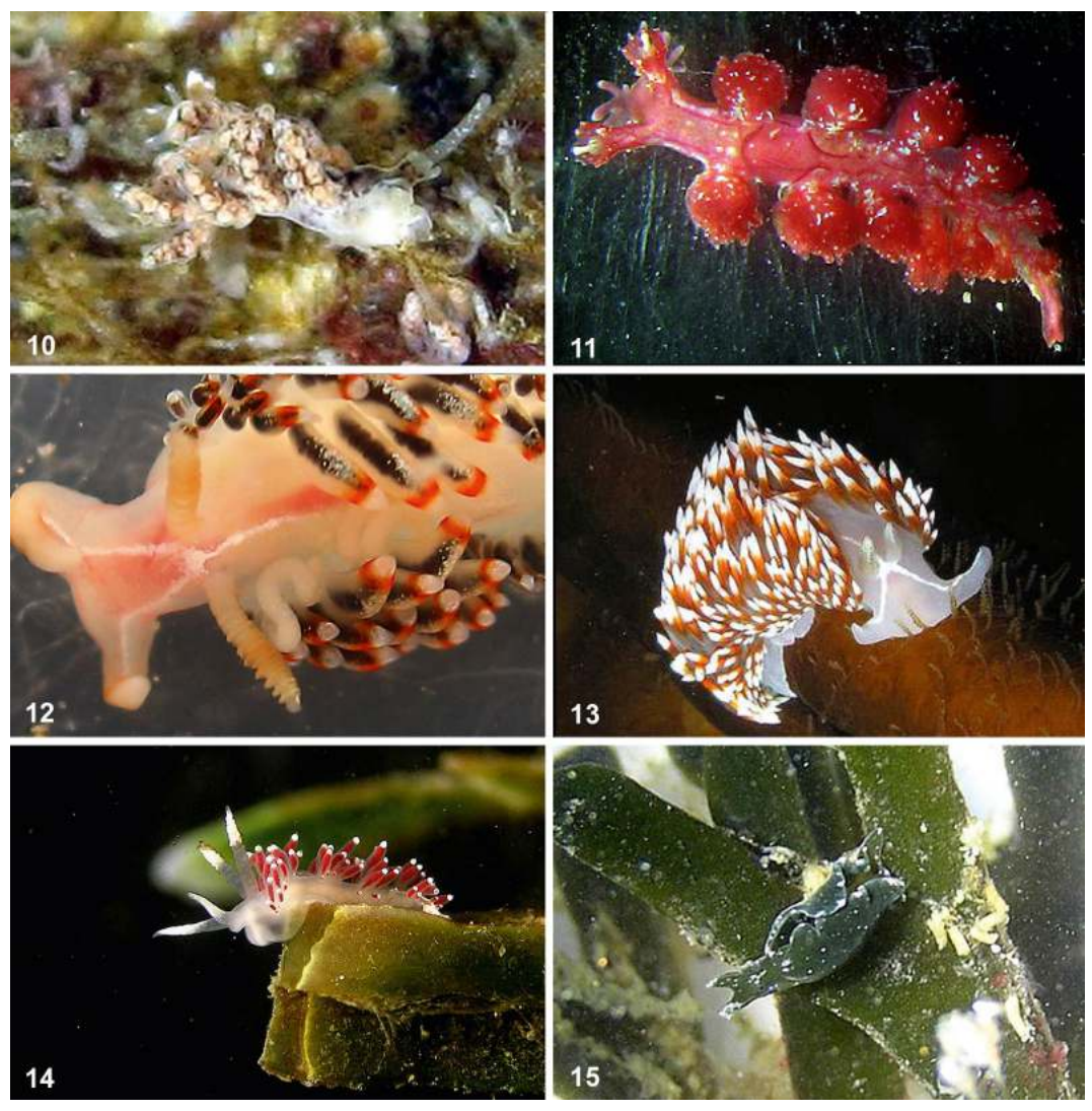
Figs 10–15. Peruvian sea slug species, living specimens. 10. Doto cf. uva (ca 5 mm), Callao. 11. Hancockia schoeferti (ca 1.5 cm), San Juan de Marcona. 12. Phidiana lottini (ca 2 cm), infested with splanchnotrophid endoparasites, 2 pairs of egg-sacs protruding from body; San Juan de Marcona. 13. Phidiana lottini (ca 3 cm), non-infested; Paracas. 14. Flabellina cf. cerverai (ca 7 mm), Sechura Bay. 15. Elysia cf. hedgpethi (ca 5 mm), Paracas.

cal and histological detail; these authors suspected that a complex of cryptic species may explain the considerable external and colour variation observed. Our specimens from San Juan de Marcona resemble Chilean specimens by having quite stout cerata, while specimens from Paracas and Callao may