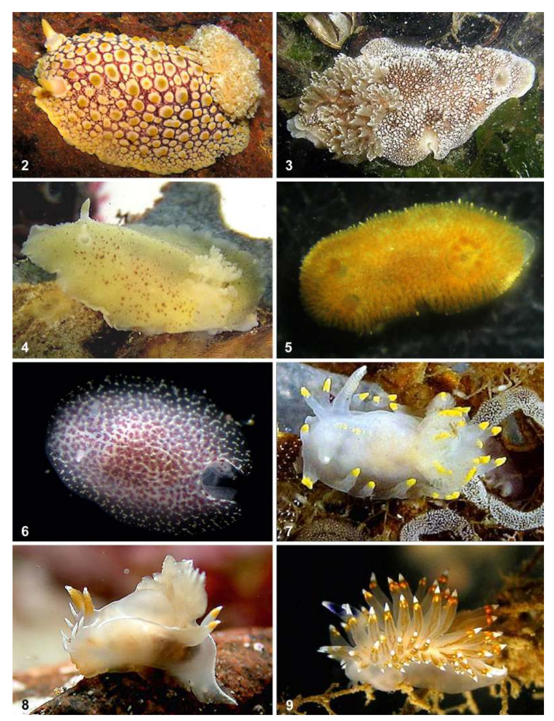
Figs 2-9. Peruvian sea slug species, living specimens. 2. Doris fontainei (ca 5 cm), San Juan de Marcona. 3. Diaulula variolata (ca 5 cm), San Juan de Marcona. 4. Baptodoris peruviana (ca 3 cm), San Juan de Marcona. 5. Rostanga cf. pulchra (ca 1 cm), San Juan de Marcona. 6. Corambe lucea (ca 1 cm), Callao. 7. Okenia luna (ca 1 cm), with egg masses, Callao. 8. Polycera priva (ca 2.5 cm), Paracas. 9. Janolus rebeccae (ca 2 cm), Paracas.