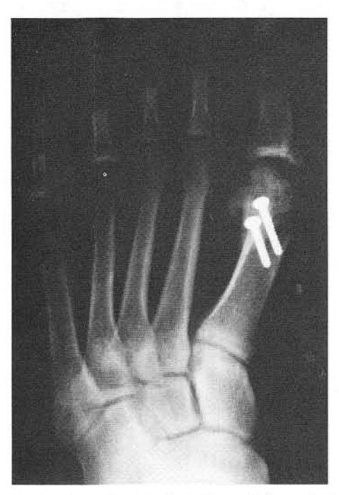
Fig. 3. Phase of revascularization with bone deposition and resorption (collapsed phase).