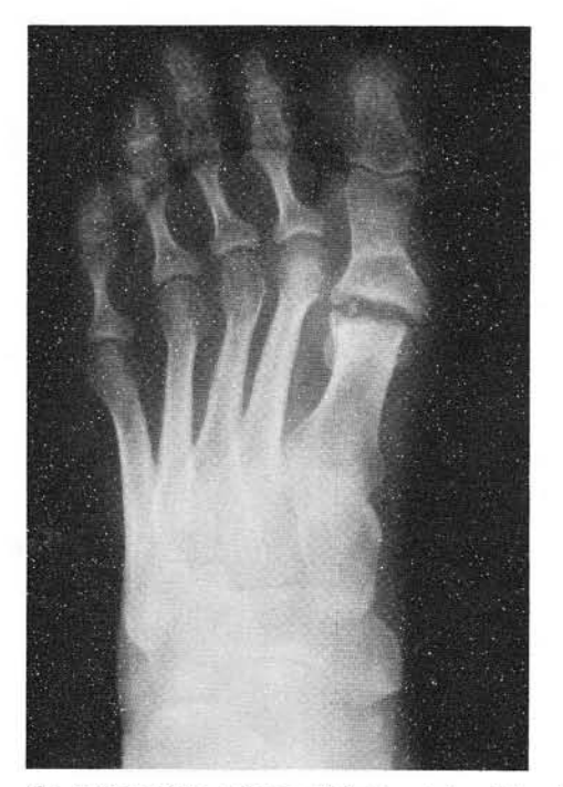
Fig. 7. Complete collapse of first metatarsal head.

In May of 1988 the patient presented with a new chief complaint of pain and callus under the second, third, and fourth metatarsal heads of the left foot of approximately one year duration. Clinical evaluation revealed a shortening of the great toe with decreased range of motion. Gait analysis demonstrated a slight limp with an apropulsive gait. Radiographs displayed complete absence of the first metatarsal head with associated contractures of the lesser digits (Fig. 7). Conservative care with an orthotic device failed to relieve the symptoms.