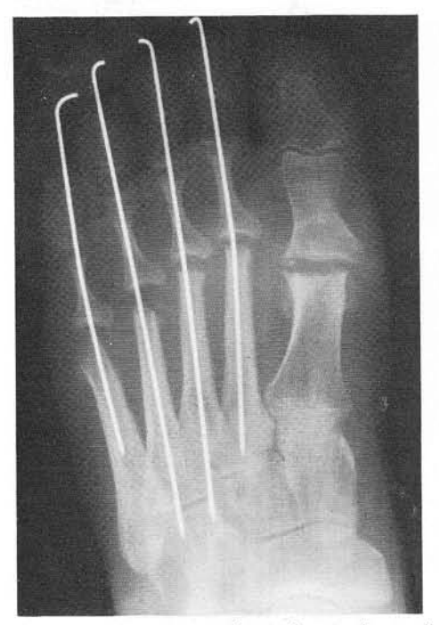
Fig. 8. Postoperative radiograph reveals excellent correction with Kirschner wire (K-wire) fixation.