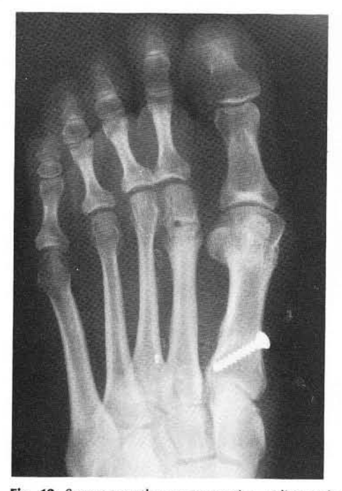
Fig. 12. Seven months postoperative radiographs reveal radiolucent area in second metatarsal head following removal of internal fixation screw.