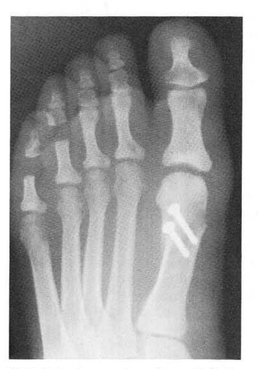
Fig. 2. Early phase or phase of avascularity (pre-collapsed phase).

The phase of revascularization is characterized by deposition of new bone and resorption which represents the vascular reaction of the surrounding tissues to necrotic bone. These changes are readily detectable radiographically. Radiographs reveal increased radiodensity of the metatarsal head as new bone is laid down on dead trabeculae. Nuclear bone scans during this stage reveal an increased uptake. This new bone is easily modeled into either a normal or abnormal shape depending on the biomechanical forces applied during this stage. During the revascularization phase a pathologic fracture may occur at the point of maximal stress. This may result in pain, synovial effusion, and limitation of motion. Continued micro trauma and motion promotes fibrous and granulation tissue resulting in osteoclastic resorption. This may involve only a portion of the metatarsal head or in severe cases the entire head may