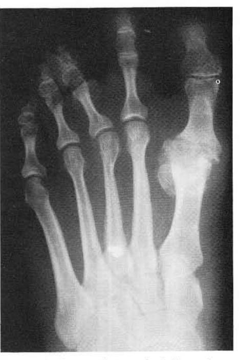
Fig. 19. Final x-rays three and a half months postoperatively second hallux valgus surgery reveal persistant residual deformity of the first metatarsophalangeal joint.

Follow-up radiographs in February 1988 demonstrate continued deformity and aseptic necrosis in the final phases of deformity characterized by obvious residual deformities of the metatarsal head with associated incongruity of the joint, limitation of motion, and development of severe degenerative joint disease (Fig. 18).