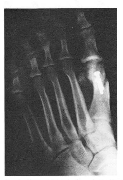
Fig. 4. Phase of bone healing characterized by early and late regenerative and arthritic changes.