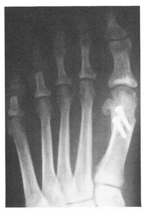
Fig. 5. Phase of deformity characterized by obvious residual deformity.

head associated with joint narrowing involve aseptic necrosis of bone. Serial radiographics pre and postoperatively may help provide an accurate diagnosis in these cases. A low grade septic joint can be difficult to diagnose and can be misdiagnosed as an aseptic necrosis.