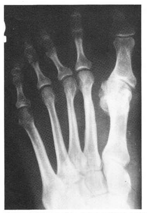
Fig. 16. Early phase of avascularity or the pre-collapsed phase of aseptic necrosis six months following second hallux valgus surgery.