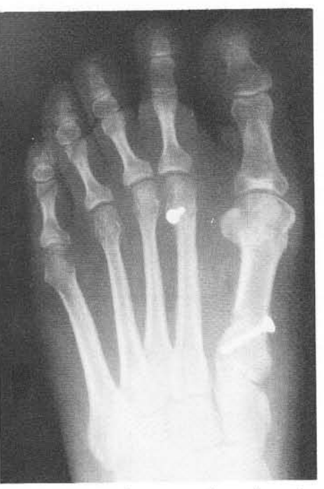
Fig. 11. Four month postoperative radiographs reveal adequate bone healing with recurrent hallux valgus deformity.

The symptoms progressed and were non responsive to conservative care. Additional surgery was required in February of 1985. An Austin-McBride hallux valgus repair was performed and K-wire fixation utilized. An osteotomy of the third metatarsal was also performed (Fig. 14). The