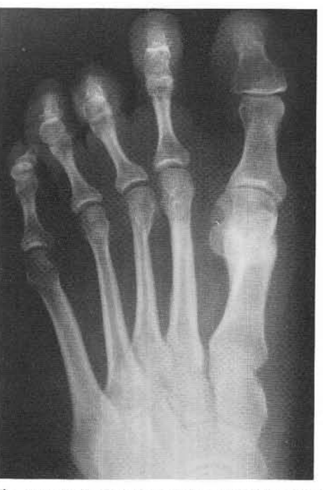
Fig. 15. Excellent postoperative correction of recurrent hallux valgus with mild hallux varus.

The patient coninued to complain of pain under the third metatarsal with recurrent intractable keratosis and also decreased range of motion of the great toe. Radiographs in October 1987 revealed increased radiodensity and collapse of the first metatarsal head (Fig. 17).