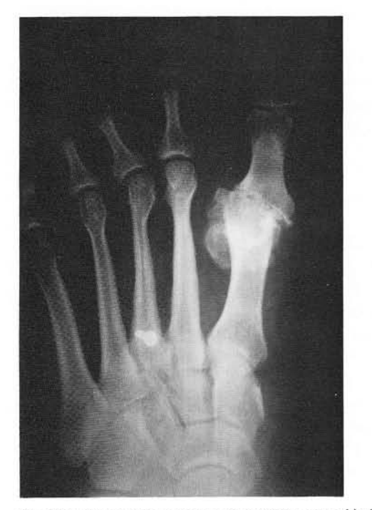
Fig. 18. Thirty-eight months postoperative second hallux valgus surgery reveal residual deformity of the first metatarsal head with incongruity, limitation of motion, and the development of severe degenerative joint disease.

representing the vascular reaction of the surrounding tissues to necrotic bone. In this case the new bone is readily molded into an abnormal shape as biomechanical forces are applied to the first metatarsophalangeal joint. This late stage of revascularization is also referred to as the collapsed phase of aseptic necrosis.