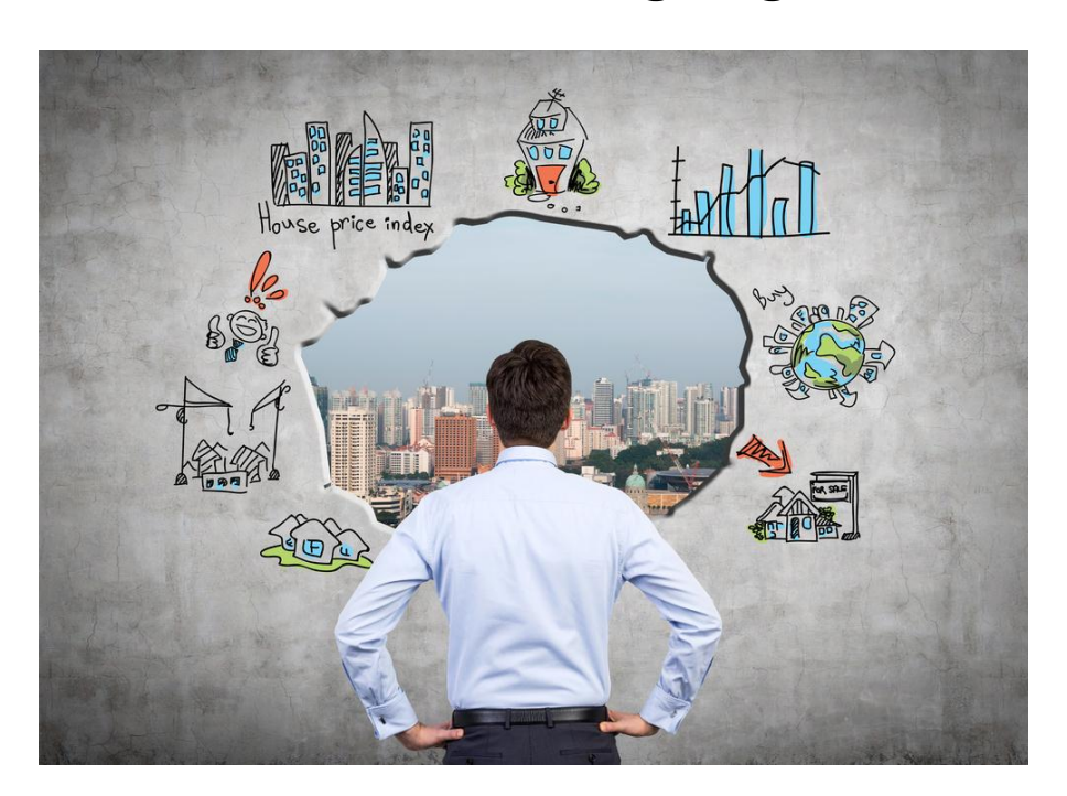
The Company's Vision - what's that?

It amazes me how many people, at all levels of an organization, don't know what the Vision of their organization is. No clue. For example, I was working with a very large organization in September, training eight executives about the importance of transformational leadership in their business.