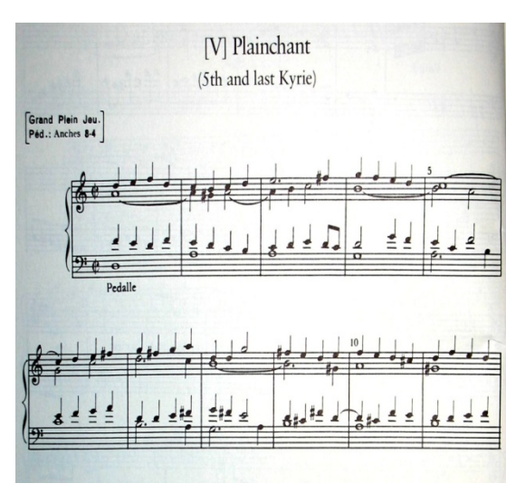
sample from organum