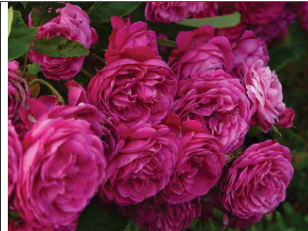
Geschwinds Schönste, C