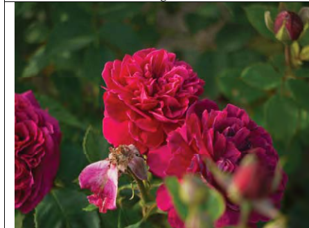
Erinnerung an Schloß Scharfenstein, C