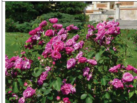
Futtacker Schlingrose, R