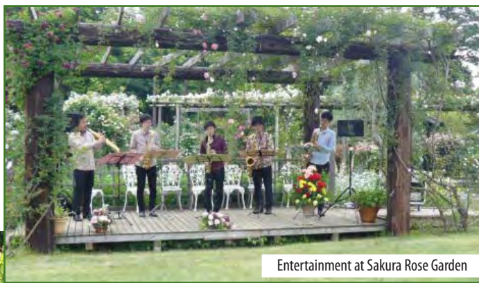
Entertainment at Sakura Rose Garden

The driveway to the house divided the western cottage garden on the right from the traditional Japanese garden on the left which encompassed both the home and their private tea house. This invited quiet contemplation as one walked around the stone pathways winding between an array of conifers, camellias, maples, ferns and rhododendrons.