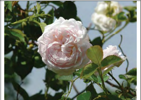
Ännchen von Tharau, R