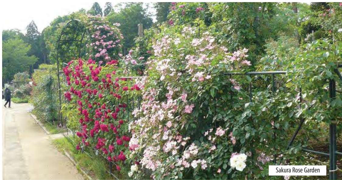
Sakura Rose Garden