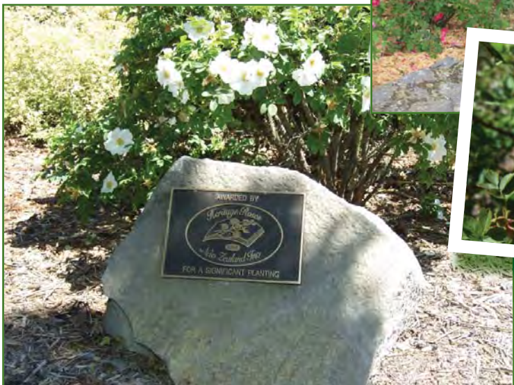
the Timaru Botanic Gardens Species Rose Garden, New Zealand