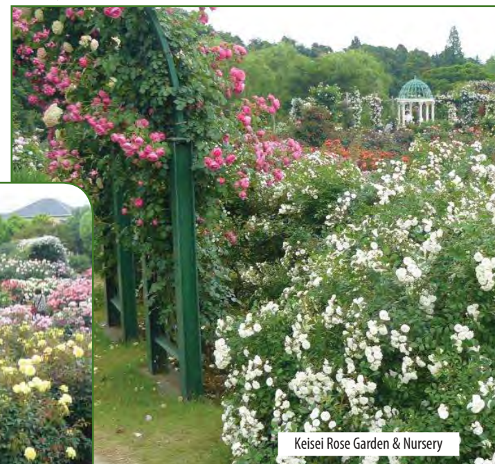
Keisei Rose Garden & Nursery