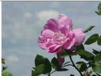
This rose seems not to be 'Griseldis', C