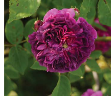
Erinnerung an Brod, C