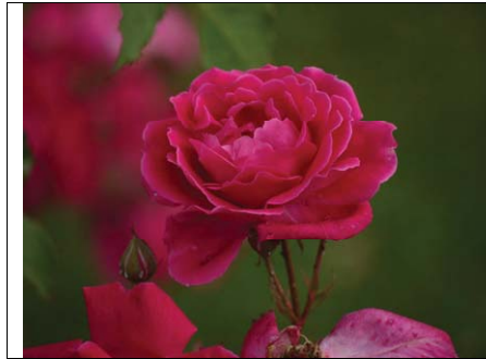
Gruß an Teplitz, R