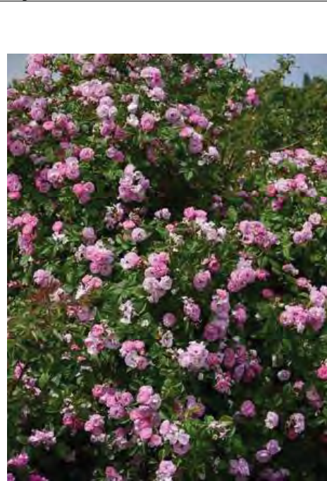
Debatable identity: 'Mercedes', C