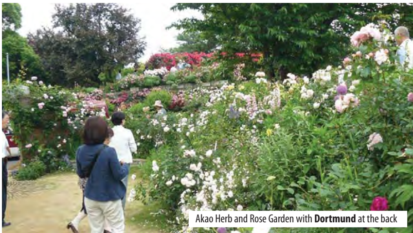
Akao Herb and Rose Garden with Dortmund at the back

It was soon afterwards that our buses stopped at a lookout point and it was here that we got our first (and only) view of Mt Fuji, just as it looks in all the pictures, a scene from a fairy story – a single, completely symmetrical, volcanic mountain peak covered with snow. We were all very excited especially as we were told that at this time of the year the view is usually completely cloud covered.