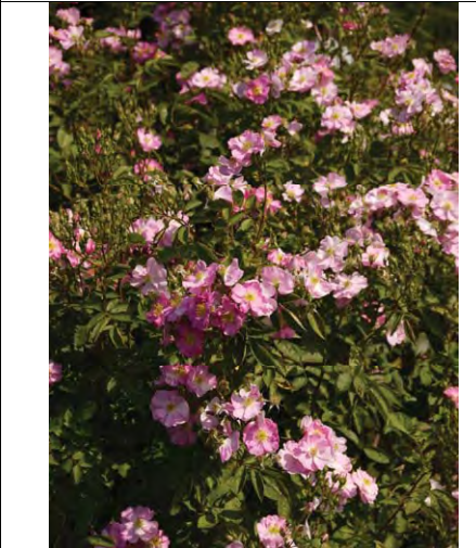
Theano, R – Debatable identity