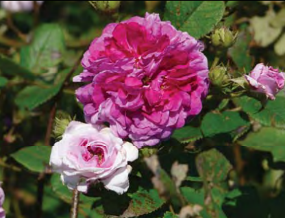
This rose has been wrongly identified as 'Himmelsauge', C