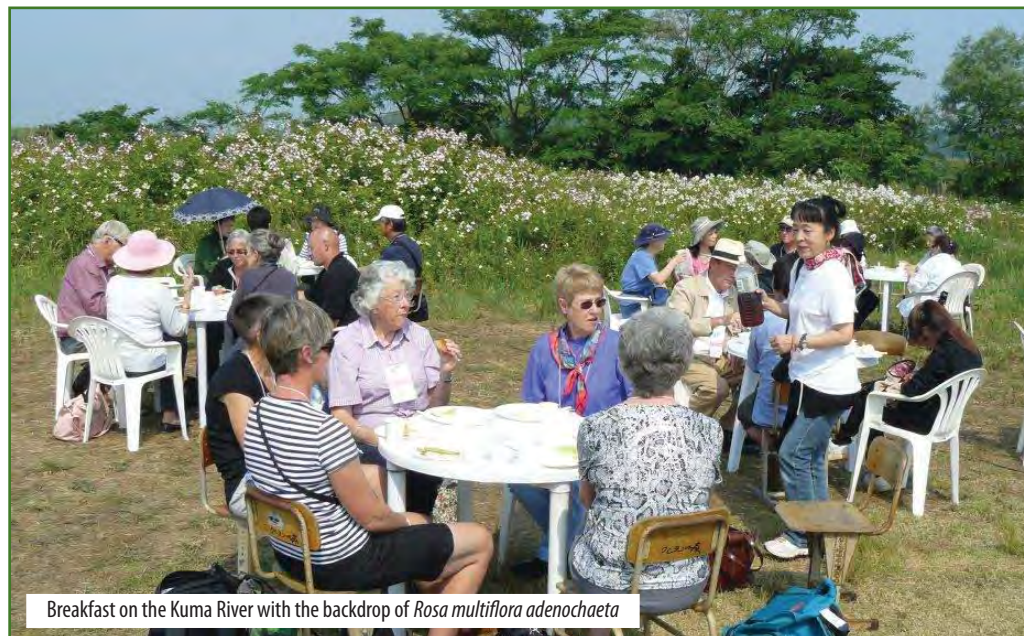
Breakfast on the Kuma River with the backdrop of Rosa multiflora adenochoeta