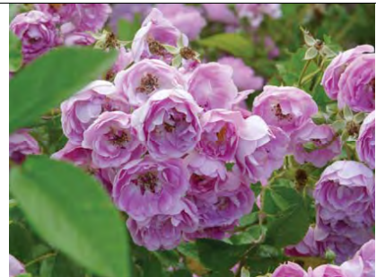
This rose is wrongly identified as 'Erlkönig', C