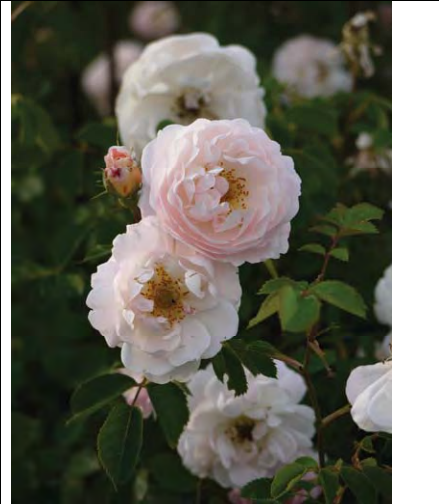
Most probably Geschwind's 'El Areana', C