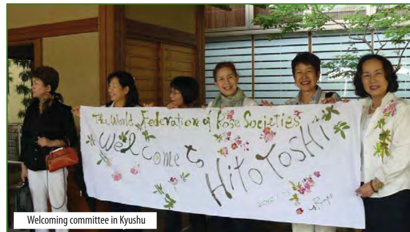
Welcoming committee in Kyushu