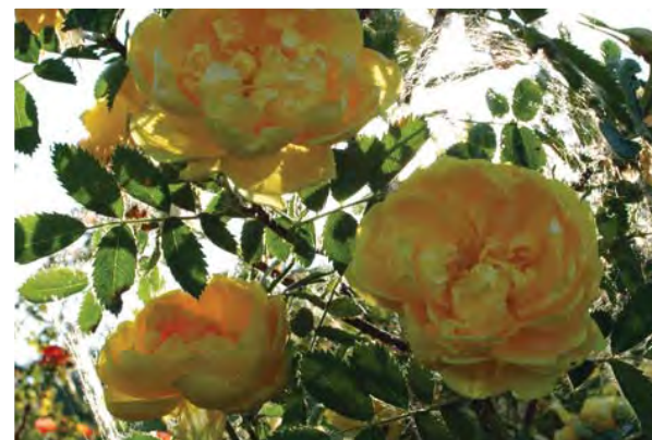
Rosa lutea Persian Yellow

Origins: a seedling of Prince Rurik variety. "Habit is quite similar to R. rugosa . Medium high. Stems are thick; the foliage is of a beautiful pale green colour. Blooms abundantly from spring until the snow in autumn. Buds are of a conic shape of medium length, black-reddish colour. Blooms are large, of reddish-blue- slate colour. Very rare unparalleled colour. The variety is "definitely hardy".