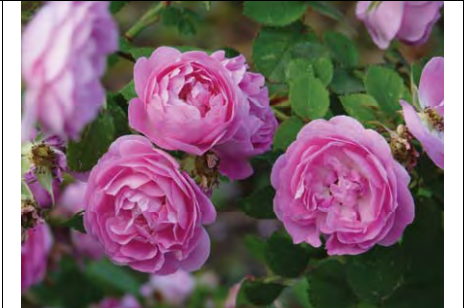
Forstmeisters Heim, C