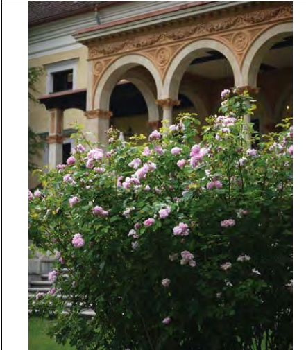
Geschwinds Nordlandrose I, R