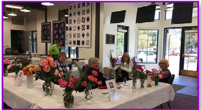
Our Fantastic SCVRS Team Members Greeted Visitors