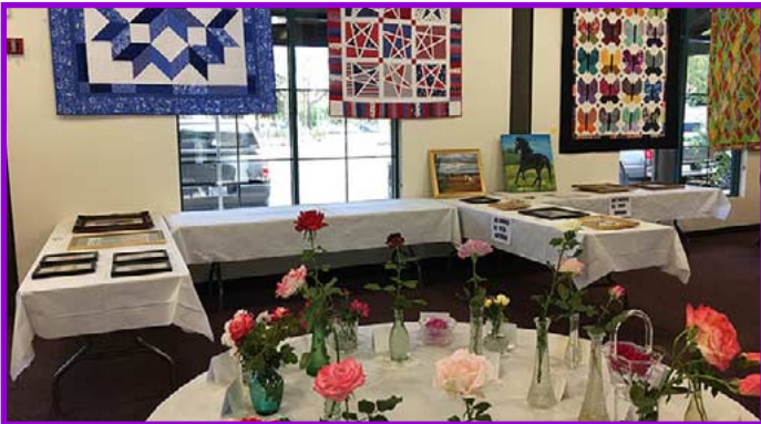
Quilts, Art, and Roses