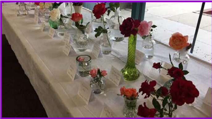
More Rose Specimens on Display