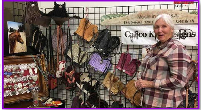
Hand-Crafted Purses Made Out of Boots