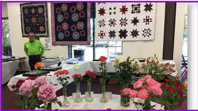
Jerry Mathers with Hand-Made Quilts Among the Roses