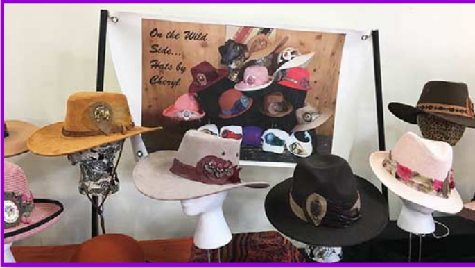
Hand Crafted Western Hats on Display and For Sale