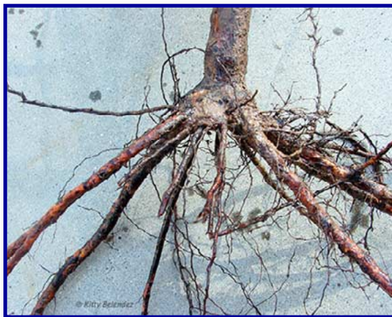
These are the roots of the rootstock.

Would you prefer hybrid teas, floribundas, climbers, old garden roses, shrubs, or miniatures? What colors do you like? Is