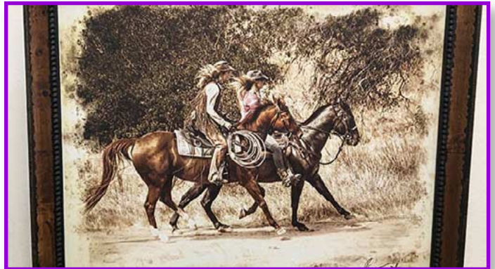
Western Themed Photo Art by Jerry Cowart