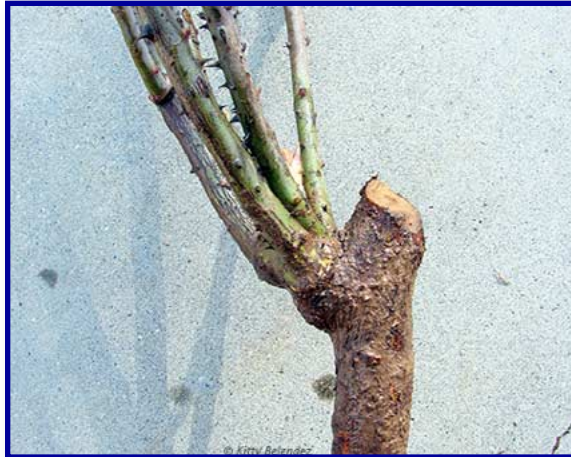
The top growth is the grafted bud union where the hybrid rose is grafted onto the rootstock.

For Santa Clarita locals I recommend either Green Thumb Nursery in Newhall, or Otto & Sons Nursery in Fillmore.