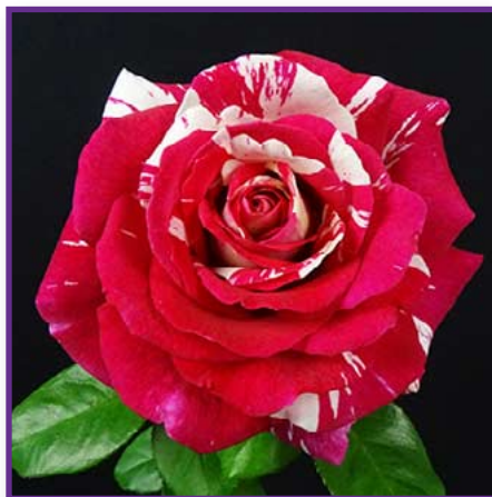
'Neil Diamond' Hybrid Tea Rose Red & White Blooms, Long Stems, 5-feet