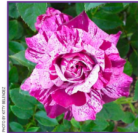
'Purple Tiger' Floribunda Rose Purple & White Striped Blooms, 3-feet

You can bid as many times as you want, in at least $1.00 increments. See Rafflemaster Beverley to write your name on the bid list.