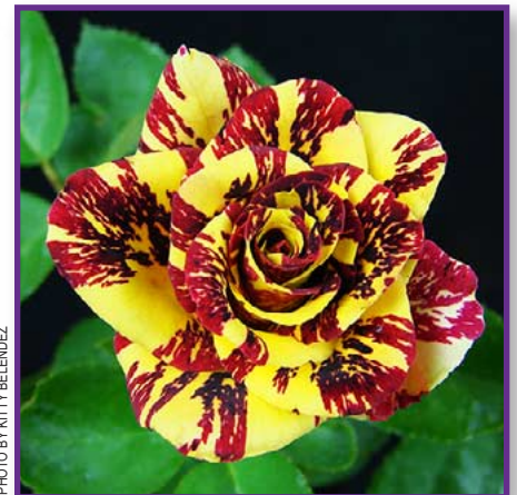
'Alakazam' Miniflora Rose Red & Yellow Striped Blooms, 3-feet

MEMBERSHIP FEES ARE NOW DUE. PLEASE MAIL YOUR CHECK PAYABLE TO SCVRS WITH THE FORM AT RIGHT THANK YOU!