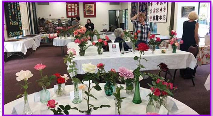
Lots of Roses and Hand-Made Quilts on Display