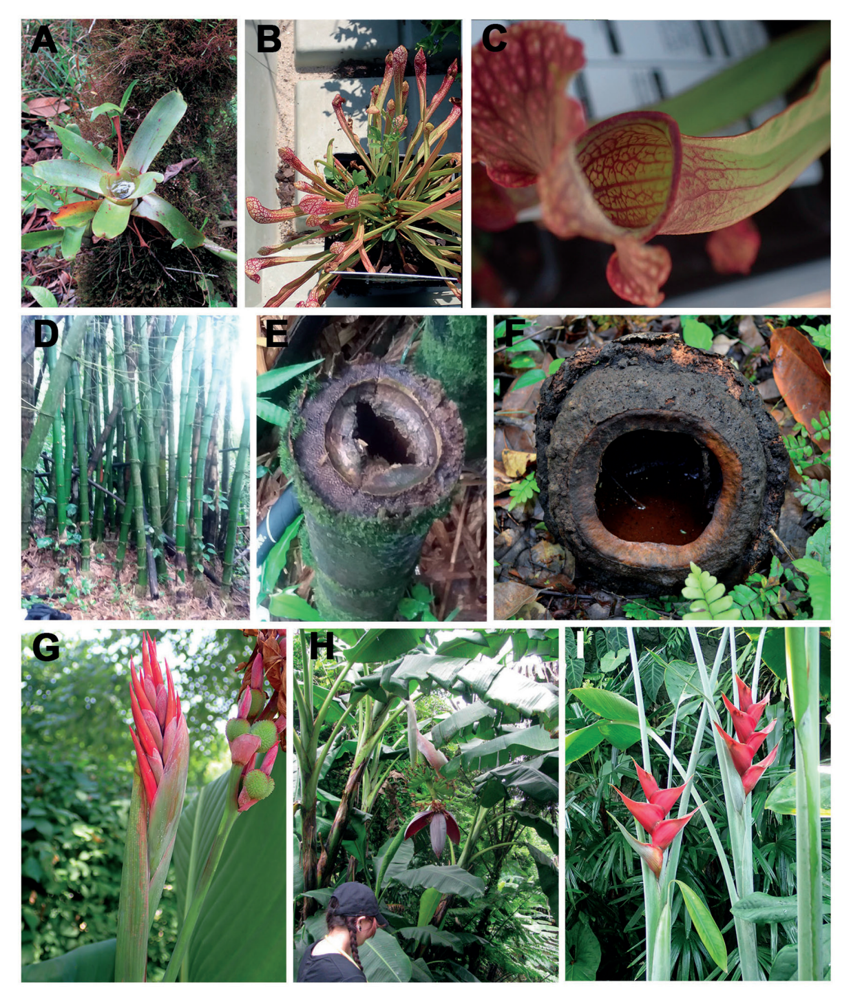
Figure 1. Diversity of phytotelmata. A. Bromeliaceae, Trinidad and Tobago. B. Pitcher plant. C. Pitcher. D. Bamboo, Puerto Rico. E. Bamboo phytotelmata, Puerto Rico. F. Fallen seed pod, Brazil nut (Lecythidaceae), Trinidad and Tobago. G. Canna (Cannaceae), garden, Kansas City, U.S.A. H. Musa (Musaceae), Peru. I. Heliconia (Heliconiaceae), Missouri Botanical Garden, U.S.A.