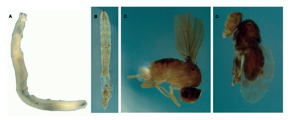
Figure 5. Diptera found in phytotelmata of Calathea capitata (Marantaceae), Peru. A. Limoniidae Iarva. B. Possibly Limoniidae Iarva. C. Drosophilidae. D. Undetermined.