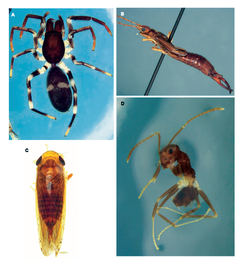
Figure 3. Arthropods found in phytotelmata of Calathea capitata (Marantaceae), Peru. A. Spider, Araneae: Corinnidae. B. Dermaptera: Spongiphoridae: Purex poss. frontalis (Dohrn, 1864). C. Hemiptera: Cicadellidae: Tenuicephalus sp. D. Hymenoptera: Formicidae.