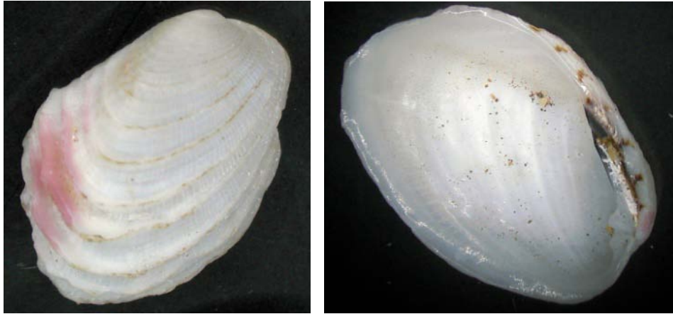
Iruus irus (Linnaeus, 1758) (L - 12mm)