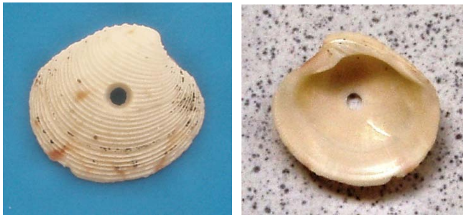
Venus declivis Sowerby, 1853 (L - 30mm)