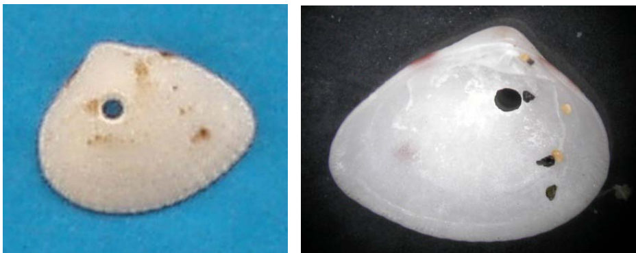
Timoclea ovata (Pennant, 1777) (L - 7mm)