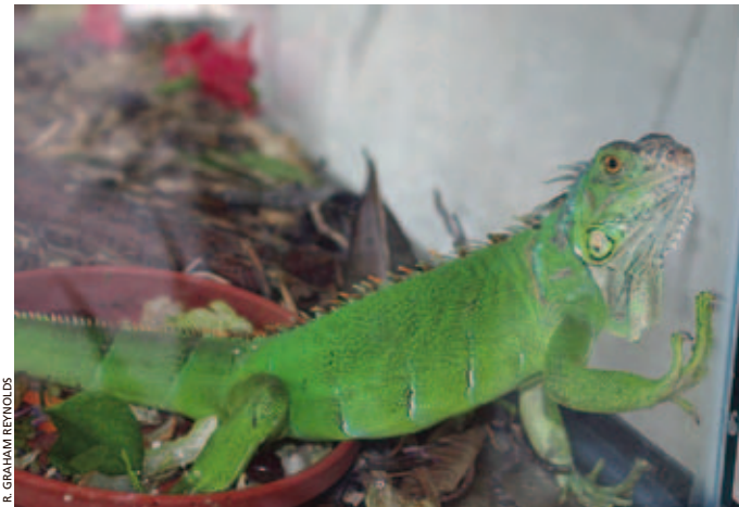
Fig. 8. Green Iguana ( Iguana iguana ) captured near Long Bay on Providenciales and being held at the National Environmental Centre.