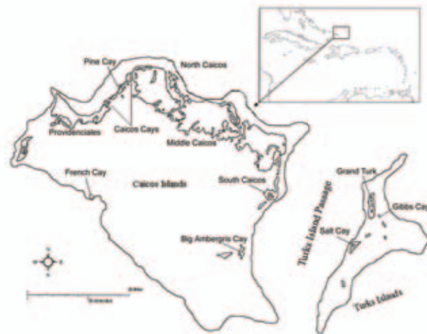
Fig. 1. The Turks and Caicos Islands are located at the southern terminus of the Bahamian Archipelago ~130 km from Hispaniola. Major islands and islands mentioned in the text are labeled.

Islands seem to be particularly vulnerable to invasive species, as these species often are freed from the pressures of natural enemies (predators and parasites) and competition (Whittaker and Fernández-Palacios 2007). Many tropical and subtropical islands contain unique herpetofaunal assemblages that are vulnerable to disruption by the introduction of non-native predators and competitors. The West Indies is considered one of the world's most important biodiversity hotspots and the region's native reptiles and amphibians are of particular conservation concern (Myers et al. 2000, Smith et al. 2005). Centuries of habitat modification and the introduction of damaging mammalian predators such as feral cats ( Felis catus ), Indian Mongoose ( Urva auro-punctata ), and Black Rats ( Rattus rattus ) have negatively affected many reptilian and amphibian populations (e.g., Iverson 1978, Corke 1992, Smith et al. 2005, Tolson and Henderson 2006). As such, documenting and reporting the spread and impact of introduced herpetofauna remains an important task.