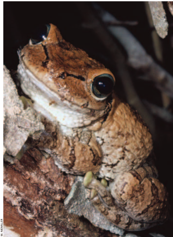
Fig. 3. Cuban Treefrog ( Osteopilus septentrionalis ) from North Caicos.

Cuban Treefrogs (Fig. 3) are widely introduced in the Caribbean and southeastern United States, with populations on Puerto Rico, in the Virgin Islands, upper Lesser Antilles, Florida, and elsewhere (Henderson and Powell 2009). These frogs appear able to tolerate xeric conditions that would prevent most other amphibian colonists from becoming established. As long as they have access to ephemeral or permanent sources of freshwater, these frogs can breed prolifically and become abundant. Cuban