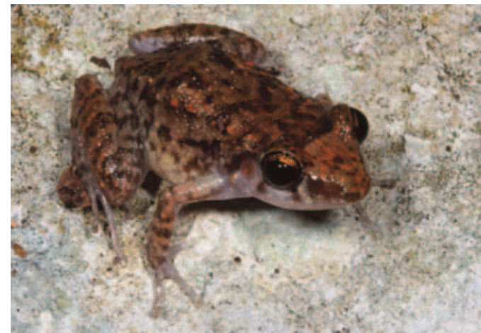
Fig. 4. Greenhouse Frog ( Eleutherodactylus planirostris ) from North Caicos.

Greenhouse Frogs (Fig. 4) are small terrestrial frogs that stow away in soil and plants, and have been introduced to Jamaica, Florida, and the Turks and Caicos Islands from their native range in Cuba, the Caymans, and the Bahamas (Henderson and Powell 2009). This species is a direct-developer, meaning that the larval stage is completed in the egg. Eggs are laid in moist leaf litter, and hatchlings emerge as miniature adults. Greenhouse Frogs occur in the Turks and Caicos on the islands of Providenciales, Grand Turk, North Caicos, and Middle Caicos, and will likely be discovered on other islands. Color photo voucher, APSU 19023.