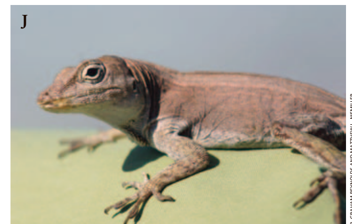
Fig. 2. Native reptiles of the Turks and Caicos: (A) Turks and Caicos Rock Iguana ( Cyclura carinata ), (B) Turks and Caicos Curly-tailed Lizard ( Leiocephalus psammotromus ), (C) Caicos Blind Snake ( Typhlops platycephalus ), (D) Caicos Dwarf Boa ( Tropidophis greenwayi ), (E) Antillean Skink ( Mabuya sp.), (F) Turks Dwarf Gecko ( Sphaerodactylus underwoodi ; female, left; male, right), (G) Caicos Dwarf Gecko ( Sphaerodactylus caicosensis ; male, bottom; female, top), (H) Caicos (Hecht's) Barking Gecko ( Aristelliger hechti ), (I) Turks Island Boa ( Epicrates chrysogaster chrysogaster ), (J) Southern Bahamas Anole ( Anolis scriptus scriptus ).