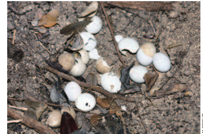
Fig. 7. Hatched nest of the Wood Slave ( Hemidactylus mabouia ) under a rock on Salt Cay, Turks and Caicos Islands.

occupying vertical surfaces of trees, rock walls, and buildings and feeding on small flying or climbing insects. Color photo vouchers, APSU 18047, 18945, 18946, and 18949.