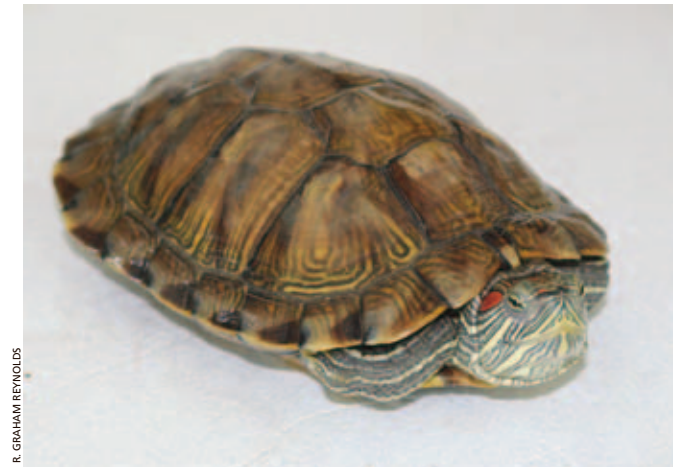
Fig. 5. Red-Eared Slider ( Trachemys scripta elegans ) captured near the Provo Golf Club on Providenciales, Turks and Caicos Islands and being held at the National Environmental Centre.

A single Antillean Slider was collected in 1975 from Pine Cay on the Caicos Bank (W. Auffenberg, UF 49423), although several other individuals were reported in 1997 from a freshwater pond on the same island (Seidel 1986,