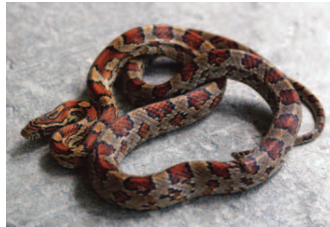
Fig. 9. Corn Snake ( Pantherophis guttatus ) captured on Grand Turk, Turks and Caicos Islands, and being held at the National Environmental Centre.