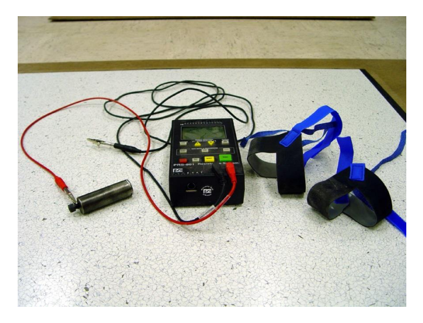
Figure III. Test Apparatus