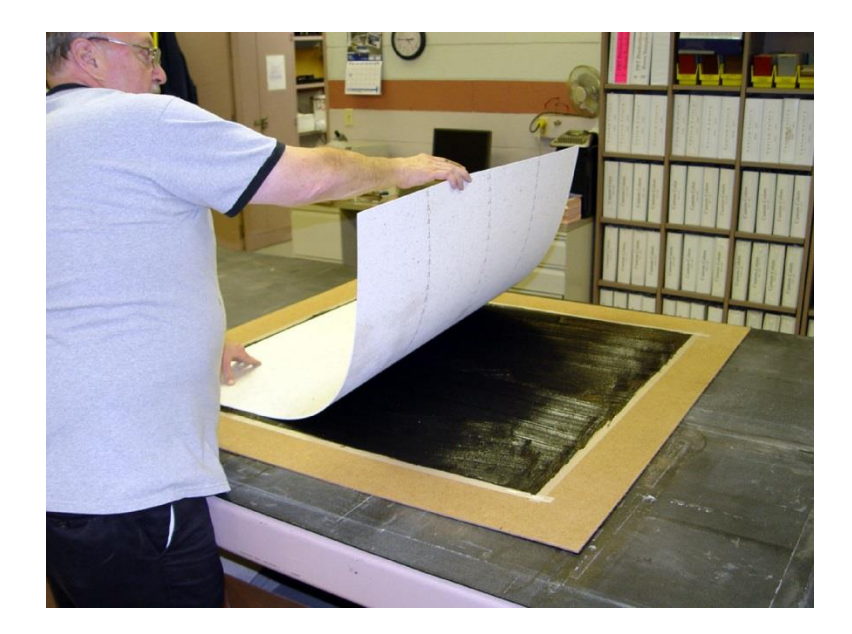
Figure I. Test Floor Preparation - #150 Adhesive