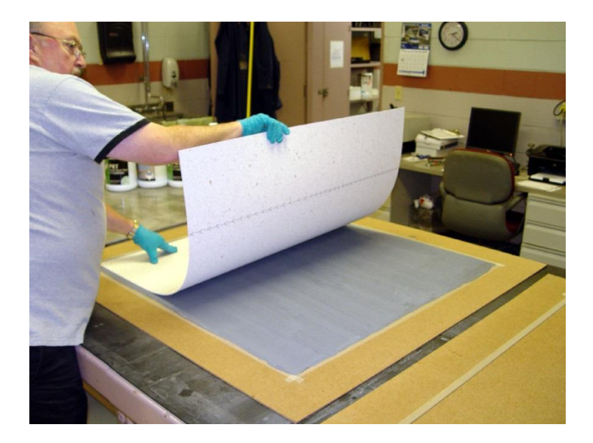
Figure II. Test Floor Preparation - #165 Adhesive