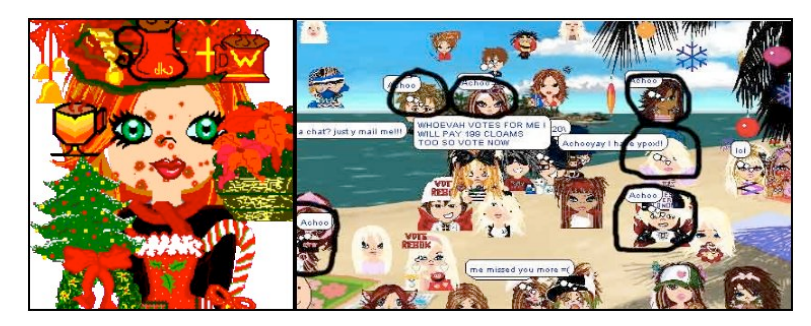
<u>Figure 1</u>. Whyville.net: Whyvillian with Whypox (left), Beach with infected Whyvillians (right).

We expanded this study of everyday argumentation into the contexts of virtual worlds increasingly popular with children. Previous studies about the virtual epidemic Whypox focused on 6<sup>th</sup> grade classroom discussions directed by teachers (Neulight et al., 2007) or online chat content (Author et al., 2007). We documented that students often likened Whypox to naturally occurring infectious diseases they had learned about in their science curriculum. The chickenpox-like qualities of Whypox – its red pimples – might have led students to draw these conclusions (see Figure 1). In the analysis of online chat content we found a significant increase and drop in Whypox-related words concurrent with the outbreak and fading of the virtual epidemic (Author et al., 2007). The examination of players' face-to-face conversations about Whypox in the gaming club while simultaneously online in Whyville.net allowed us to continue the investigation of multiple contexts seen by Bricker and Bell (2007) as instrumental in understanding peer-to-peer everyday argumentation.