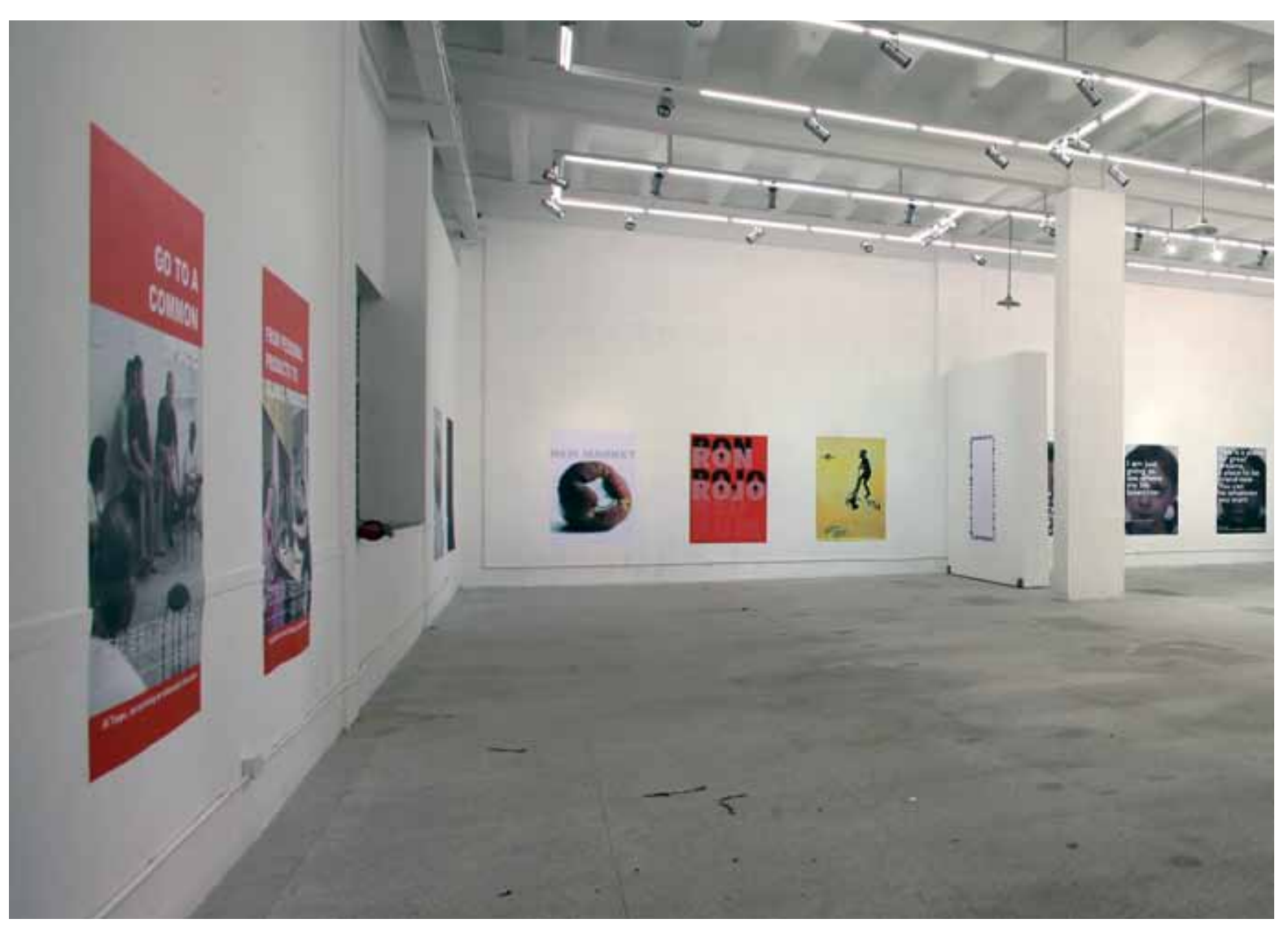
Installation view of Poster Exhibition, 2011.