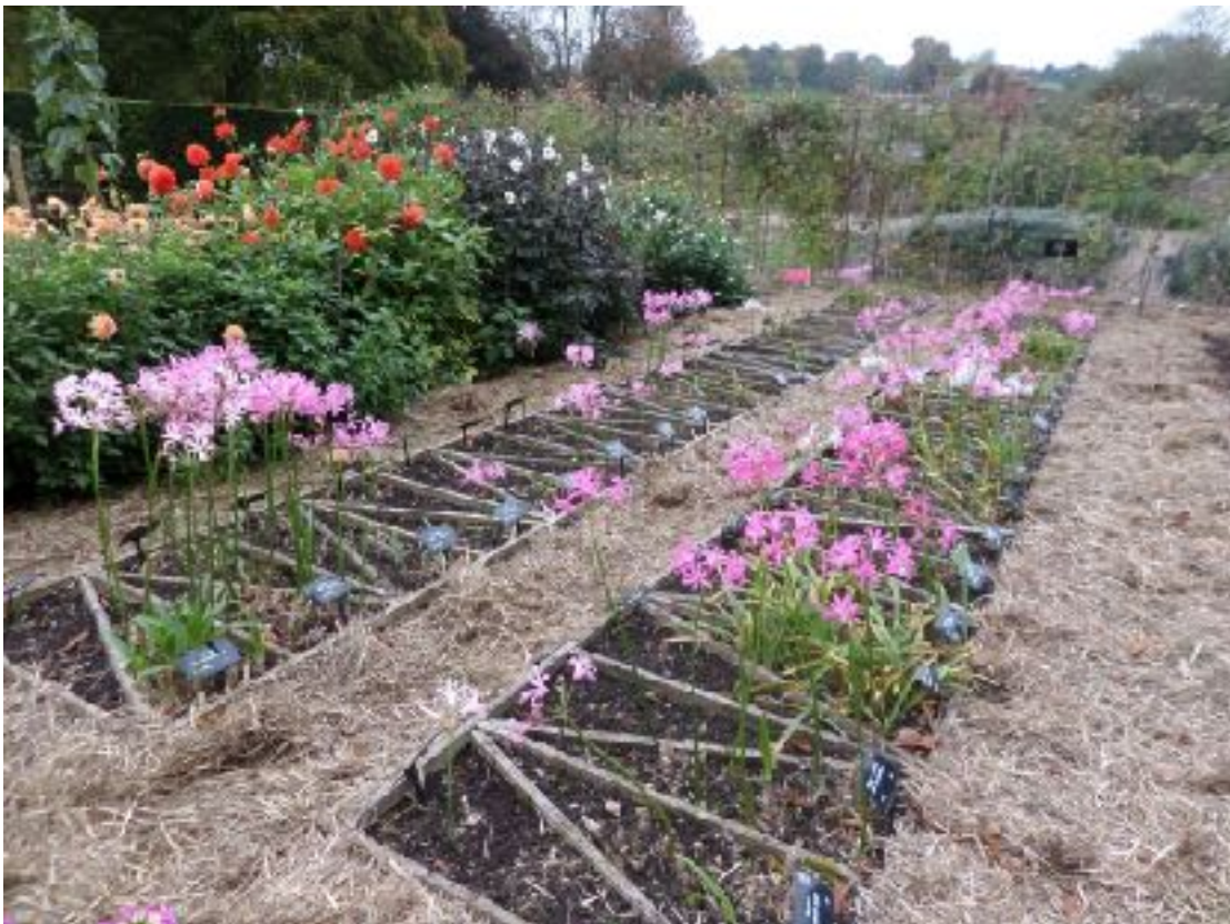
Trial site at Bramdean House Hampshire.

Three to five bulbs per entry were planted during 2012 and 2013. The bulbs were planted with the noses just proud of the soil surface and approximately 25cm apart. The entries were grown for one to two years before judging began in September 2014. This was originally intended to be a three-year trial but was extended for a further year as it was agreed by the forum that the plants had not had sufficient time to become fully established.