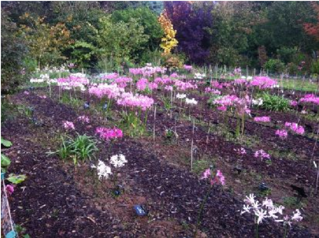
Trial site at The Patch Shropshire.