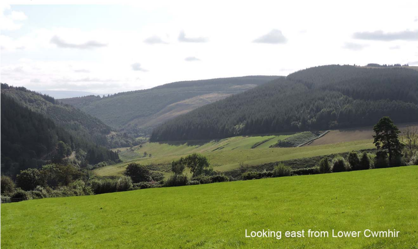
Looking east from Lower Cwmhir

6. Go through gate into an open field following the fence line on your right until you reach two gates. Go through the second (lefthand) gate. Head straight ahead with the gate behind you. As you reach the top of the hill you will see a fenced woodland ahead. Make your way to the stile in the