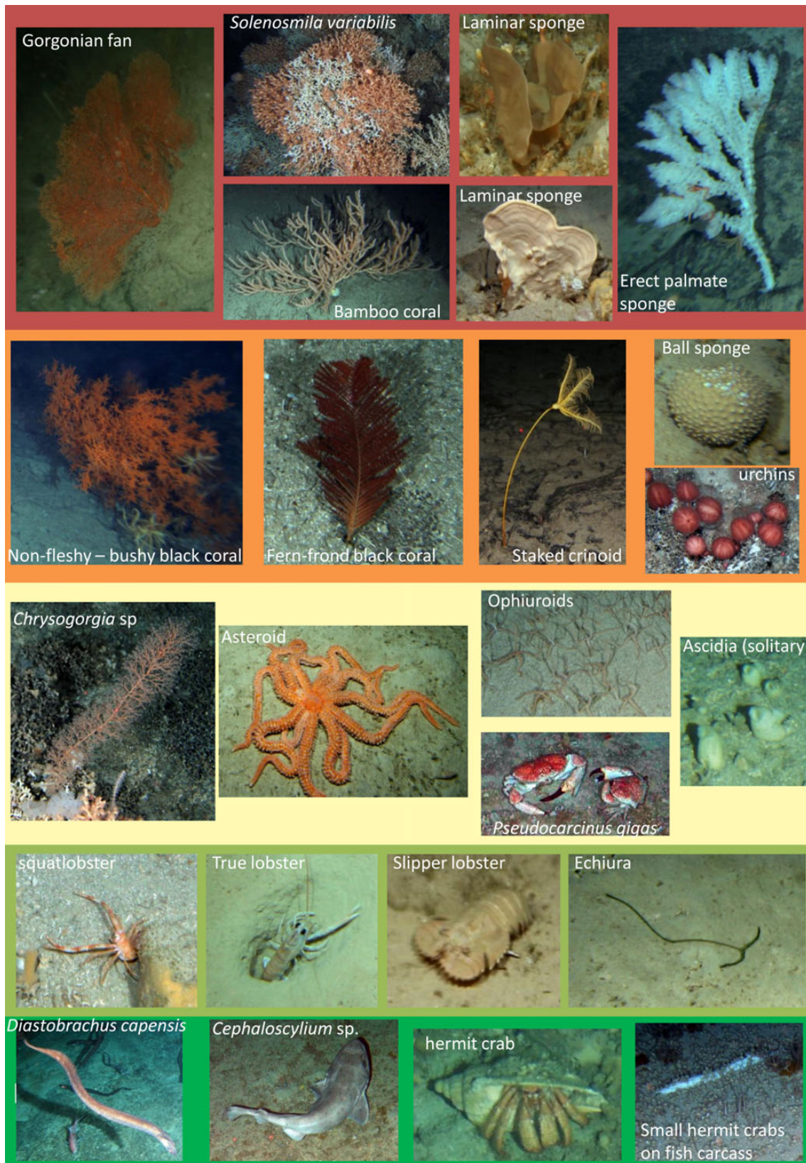
Figure 2. Example deep-sea fauna representative of the different sensitivity categories defined in Table 5 (red, highly sensitive; orange, intermediate; yellow, low; pale green, tolerant; dark green, favoured). The shape and form of taxa can vary widely, and these examples serve to show the sensitivity characteristics of deep-sea species.