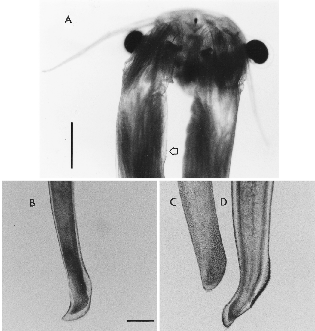
Fig. 1. Branchinecta readingi , new species. (A) Frontal view of head of a male paratype showing apophysis and spines (center most of three at arrow) on basal (first) segment of right antenna, scale = 1.0 mm. (B) Frontal view of distal end of second segment of male's antenna, tip points lateral. (C) Lateral view of distal end of second segment of antenna of a male Branchinecta mackini for comparison with D. (D) Lateral view of distal end of second segment of male's antenna. Scale in B, C, D = 0.3 mm.

tenna of Branchinecta readingi projects forward and then curves laterally and tapers to a point (Fig. 1B, D). The rasplike region at the end of the antenna is more extensive in B. mackini reaching almost to the tip (Fig. 1C). By contrast, the rasplike region in B. readingi is less extensive, ending at a distance equal to about half of its length from the apex of the antenna (compare Fig. 1C, D). The unique shape of the distal end of the antenna in B.