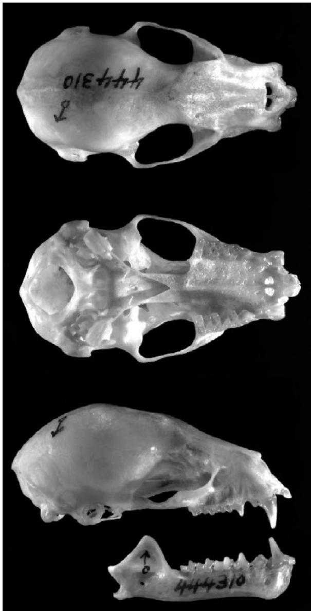
FIG. 2. Dorsal, ventral, and lateral views of cranium and lateral view of mandible of an adult male Phyllostomus discolor (United States National Museum 444310). Greatest length of skull is 29.7 mm.

breadth across molars, 10.1 (9.7–10.5, 23); breadth across canines, 7.3 (6.7–7.6, 23); and length of dentary, 19.0 (18.4–19.8, 23).