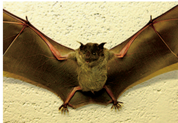
FIG. 1. Adult Phyllostomus discolor from a captive colony, Bronx Zoo, New York. Used with the permission of J. L. Maher and P. Thomas.

Mean external and cranial measurements combined from 8 females and 15 females (in mm, parenthetical range, n ) of P. d. discolor from northwestern Venezuela (Valdez 1970) are: length of forearm, 62.0 (58.5–65.7, 23); length of skull, 30.4 (29.3–31.1, 22); condylobasal length, 27.1 (26.5–27.9, 22); zygomatic breadth, 15.8 (15.0–16.2, 20); length of maxillary tooththrow, 9.8 (9.4–10.2, 13);