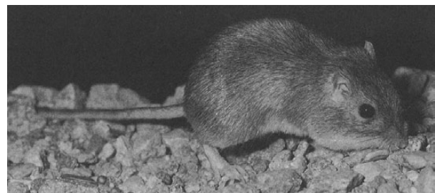
FIG. 1. Photograph of Chaetodipus baileyi from Castle Dome Mountains, Arizona.

Theoretical transmission of acoustical energy through the ear is 100%, high for the genus (Webster and Webster, 1975). Webster and Webster (1975) found the relative volume of the middle ear to