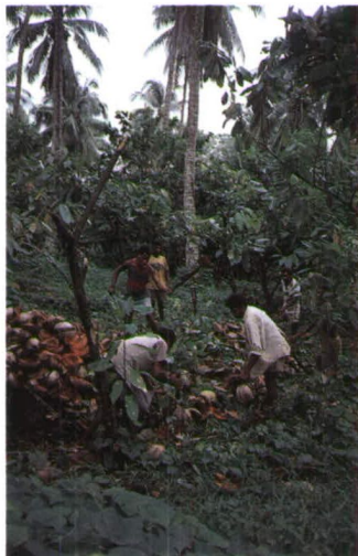
Figure 3. Husk piles in a coconut plantation on Kar Kar Island, Papua New Guinea, a favourite refuge for Micropechis ikaheka .