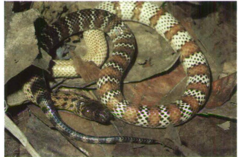
Figure 2. New Guinea small-eyed snake ( Micropechis ikaheka ): living specimens from Kar Kar Island, Papua New Guinea. a specimen 1.5 m long—note the small eye; b specimen 1.0 m long—note the generally pale colour ('white snake') and circumferential stripes ('tiger snake').