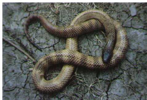
Figure 5. Male specimen of Micropechis ikaheka , 1.69 m long, responsible for biting patient 3 at Arso, Irian Jaya. This species is known locally as 'tiger snake' because of its stripes.