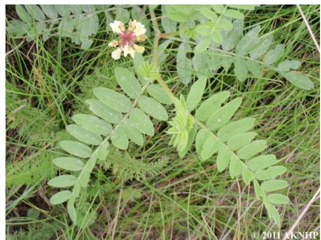
Cicer milkvetch ( Astragalus cicer L.)