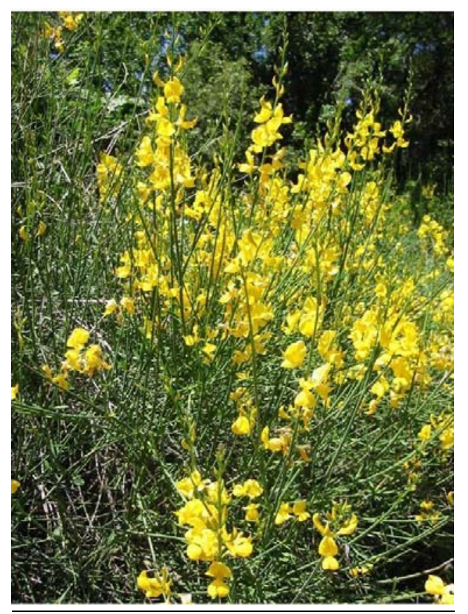
Cytisus scoparius (L.) Link.

Scotch broom is a woody shrub that grows up to 3 meters tall with many erect, angled, dark green branches. Leaves are mostly three-parted with entire leaflets. Leaflets are obovate to oblanceolate and 6 to 13 mm long. Flowers are showy, yellow, and abundant. They are usually arranged solitary in leaf axils. Pods are flattened and brown or black with white hairs on the margins (Hoshovsky 1986, Whitson et al. 2000).