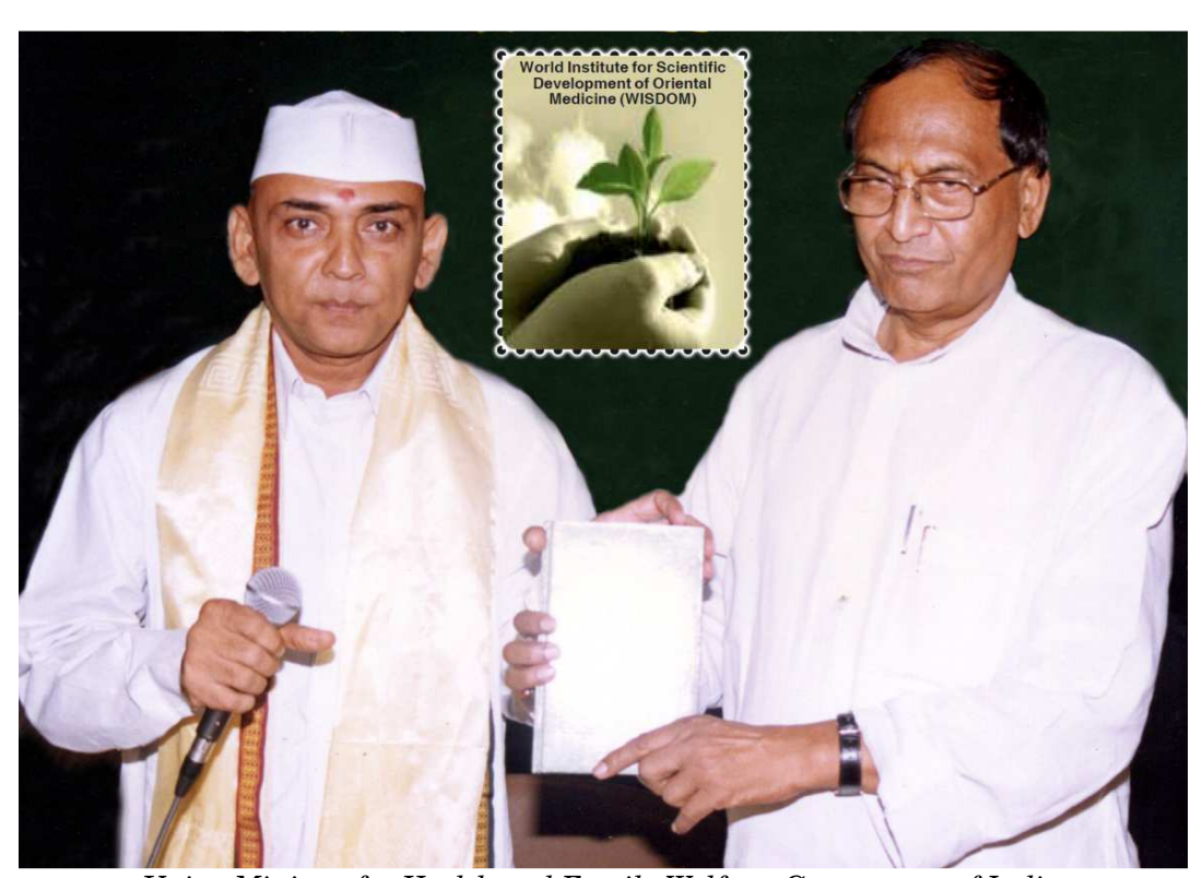
Union Minister for Health and Family Welfare, Government of India Padmashri Dr. C.P. Thakur inaugurating the World Institute for Scientific Development of Oriental Medicine (WISDOM) on the Occasion of the International Day of Peace on 21 September 2000.

The World Institute for Scientific Development of Oriental Medicine (WISDOM) was inaugurated on the occasion of the International Day of Peace i.e. on 21 September 2000 at India International Centre, New Delhi by the then Union Minister for Health and Family Welfare, Government of India, Padmashri Dr. C.P. Thakur.