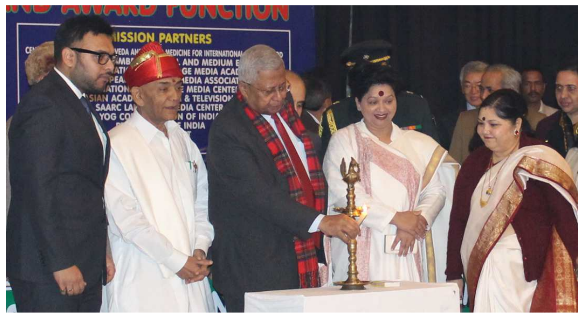
Hon'ble Governor of Tripura, Tathagata Roy lighting the lamp during the Summit organised by Afro-Asian-American Chamber of Commerce, Occupational Research and Development (ACCORD) at New Delhi on 24 December 2015.

All the Action Programmes organized and implemented by "ACCORD" have the inputs relating to rural and urban entrepreneurship, employment generation, cleanliness, greening, recycling, institution building, national and international integration for ensuring optimum development of all countries in the Asian, African and American continents.