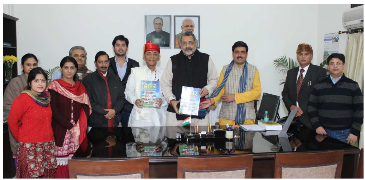
21 January 2015 : The Hindi version of the Book "Bihar : Past, Present and Future" being released by Hon'ble Union Minister of State for Micro and Small Industries Shri Giriraj Singh