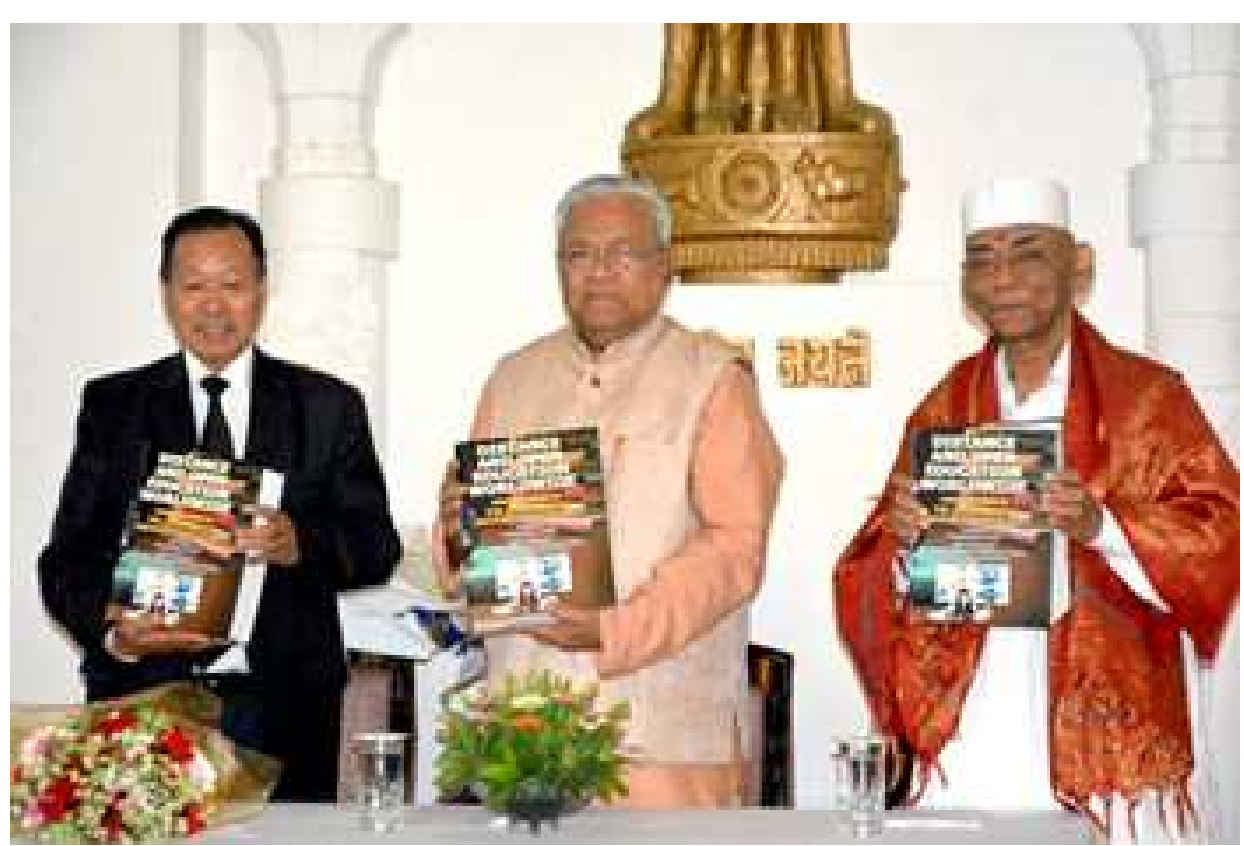
2 October 2015 : The Governor of Nagaland Hon'ble Shri P B Acharya releasing the Book "Distance and Open Education Worldwide" authored by Dr. P R Trivedi