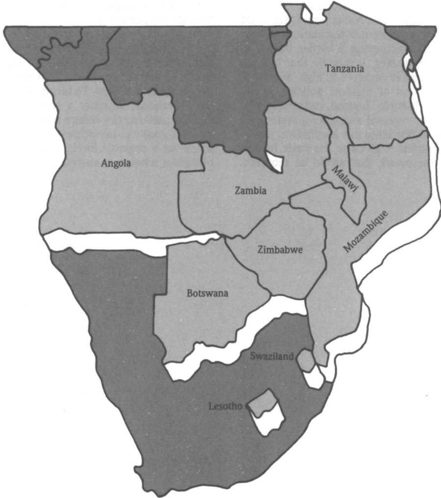
Figure 1—Map of the Southern African Development Coordination Conference countries

or global cooperation. The determinants of success or failure of regional cooperation schemes are also investigated. An assessment of other integration schemes and an overview of obstacles to integration are presented in Chapter 5.