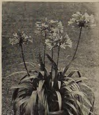
BLUE LILY OF THE NILE

3 for $ 1.70 12 for $ 5.00 100 for $40.00