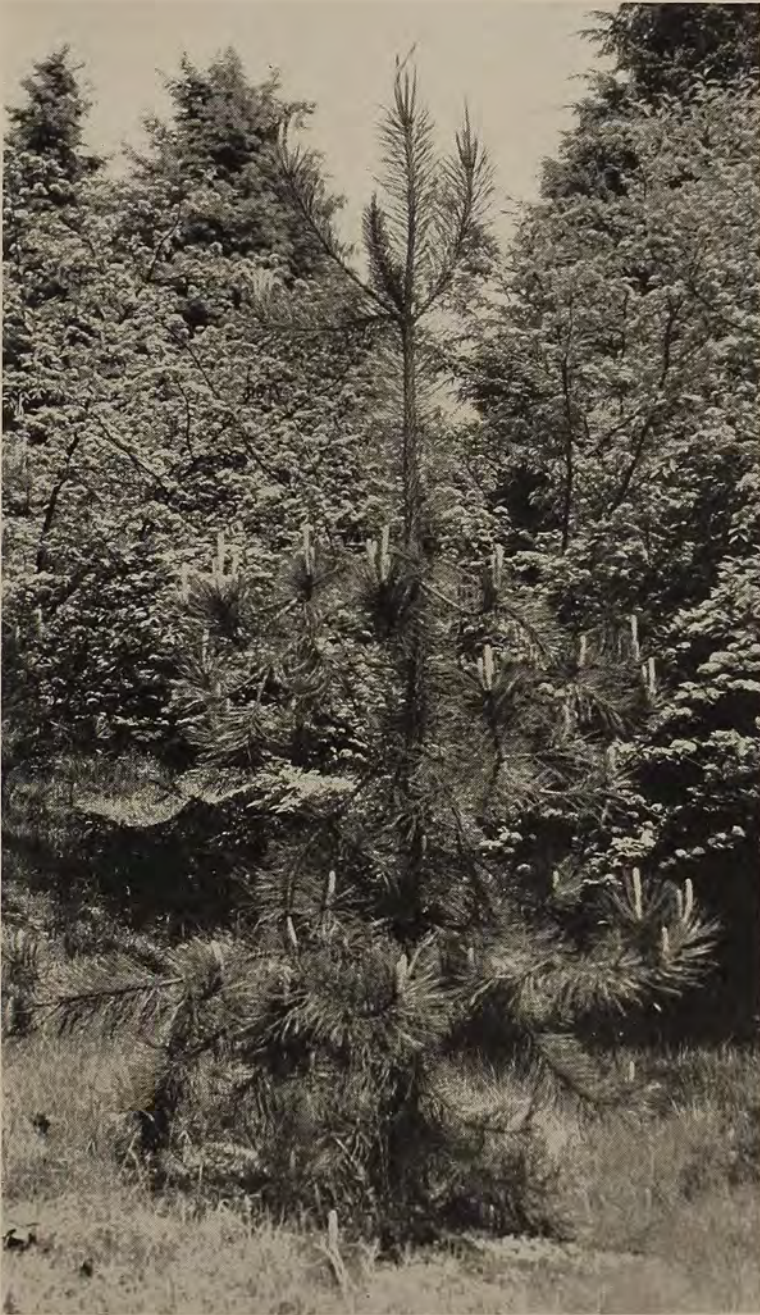
Arthur D. Slavin Pinus nigra monstrosa

the variety austriaca . The leaves measure four to six and a half inches long and are a noticeable grayish green color. The uses of this variety are