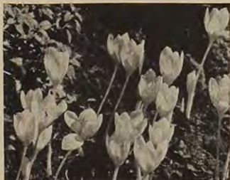
Autumn blooming Crocus Zonatus. Plant in August or September. Bloom in 6 weeks.

There are several new Hyacinths. Lovely things. Heretofore unknown Wild Tulip species. Most interesting. A number of