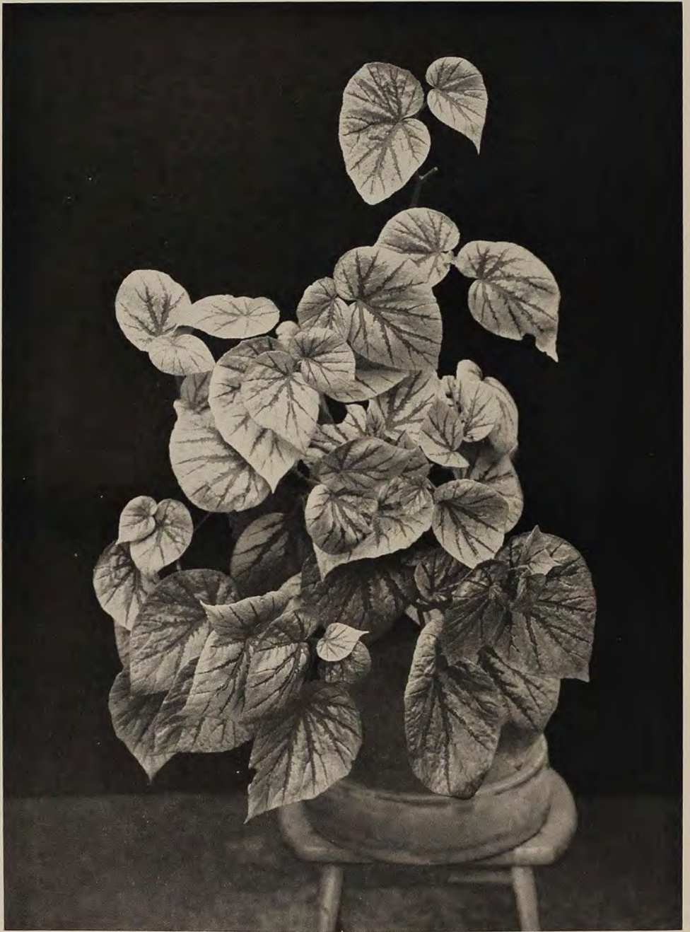
Begonia, Abel Carriere