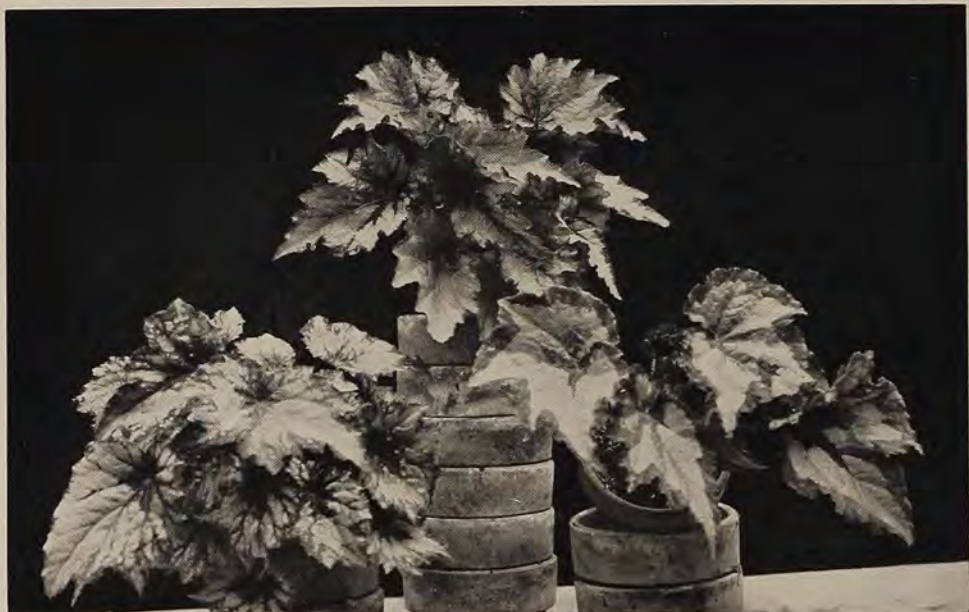
Berry Hybrid Begonias