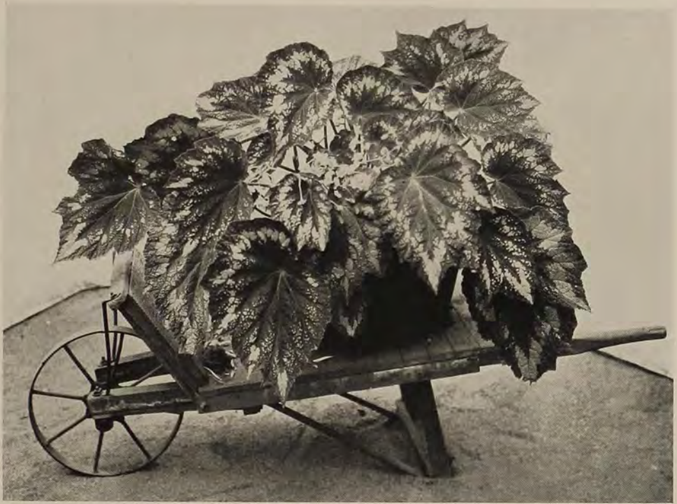
Begonia Lesoudsii Rex × Diadema

California, between Rex and Dregei , which on the face of it would seem an impossible mating. Dregei (illustrated) is a semi-tuberous from South Africa, a very bushy small leaved cheerful plant, chiefly remarkable for its share in the production of the so called winter bloomers, Lorraine , Cincinnati , Melior , etc., the other parent being Socotrana from the island of Socotra in the Red Sea, an unbelievable location for a Begonia , with its very torrid climate.