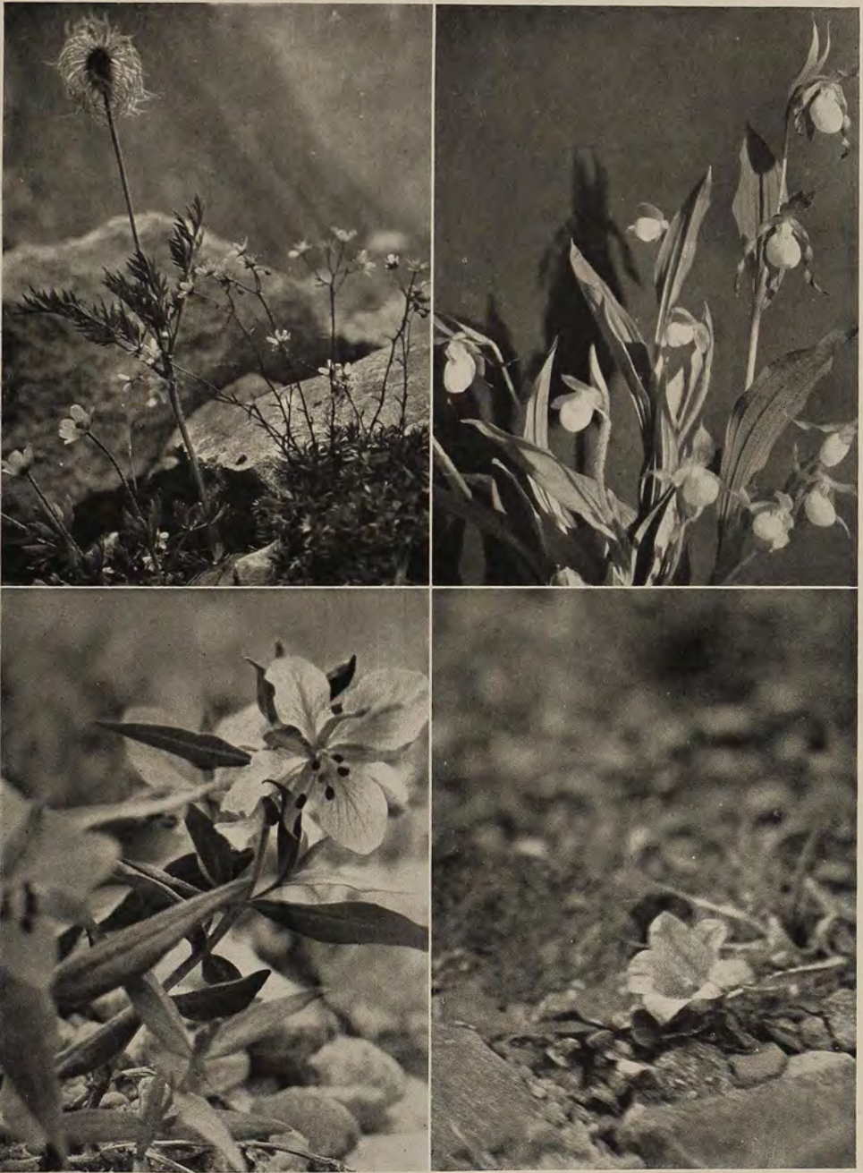
Upper left— Anemone Drummondii , A. occidentalis , Saxifraga austro-montana Upper right— Cypripedium parviflorum , C. passerinum in lower left Lower left— Chamaenerion latifolium Lower right—The unknown campanula referred to in this paper