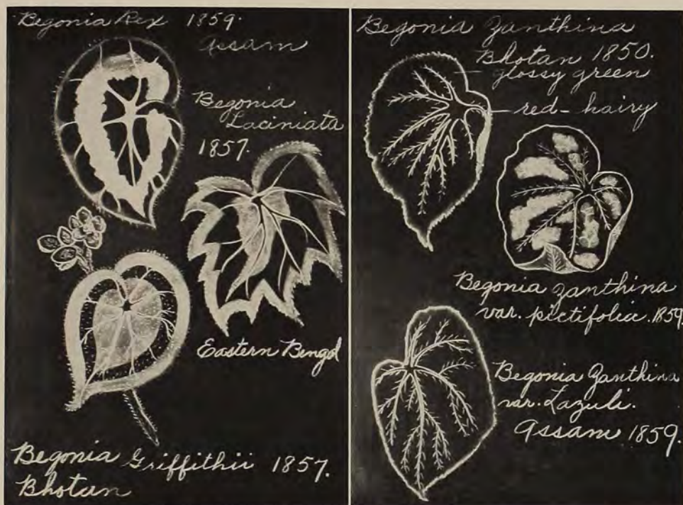
Begonia Rex and related species After Curtis Botanical Magazine