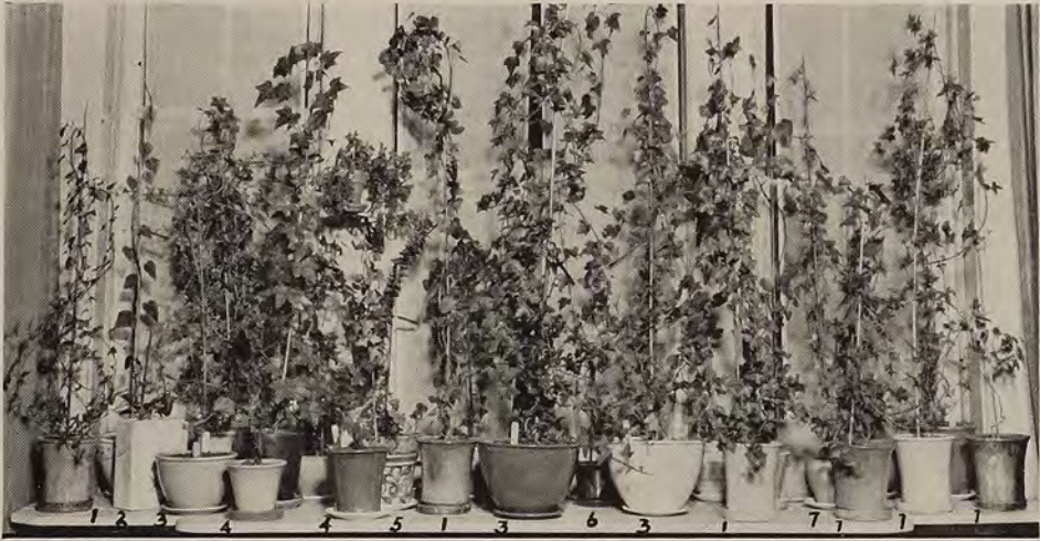
1. A Southern Pottery. 2. Chinese Jar. 3. Fiesta Salad Bowl. 4. Galoway Pottery. 5. Italian Pottery. 6. Swedish Pottery. 7. Unknown.