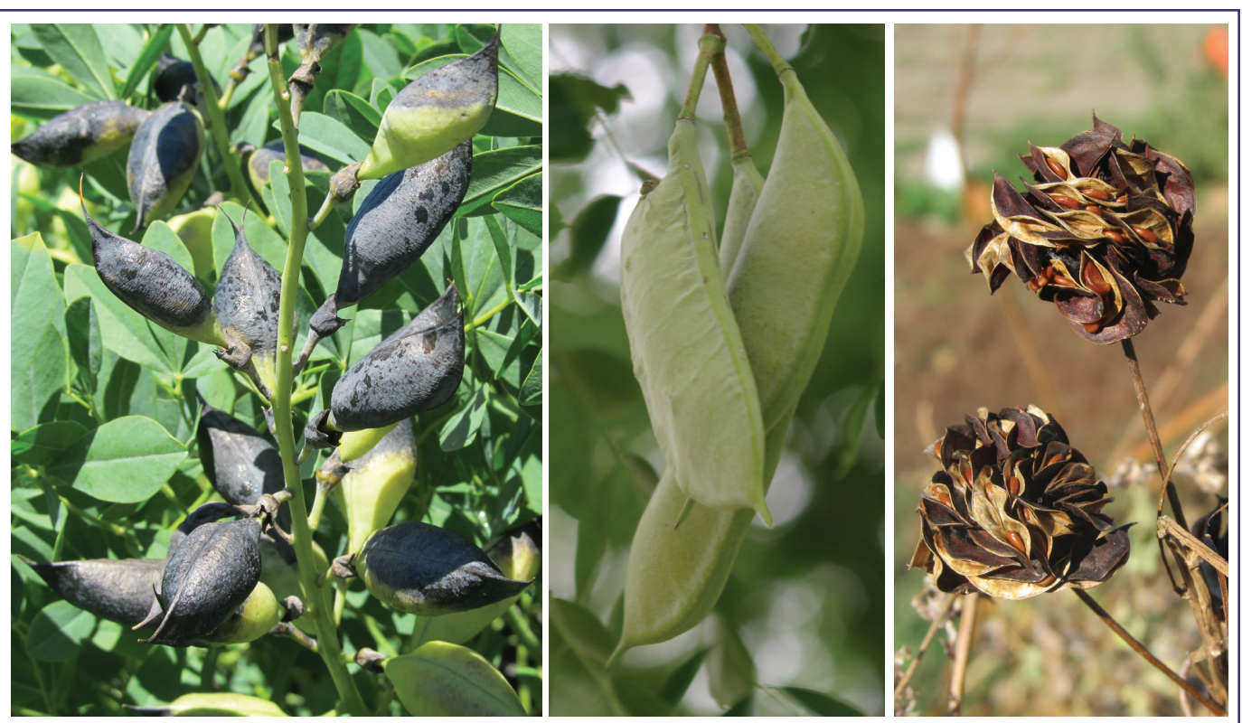
Figure 5. Plants are grouped into families because of similar morphological characteristics. Even with vastly different visual appearances, the presence of legumes on plants easily places them into Fabaceae family; blue false indigo has round legumes; Kentucky coffeetree has thick, leathery legumes; and Illinois bundleflower has ball-like clusters of small, wavy legumes.

licot growth versus monocot growth is the location of the growing point over emerge above the cotyledons and the plant's meristems continue overrom meristems low in the plant, near the soil surface, until the plant ductive (flowering) growth. Understanding where the growing point is gement decisions, such as where to prune and how low to mow.