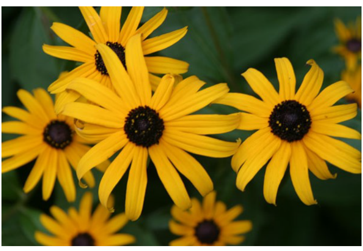
Figure 6. Landscape management and design often focus on classifying plants from the family level down to the specific plant name. Effective communication relies on following the proper writing format for plant names.