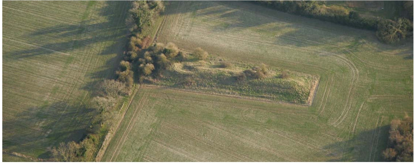
Fig. I. Chettle Long Barrow, Dorset, with vegetation encroaching on one end of its mound. The field has been cultivated up to the edge of the mound but darker soil alongside betrays the location of the side ditches.