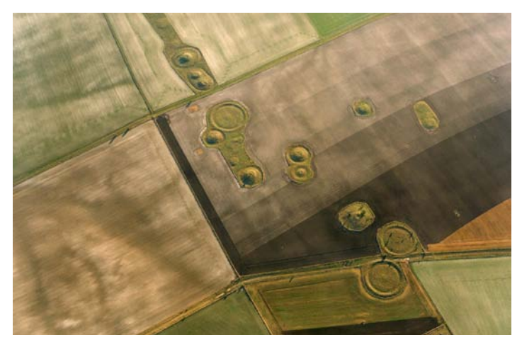
Fig. 2. Round barrows in the Normanton Down barrow group, Wiltshire, photographed from the air and showing the variety of barrow shapes and sizes that can occur, some with elaborate surrounding ditches and others as simple mounds. Three disc barrows can be easily picked out, while a number of other types including bell and bowl barrows can be identified with a little more scrutiny. Some are tightly clustered together, while others are more widely spaced and single examples such as those outliers in the upper right of the picture can be easily overlooked.