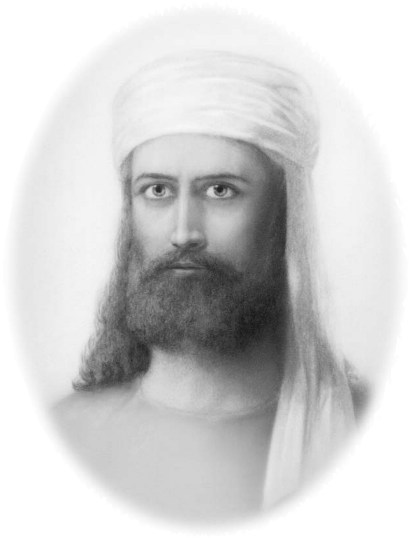
The Ascended Master El Morya