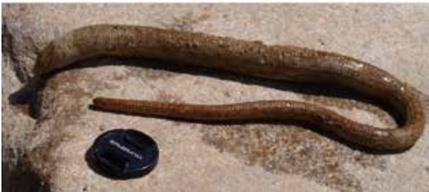
Plate 21. Pseudopus apodus.