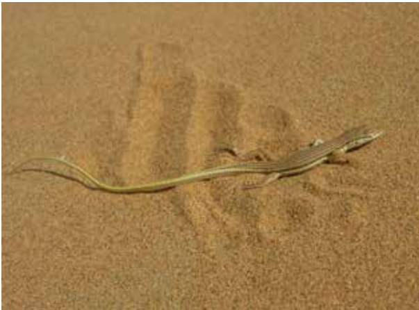
Plate 19. Eremias scripta (Photograph – MG).