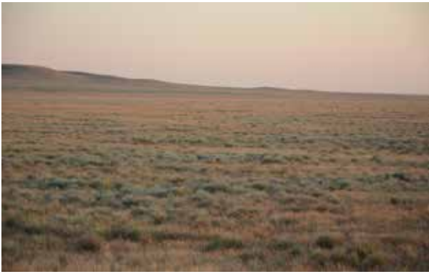
Plate 1. Semi-arid “steppe” habitats.