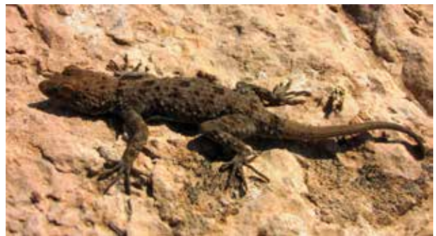
Plate 14. Tenuidactylus fedtschenkoi.