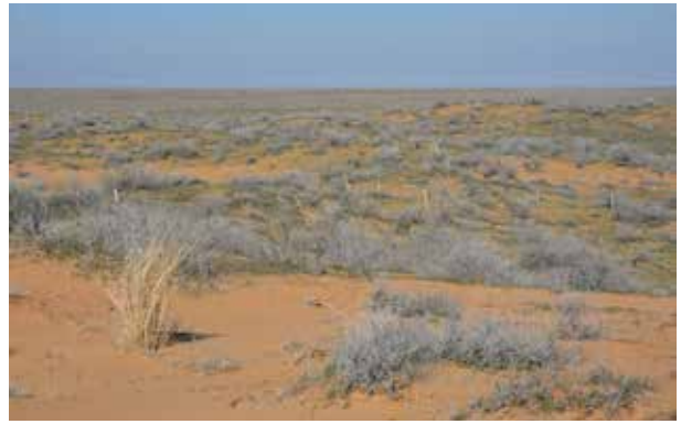
Plate 2. Vegetated sand-dune habitats.