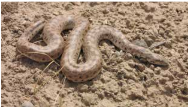
Plate 23. Eryx tataricus (Photograph – TM).