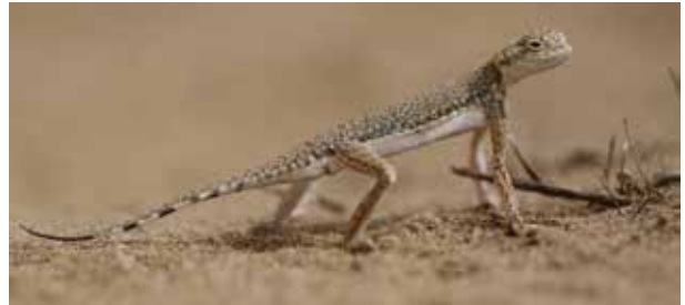
Plate 12. Phrynocephalus interscapularis (Photograph – VNM).