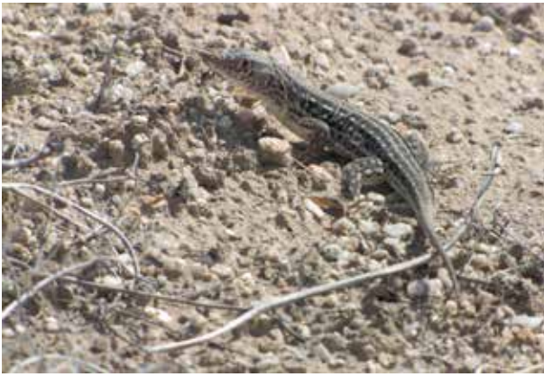
Plate 17. Eremias velox.