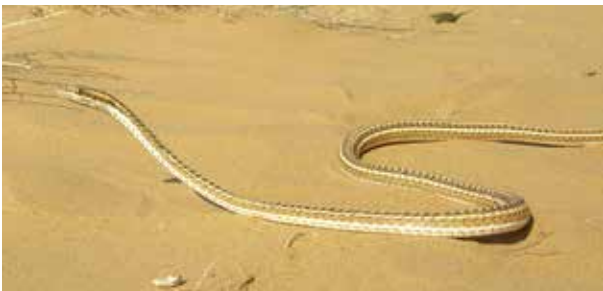
Plate 29. Psammophis lineolatus.