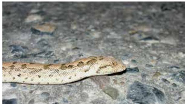
Plate 24. Eryx miliaris.