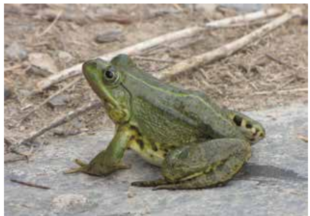
Plate 6. Pelophylax ridibundus.