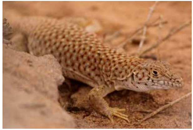
Plate 18. Eremias grammica.