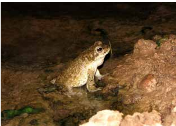
Plate 5. Bufotes viridis ( Photograph – TM ).