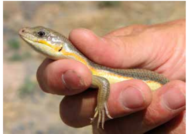
Plate 20. Eumeces schneideri (Photograph – TM).