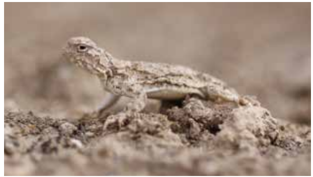
Plate 10. Phrynocephalus helioscopus.