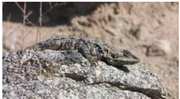
Plate 8. Paralaudakia lehmanni.