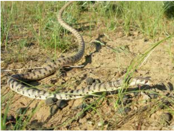
Plate 25. Platyceps karelini.