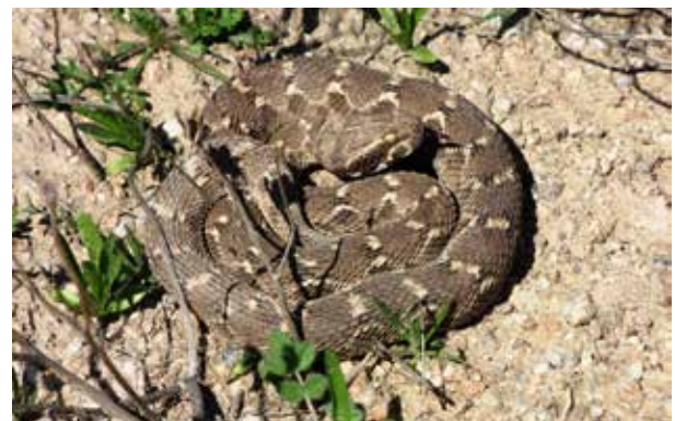
Plate 32. Echis carinatus (Photograph – TM).