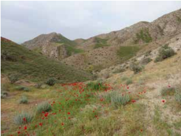
Plate 3. Low rocky mountains.