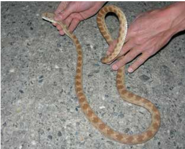
Plate 27. Spalerosophis diadema.