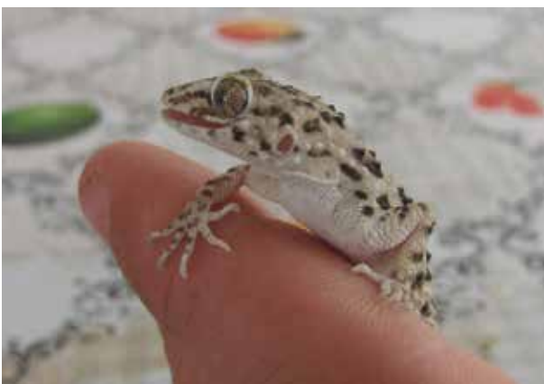
Plate 15. Tenuidactylus caspius.