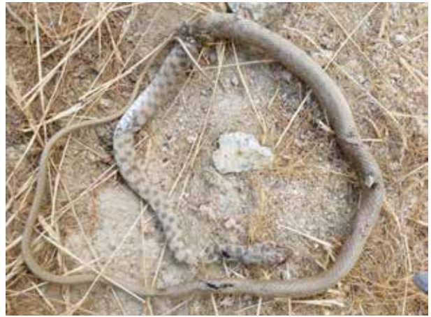
Plate 26. Platyceps rhodorachis.