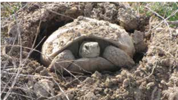
Plate 7. Testudo horsfieldi.