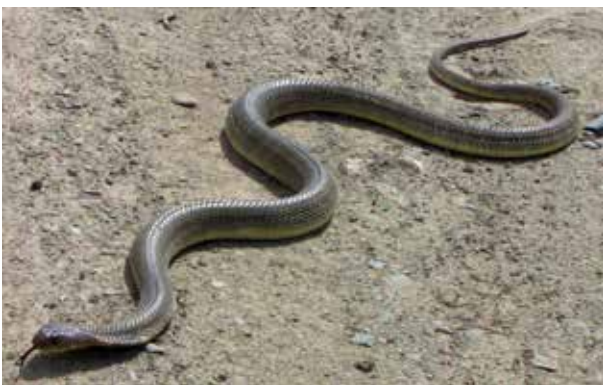
Plate 31. Naja oxiana.