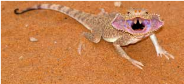
Plate 11. Phrynocephalus mystaceus.