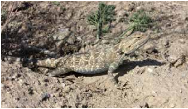
Plate 9. Trapelus agilis.