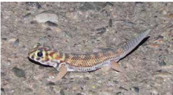
Plate 13. Teratoscincus scincus.