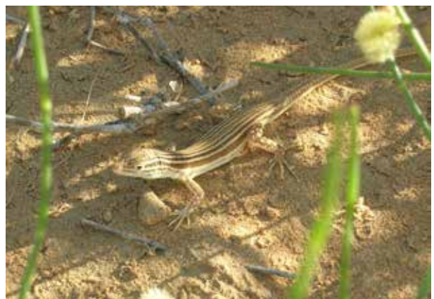
Plate 16. Eremias lineolata.

stan. It is rare within our study area, having been recorded a total of four times. It appears to inhabit similar habitats to E. lineolata and E. grammica , being found locally within well-vegetated sand dune fields. While E. scripta has been noted as occurring at Lake Tudakul (BirdLife