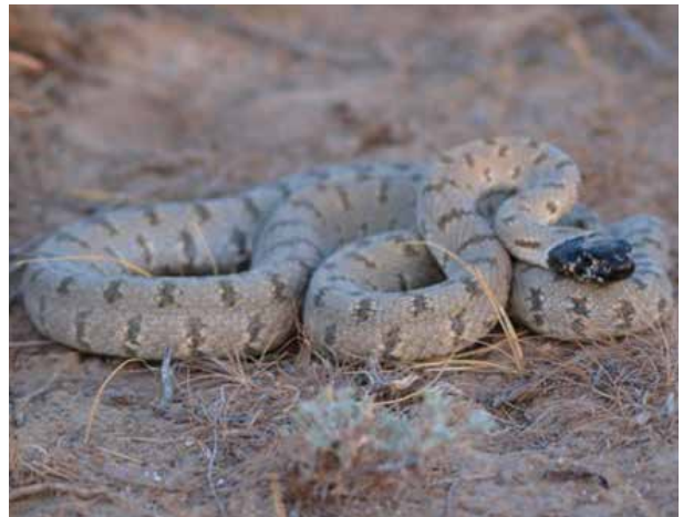
Plate 28. Hemorrhois ravergieri.