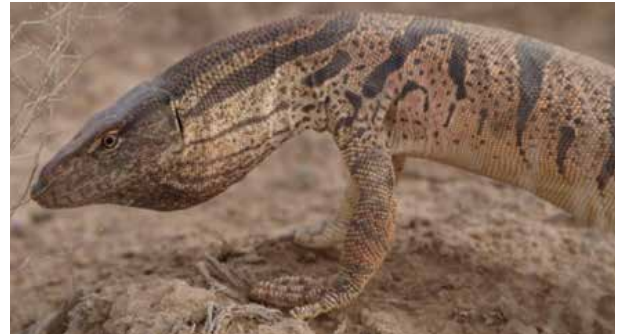
Plate 22. Varanus griseus.