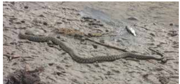
Plate 30. Natrix tessellata.