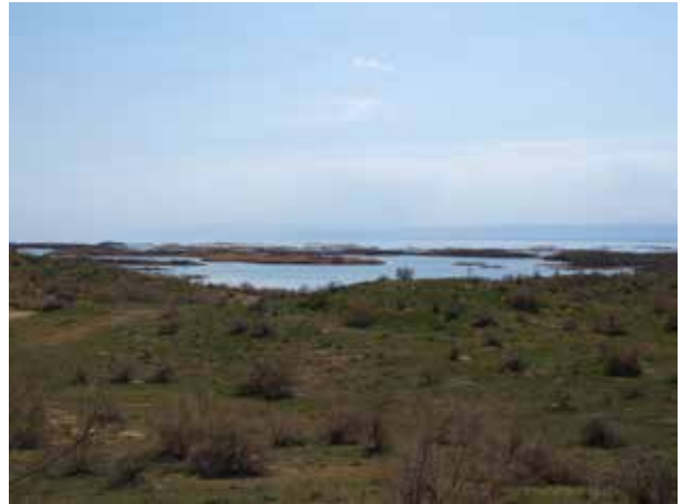
Plate 4. Wetland habitats as Lake Aydarkul.