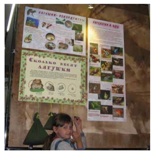
Figure 6. Visitor experience. An interactive educational amphibian exhibit at St. Petersburg Zoo, Russian Federation, not only informs, but also provides tactility to increase fun and experience retention.

Exhibition design for amphibians (Kreger and Mench 1995; Swanagan 2000) has not received a high