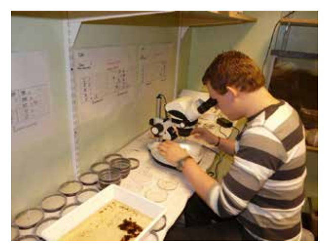
Figure 1. Research in zoos, such as this study on tadpole growth and development at Antwerp Zoo, can make substantial contributions to conservation breeding programs.

The number of amphibian species that require CBPs is challenging. However, the World Association of Zoos and Aquariums (WAZA) represent 241 zoos in 48 countries, and globally there are more than 1000 zoos and aquariums in zoo and aquarium associations (WAZA 2009). This number is greater than the total number of Critically Endangered amphibians, some of which do not immediately need CBPs and may be perpetuated through in situ initiatives. Therefore, the support of amphibian CBPs by zoos' in concert with other institutions should be able to assure a minimal risk of amphibian extinctions.