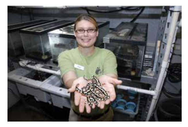
Figure 2. Neurergus kaiseri . In a pioneering program, Sedgwick County Zoo, Kansas, USA, is breeding for sale the critically endangered Loristan newt ( Neurergus kaiseri ) to support field work and conservation in Iran and to increase stocks with private breeders.

Ex situ research for amphibians can vary over a wide range of disciplines including nutrition and husbandry, display and education, population genetics, and reproduction technologies. In situ research includes amphibian biodiversity assessment, ecology, habitat preserva-