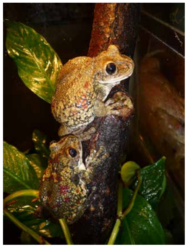
Figure 4. Trachycephalus nigromaculatus. The black-spotted casque-headed treefrog ( Trachycephalus nigromaculatus ) is an excellent display species because it is large (10 cm), spectacular, and sits in the open. These frogs are very popular pets in the Russian Federation.

Many other zoos in EAZA have supported programs to develop regional capacity for amphibian conservation, where Durrell Wildlife Conservation Trust, UK, leads a major program for the conservation of the Montserrat mountain chicken frog ( Leptodactylus fallax ; Martin 2007; Garcia et al. 2007). A consortium of zoos and institutions in Europe, Canada, and the USA are building both ex situ and in situ capacity and research for the critically endangered Lake Oku clawed frog ( Xenopus lon gipes ; Browne and Pereboom 2009). A similar CBP is established for the critically endangered Kurdistan newt ( Neurergus microspilotus ) and Loristan newt ( N. kaiseri )