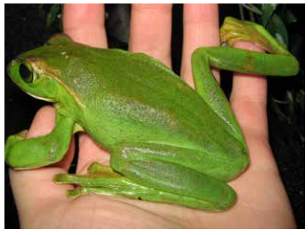
Figure 5. Fea's tree frog ( Rhacophorus feae ) from SE Asia, possibly the largest species of tree frog in the world. Found in high montane forests and recently captive bred for the first time at Leningrad Zoo.

with the Department of Ornithology and Herpetology of the Zoological Institute of the Russian Academy of Sciences.