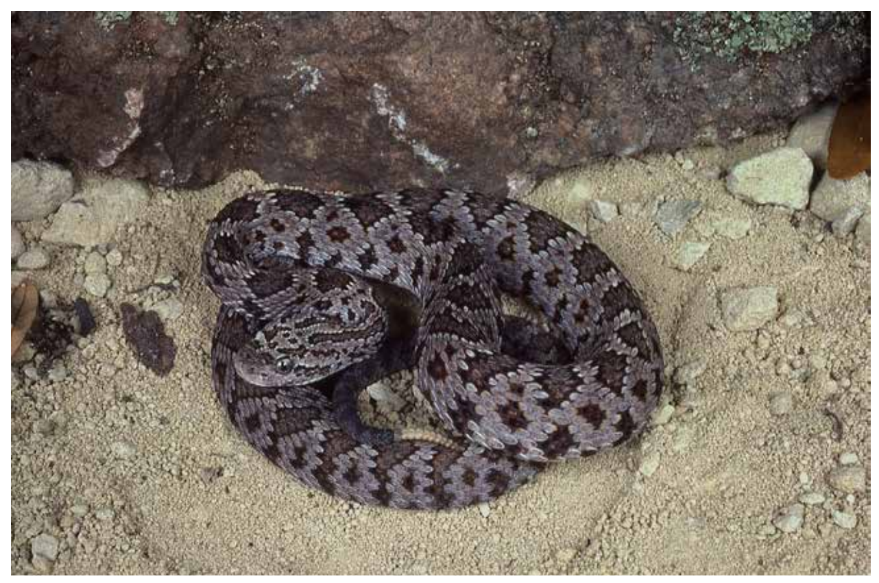
Crotalus stejnegeri . The endemic Sinaloan long-tailed rattlesnake is restricted to a relatively small range in western Mexico, where it is found in the western portion of the Sierra Madre Occidental in western Durango and southeastern Sinaloa. Its EVS has been determined as 17, placing it in the middle of the high vulnerability category, and its IUCN status as Vulnerable. This individual came from Plomosas, Sinaloa. Photo by Louis W. Porras.

Crotalus catalinensis. The endemic Catalina Island rattlesnake is restricted in distribution to Santa Catalina Island in the Gulf of California. Its EVS has been determined as 19, placing it in the upper portion of the high vulnerability category, and its IUCN status as Critically Endangered. Photo by Louis W. Porras.