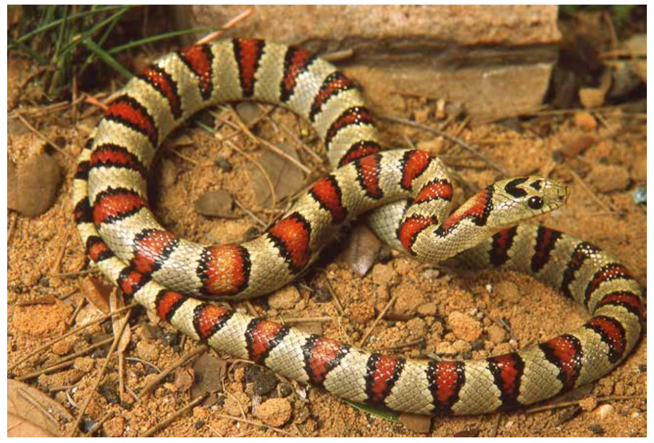
Lampropeltis mexicana. The endemic Mexican gray-banded kingsnake is distributed from the Sierra Madre Occidental in southern Durango and the Sierra Madre Oriental in extreme southeastern Coahuila southward to northern Guanajuato. Its EVS has been gauged as 15, placing it in the lower portion of the high vulnerability category, but its IUCN status, however, was determined as of Least Concern. This individual was found at Banderas de Aguila (N of Coyotes), Durango.

Barisia ciliaris. The widespread Sierra alligator lizard is endemic to Mexico, and is part of a complex that still is undergoing systematic study. Its distribution extends along the Sierra Madre Occidental from southern Chihuahua southward through western Durango and into central Jalisco, and thence into northern Guanajuato and central Querétaro and northward in the Sierra Madre Oriental to central Nuevo León. Its EVS has been calculated as 15, placing it in the lower portion of the high vulnerability category. The IUCN does not recognize this taxon at the species level, so it has to be considered as Not Evaluated. This individual is from 10.1 km WNW of La Congoja, Aguascalientes.