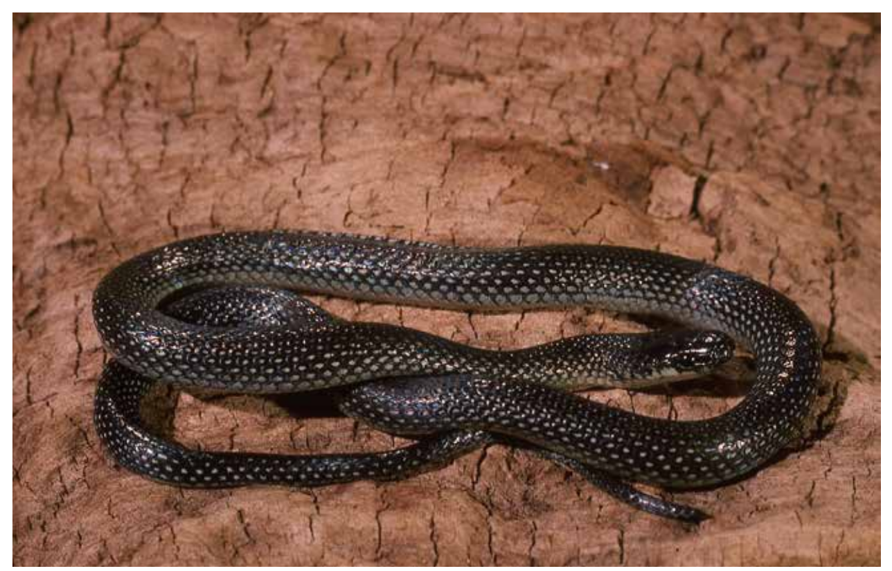
Geophis dugesi . The endemic Dugès' earthsnake occurs from extreme southwestern Chihuahua along the length of the Sierra Madre Occidental southward to Michoacán. Its EVS has been assessed as 13, placing it at the upper end of the medium vulnerability category, and its IUCN status has been determined as of Least Concern. This individual was found at El Carrizo, Sinaloa.

Mastigodryas cliftoni. The endemic Clifton's lizard eater is found along the Pacific versant from extreme southeastern Sonora southward to Jalisco. Its EVS has been determined as 14, placing it at the lower end of the high vulnerability category, and its IUCN status has not been assessed. This individual is from El Carrizo, Sinaloa.