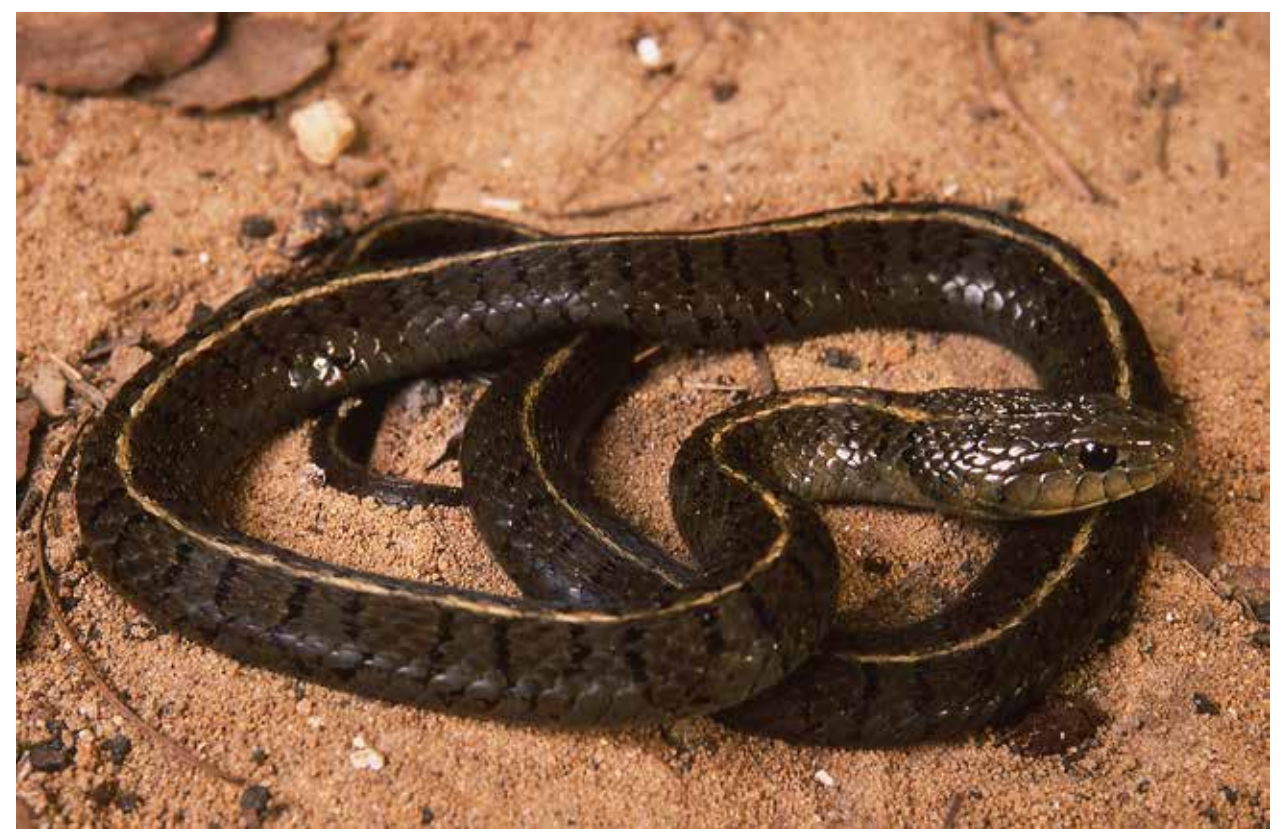
Thamnophis mendax. The endemic Tamaulipan montane gartersnake is restricted to a small range in the Sierra Madre Oriental in southwestern Tamaulipas. Its EVS has been determined as 14, placing it at the lower end of the high vulnerability category, and its IUCN status has been assessed as Endangered. This individual came from La Gloria, in the Gómez Farías region of Tamaulipas.

Rhadinaea laureata. The endemic crowned graceful brownsnake is distributed along the Sierra Madre Occidental from west-central Durango southward into the Tranverse Volcanic Axis as far as central Michoacán, Morelos, and the Distrito Federal. Its EVS has been calculated as 12, placing it in the upper portion of the medium vulnerability category, and its IUCN status has been determined as Least Concern. This individual is from Rancho Las Canoas, Durango.