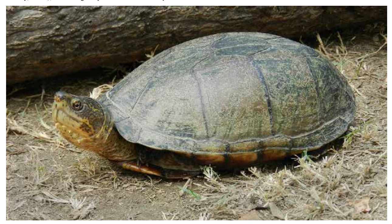
Kinosternon oaxacae. The endemic Oaxaca mud turtle occurs in southern Oaxaca and adjacent eastern Guerrero. Its EVS has been estimated as 15, placing it in the lower portion of the high vulnerability category, and the IUCN considers this kinosternid as Data Deficient. This individual was found in riparian vegetation along the edge of a pond in La Soledad, Tututepec, Oaxaca. Photo by Vicente Mata-Silva .

Trachemys gaigeae . The Big Bend slider is distributed along the Rio Grande Valley in south-central New Mexico and Texas, as well as in the Rio Conchos system in Chihuahua. Its EVS has been calculated as 18, placing it in the upper portion of the high vulnerability category, and the IUCN has assessed this turtle as Vulnerable. This individual is from the Rio Grande about 184 straight kilometers SE of Ciudad Juarez, Chihuahua. Although the picture was taken on the US side (about 44 km SSW of Van Horn, Hudspeth County, Texas), it was originally in the water. Photo by Vicente Mata-Silva .