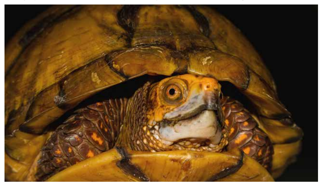
Terrapene mexicana. The endemic Mexican box turtle is distributed from southern Tamaulipas southward to central Veracruz and westward to southeastern San Luis Potosí. Its EVS has been determined as 19, placing it in the upper portion of the high vulnerability category, but this turtle has not been evaluated by IUCN. This individual is from Gómez Farias, Tamaulipas, within the Reserva de la Biósfera El Cielo.

Dermatemys mawii. The Central American river turtle is known from large river systems in Mexico, from central Veracruz southward into Tabasco and Chiapas and northeastward into southwestern Campeche and southern Quintana Roo, avoiding the northern portion of the Yucatan Peninsula. In Central America, it occurs in northern Guatemala and most of Belize. The EVS of this single member of the Mesoamerican endemic family Dermatemyidae has been calculated as 17, placing it in the middle of the high vulnerability category, and the IUCN has assessed this turtle as Critically Endangered. This image is of an individual emerging from its egg, with its egg tooth prominently displayed. The hatching took place at the Zoológico Miguel Álvarez del Toro in Tuxtla Gutiérrez, Chiapas, as part of a captive breeding program for this highly threatened turtle. The parents of this hatchling came from the hydrologic system of the Río Usumacinta and Playas de Catazajá.