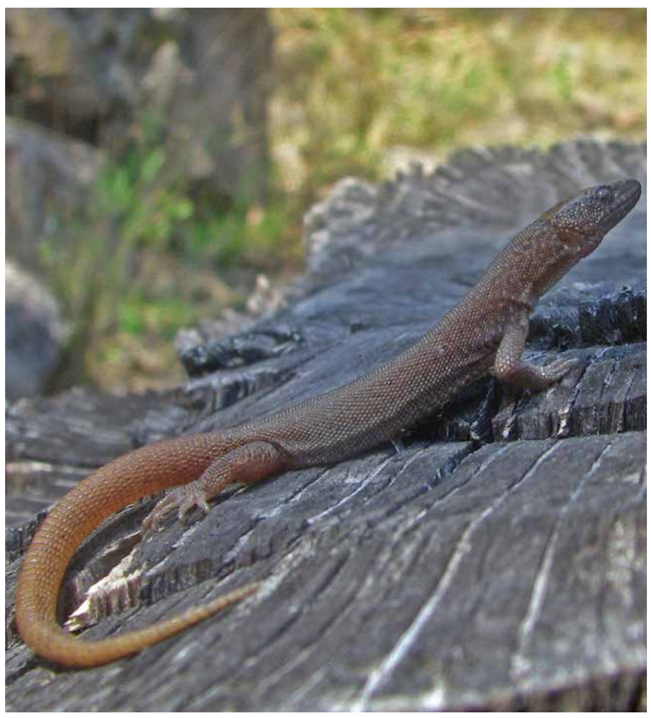
Xantusia sanchezi . The endemic Sanchez's night lizard is known only from extreme southwestern Zacatecas to central Jalisco. This lizard's EVS has been assessed as 16, placing it in the middle of the high vulnerability category, but its IUCN status has been determined as Least Concern. This individual was discovered at Huaxtla, Jalisco.