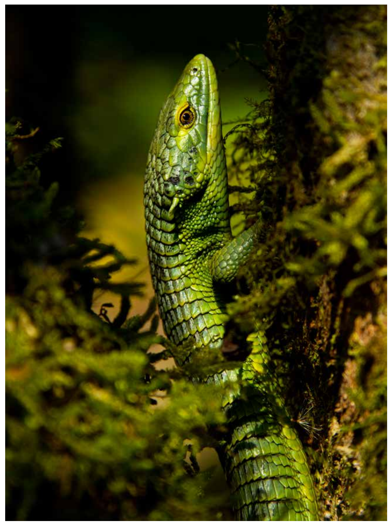
Abronia smithi. Smith's arboreal alligator lizard is endemic to the Sierra Madre de Chiapas, in the southeastern portion of this state. Its EVS has been determined as 17, placing it in the middle of the high vulnerability category; the IUCN, however, lists this lizard as of Least Concern. This individual was found in cloud forest in the Reserva de la Biósfera El Triunfo, Chiapas.