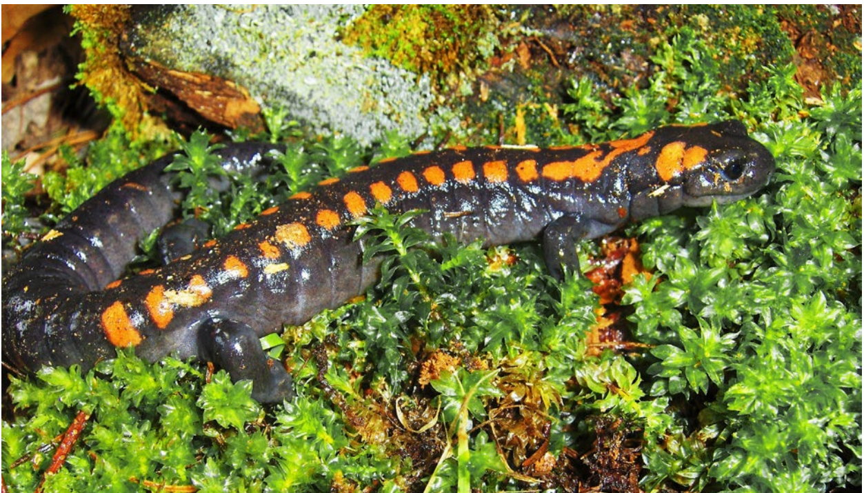
Pseudoeurycea bellii . Bell's false brook salamander occurs from southern Tamaulipas and southern Nayarit southward to Tlaxcala and Guerrero, Mexico, with a disjunct population found in east-central Sonora and adjacent Chihuahua. Its EVS has been gauged as 12, placing it in the upper portion of the medium vulnerability category, its status has been judged as Vulnerable by IUCN, and it is regarded as Threatened by SEMARNAT. This individual was found and photographed on Cerro Tancítaro, Michoacán.

In total, of the 212 native species, 100 (47.2%) are confined to a single physiographic province within the state. Organizing these single-province species by their distributional status (Table 7) indicates the following (listed in order of state endemics, country endemics, and non-endemic species): Coastal plain (22 total species) = 1 (4.5%), 10 (45.5%), 11 (50.0%); Balsas-Tepalcate-