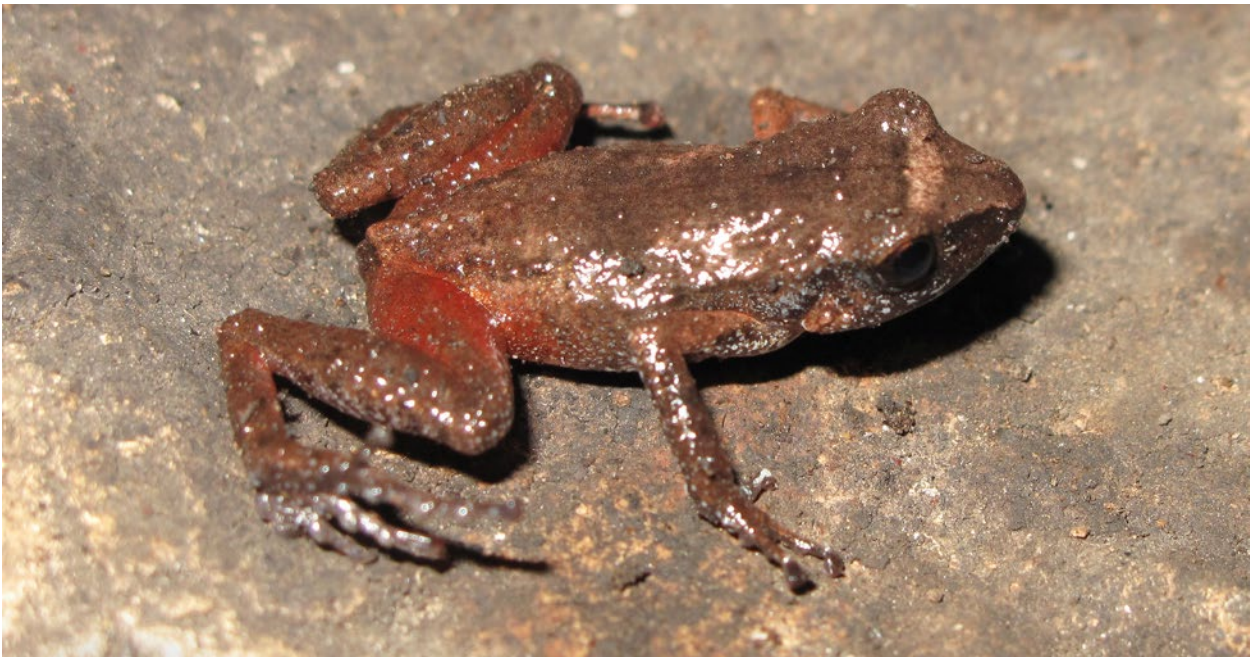
Eleutherodactylus rufescens. The blunt-toed chirping frog is endemic to the Sierra de Coalcomán region of the Sierra Madre del Sur. Its EVS has been assessed as 17, placing this species in the middle of the high vulnerability category, this frog is considered as Critically Endangered by IUCN, and as a Special Protection species by SEMARNAT. This individual was found at Dos Aguas in the Sierra de Coalcomán (Sierra Madre del Sur) in Michoacán.