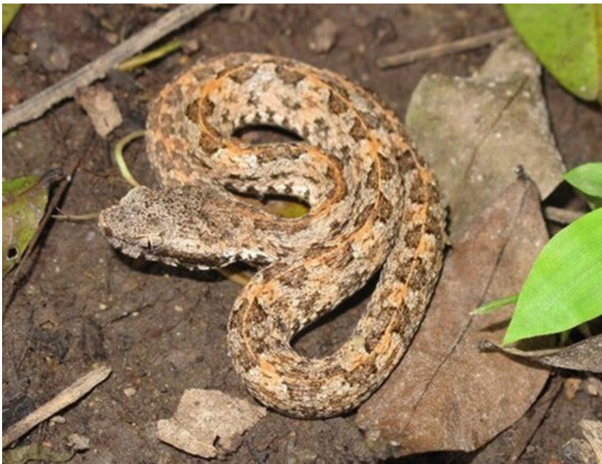
Porthidium hespere . The western hog-nosed viper inhabits the coastal plain of western Mexico, from southeastern Colima to central Michoacán. Its EVS has been reported as 18, placing it in the upper portion of the high vulnerability category, it has been judged as Data Deficient by IUCN, and assigned a Special Protection status by SEMARNAT. This individual is from Coahuayana on the coast of Michoacán.