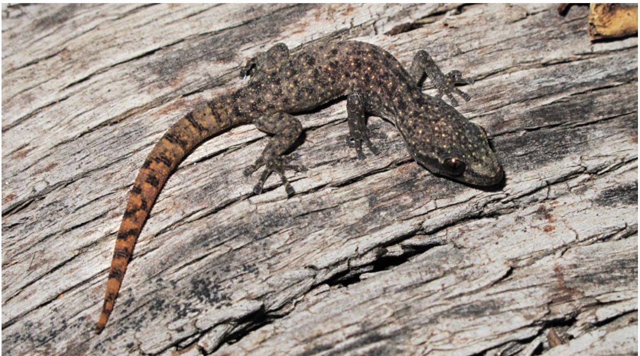
Phyllodactylus duellmani. Duellman's pigmy leaf-toed gecko is endemic to Michoacán, where it is found in the Balsas-Tepalcatepec Depression and the Sierra Madre del Sur. Its EVS has been assigned a value of 16, placing it in the middle of the high vulnerability category, this species has been judged as Least Concern by IUCN, and accorded a Special Protection status by SEMARNAT. This individual was photographed at Nuevo Centro, Reserva de la Biósfera Infiernillo-Zicuirán, near the Presa Infiernillo on the Río Balsas in southeastern Michoacán.