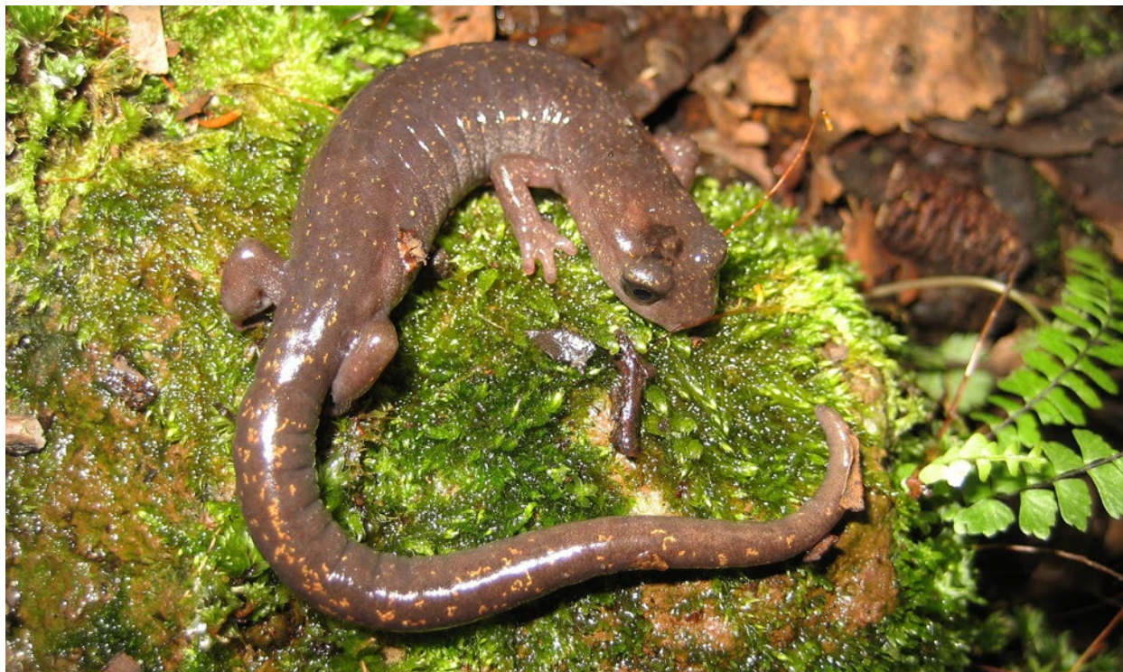
Pseudoeurycea leprosa. The leprous false brook salamander occurs in Veracruz, Puebla, Distrito Federal, México, Morelos, Guerrero, and Oaxaca. Its EVS has been judged as 16, placing it in the middle of the high vulnerability category, IUCN has assessed this species as Vulnerable, and it is considered as Threatened by SEMARNAT. This individual was encountered on Cerro Cacique, near Zitacuaro, in Michoacán.