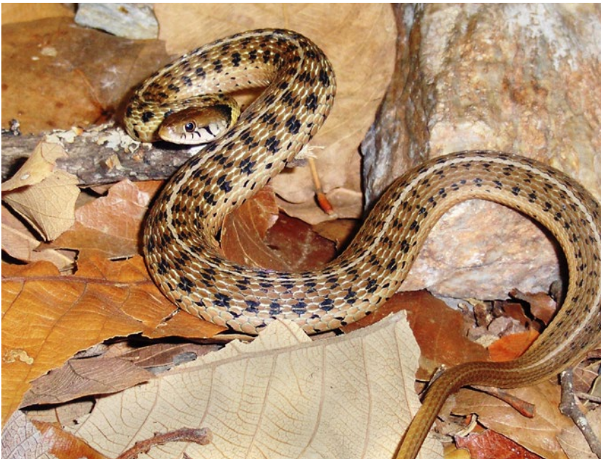
Thamnophis postremus . The Michoacán gartersnake is a state endemic. Its EVS has been allocated as 15, placing it in the lower portion of the high vulnerability category, it has been judged as Least Concern by IUCN, and this species has not been provided a status by SEMARNAT. This individual came from San Lucas in the Balsas-Tepalcatepec Depression in Michoacán.

Based on the application of this system, only a small percentage of the species in the state would be scheduled to receive the greatest amount of attention. These 27 species include eight anurans, seven salamanders, one crocodylian, three turtles, four lizards, and four snakes. Whereas most of these species appear to merit a threatened status, inasmuch as 16 of the 27 species are country-level endemics and six are state-level endemics (22 species, 81.5% of the 27), the herpetofauna of Michoacán is characterized by a higher level of endemism than for the entire country of Mexico (140 of 212 species [66.0%] vs. 736 of 1,227 species [60.0%]). If endemism can be considered an important criterion for listing a species as threatened under the IUCN system (which it is not, as this system exists), then a substantial number of other candidates are available for choosing (Table 10), a significant issue that needs to be addressed.