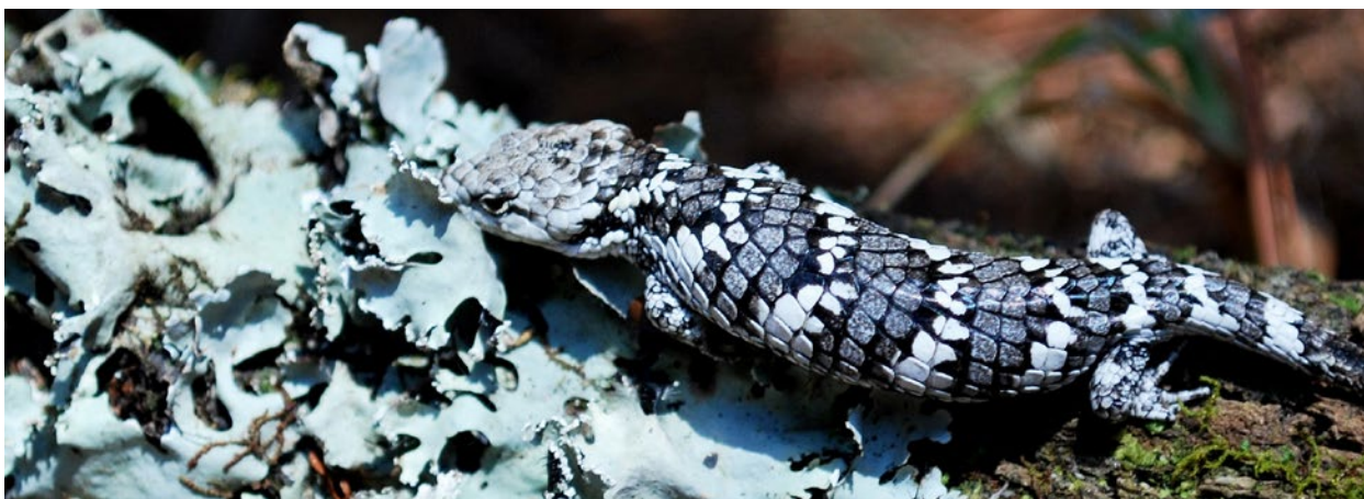
Abronia deppii. Deppe’s arboreal alligator lizard is found in the mountains of the Transverse Volcanic Axis in Michoacán, México, and Jalisco. Its EVS has been judged as 16, placing it in the middle of the high vulnerability category, IUCN considers this species as Endangered, and it has been provided a Threatened status by SEMARNAT. This individual came from San José de las Torres, near Morelia, in Michoacán.