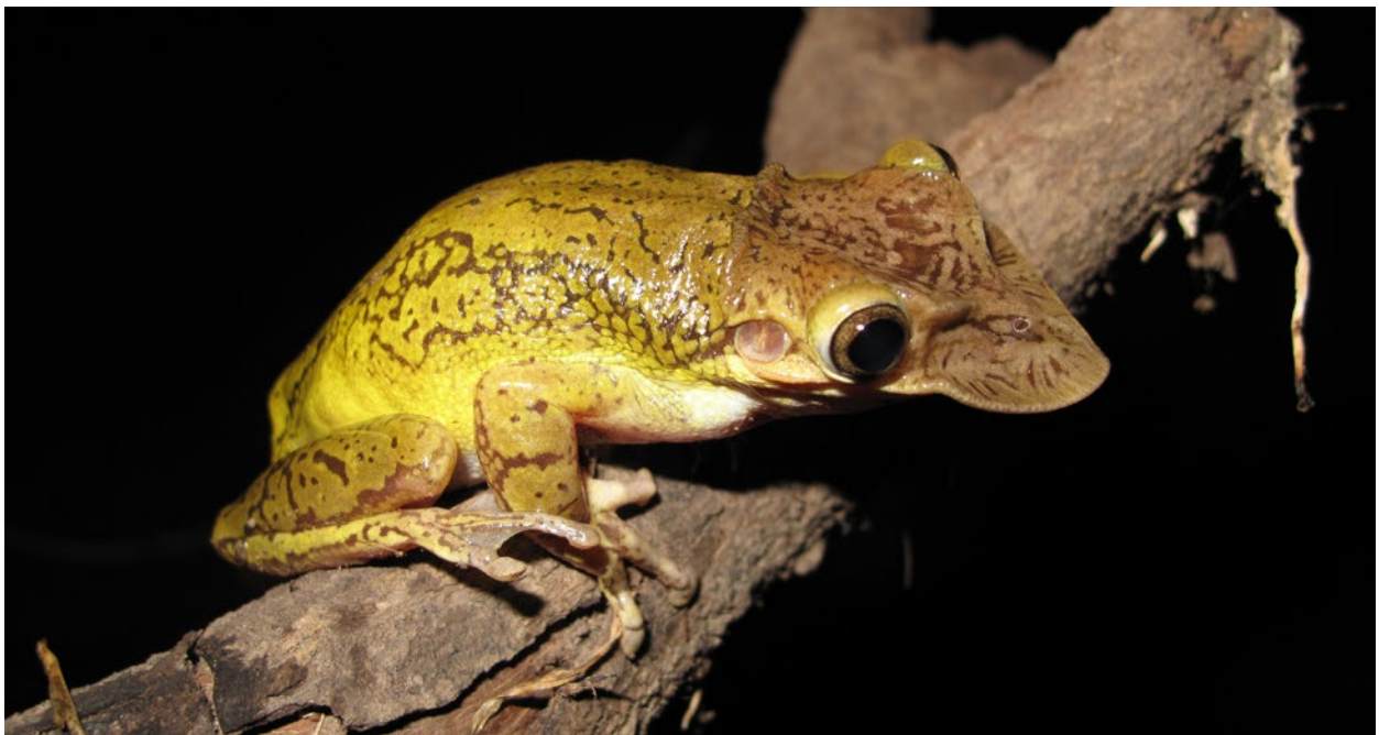
Diaglena spatulata. The shovel-headed treefrog is distributed along the Pacific coastal lowlands from Sinaloa to Oaxaca, and thus is a Mexican endemic hylid anuran. In Michoacán, it occurs in the Balsas-Tepalcatepec Depression and along the Coastal Plain. Its EVS was gauged as 13, placing it at the upper end of the medium vulnerability category, IUCN has assessed this anuran as Least Concern, and it is not listed by SEMARNAT. This individual was photographed at the Reserva de la Biosfera Chamela-Cuixmala on the coast of Jalisco.

Mexico is known for its high level of herpetofaunal endemism, but compared with the country the herpetofauna of Michoacán is several percentage points higher, with a number of the country endemics limited in distribution to the state (see below). Any attempt to assess the conservation status of a herpetofaunal group depends on an accurate accounting of the distribution and composition of the species involved. Thus, our objectives with this study are to update the list of amphibians and reptiles in Michoacán, to discuss their distribution among the physiographic provinces, and to use these data to gauge the conservation status of the entire herpetofauna using various measures. Finally, based on our conservation assessment, we provide recommendations to enhance current efforts to protect the state's amphibians and reptiles.