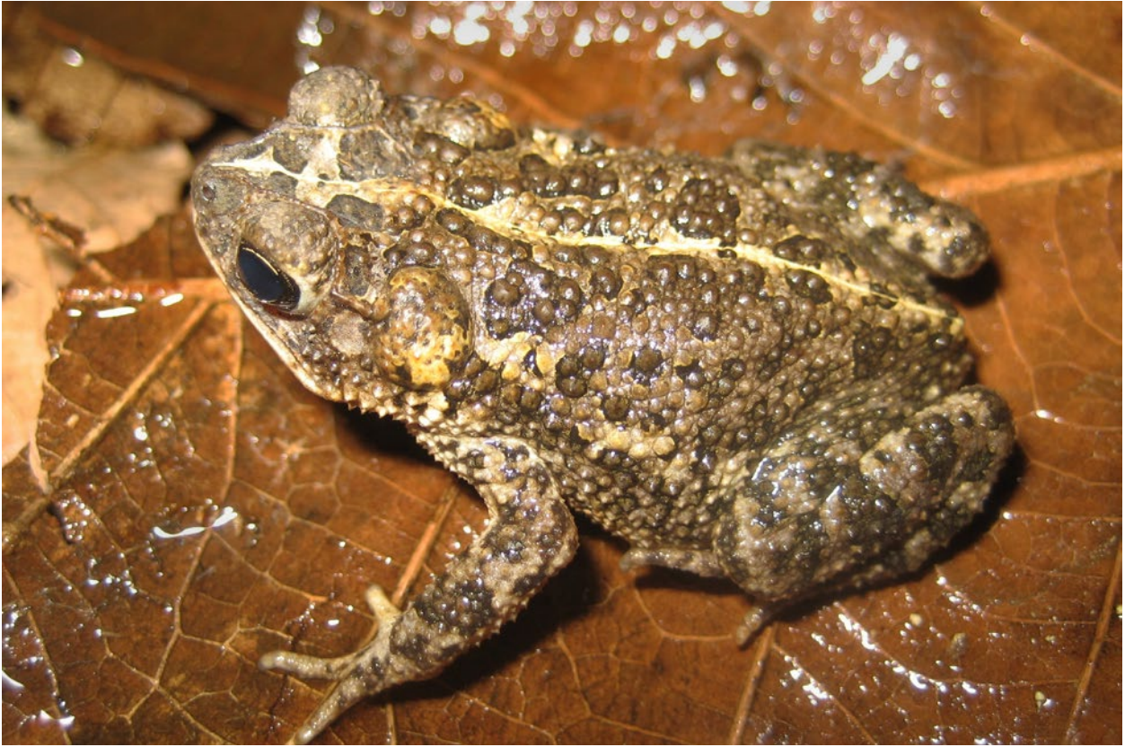
Incilius pisinnus. The Michoacán toad is a state endemic, with a distribution in the Balsas-Tepalcatepec Depression and the Sierra Madre del Sur. Its EVS was estimated as 15, which is unusually high for a bufonid anuran, its IUCN ranking has been judged as Data Deficient, and a SEMARNAT status has not been provided. This individual is from Apatzingán, Michoacán.