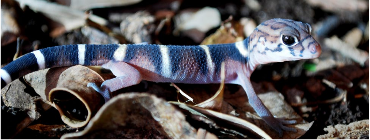
Coleonyx elegans. The elegant banded gecko is broadly distributed on both versants, from southern Nayarit and Veracruz in Mexico southward to Guatemala and Belize. In Michoacán, it inhabits the Coastal Plain and Balsas-Tepalcatepec Depression physiographic provinces. Its EVS has been indicated as 9, placing it at the upper end of the low vulnerability category, its IUCN status has not been assessed, and this gecko is regarded as Threatened by SEMARNAT. This individual came from Colola, on the coast of Michoacán.