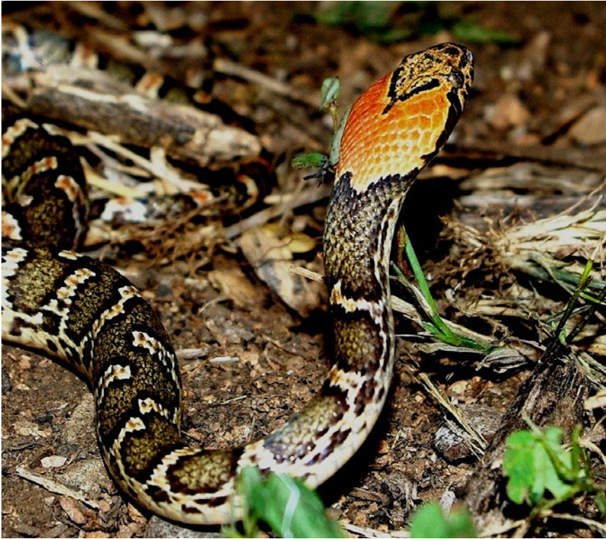
Leptodeira uribei. Uribe's cat-eyed snake is distributed along the coastal plain in Michoacán, and northward through the lowlands to Jalisco and southward to Oaxaca. Its EVS has been gauged as 17, placing it in the middle of the high vulnerability category, its IUCN status has been assessed as Least Concern, and it is considered a Special Protection species by SEMARNAT. This individual was found at San Mateo, near the Reserva de la Biosfera Chamela-Cuixmala on the coast of Jalisco.