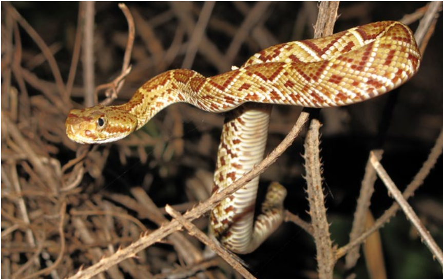
Crotalus basiliscus. The west coast Mexican rattlesnake is distributed from southern Sonora to northwestern Michoacán. In Michoacán, it is found in the Coastal Plain, Sierra Madre del Sur, and the Balsas-Tepalcatepec Depression physiographic provinces. Its EVS has been reported as 16, placing it in the middle of the high vulnerability category, it has been assessed as Least Concern by IUCN, and it is regarded as a Special Protection species by SEMARNAT. This individual is from San Mateo, on the coast of Jalisco.