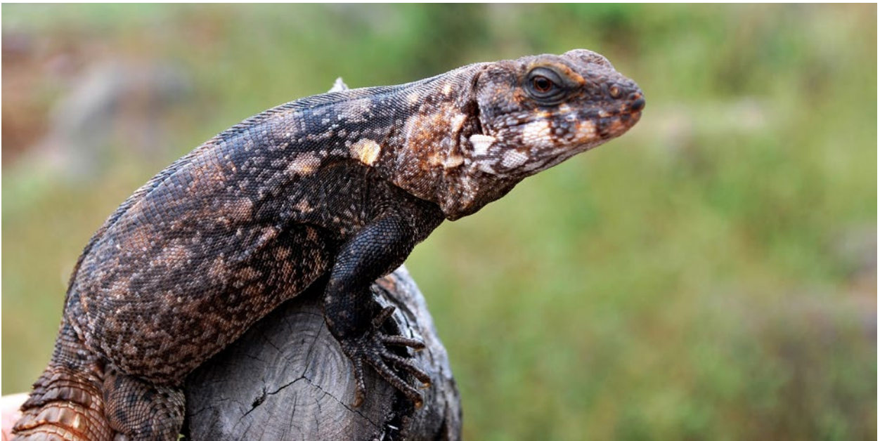
Ctenosaura clarki . The Balsas armed lizard is endemic to the Balsas-Tepalcatepec Depression. Its EVS has been gauged as 15, placing it in the lower portion of the high vulnerability category, this species has been judged as Vulnerable by IUCN, and considered as Threatened by SEMARNAT. This individual is from Nuevo Centro, Reserva de la Biósfera Infiernillo-Zicuirán, near the Presa Infiernillo on the Río Balsas in southeastern Michoacán.