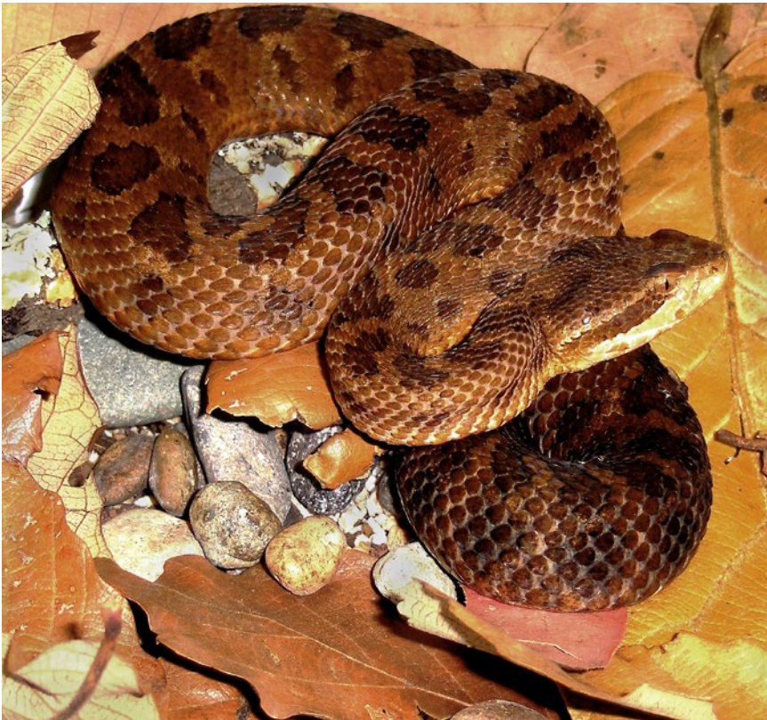
Crotalus pusillus. The Tancitaran dusky rattlesnake is found in the Sierra de Coalcomán region of the Sierra Madre del Sur and the western portion of the Transverse Volcanic Axis. Its EVS has been estimated as 18, placing it in the upper portion of the high vulnerability category, it has been assessed as Endangered by IUCN, and it is considered as Threatened by SEMARNAT. This individual came from Cerro Tancitaro, the highest mountain in Michoacán, located in the west-central portion of the state.