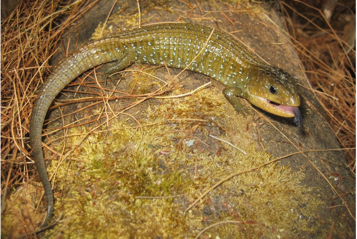
Barisia imbricata . In Michoacán, the imbricate alligator lizard occurs in the Transverse Volcanic Axis. The systematics of this species, however, is currently in flux, and based on indications in recent molecular work this taxon likely will be divided into a number of species. Its EVS has been estimated as 14, placing it at the lower end of the high vulnerability category, this species has been judged as Least Concern by IUCN, and given a Special Protected status by SEMARNAT. This individual is from Tacámbaro, in the Transverse Volcanic Axis of Michoacán.