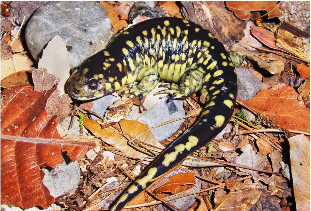
Ambystoma velasci . The plateau tiger salamander is found along the Transverse Volcanic Axis in Michoacán and elsewhere, thence northward into both the Sierra Madre Occidental to northwestern Chihuahua and the Sierra Madre Oriental to southern Nuevo León. Its EVS has been assigned a value of 10, placing it at the lower end of the medium vulnerability category, its status has been judged as Least Concern by IUCN, and it is considered a Special Protection species by SEMARNAT. This individual came from Los Azufres, in the Transverse Volcanic Axis.

sadidae is the best represented. Only three snake families are represented by a single species (including the Typhlopidae, containing the non-native blindsnake Ramphotyphlops braminus ), but in all three cases they occur in two or three provinces (Table 5).