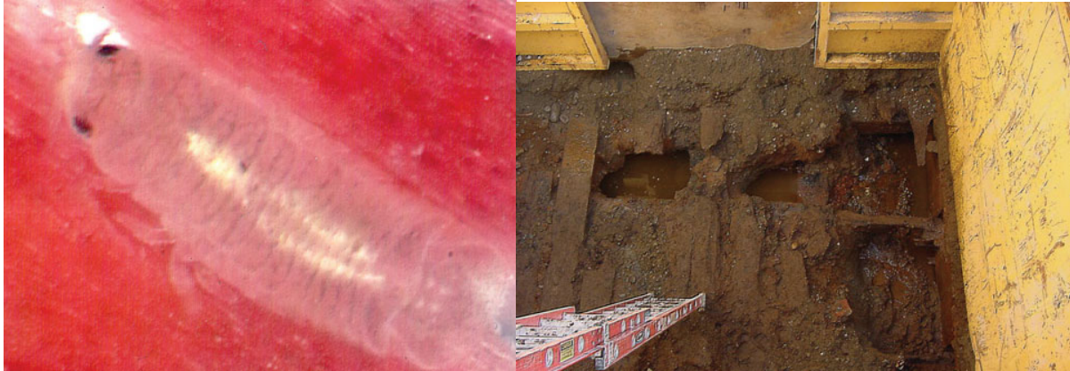
Figure 2. Limnoria sp. and the damage it can cause

The Chinese mitten crab Eriocheir sinensis first appeared as an invasive species in Germany during the early 1900's and has since spread through most of Europe (Clark et al. 1998). It has been reported in the United States from Lake Erie, San Francisco Bay, the Columbia River, and Mississippi Sound. Mitten crabs are catadromous, spending most of their adult life in fresh water, then returning to the sea to reproduce. They form extensive burrows in riverbanks and levees, thus posing a direct threat to earthen water control structures. The life history of the Japanese mitten crab ( E. japonicus ) is believed to be similar. Further information on the life history of mitten crabs can be found either in Veldhuizen and Stanish (2002) or an ANS fact sheet ( http://el.erd.c.usace.army.mil/ansrp/eriocheir_sinensis.htm ).