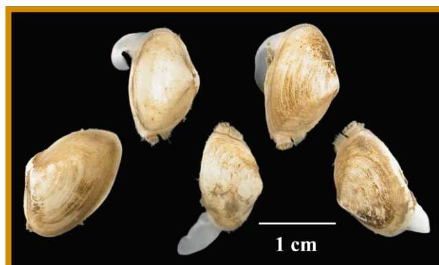
Figure 3. Potamocorbula amurensis

The Asian or Amur River corbula clam Potamocorbula amurensis (Figure 3), a native of Chinese, Japanese, and Korean waters, inhabits both intertidal and subtidal mud and sand. It tolerates a wide range of salinities and temperatures and feeds on bacteria, phytoplankton, and copepod larvae (Cohen and Carlton 1995, Kimmerer et al. 1994, Werner and Hollibaugh 1993). Since its initial detection in San Francisco Bay in 1987 it has become the dominant infaunal species in the bay, displacing native fauna (Carlton et al. 1990, Nichols et al. 1990). It appears to be responsible for a significant decline in bay phytoplankton (Alpine and Cloern 1992), which in turn has had negative impacts on resident zooplankton and fish populations (Kimmerer et al. 1994, Feyrer et al. 2003). Although presently limited to San Francisco Bay, it has the potential for widespread distribution via planktonic larvae. This species may interfere with the natural recolonization of dredged material deposits or sediments employed in beneficial use projects.