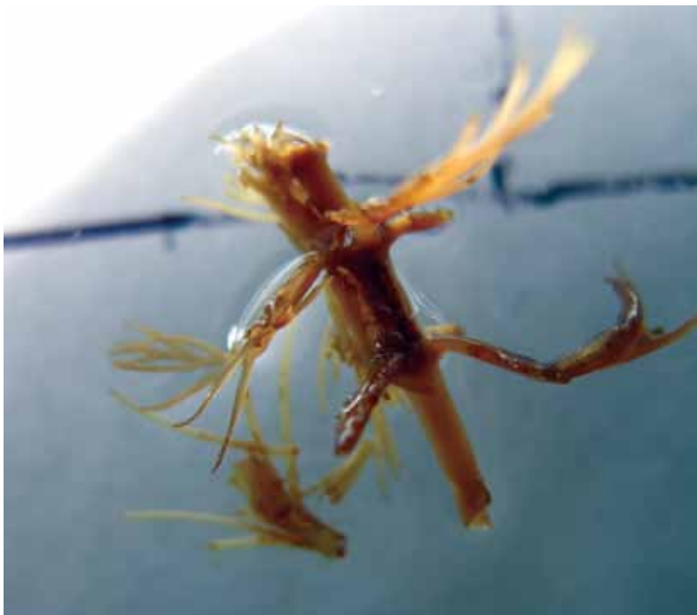
Figure 3. Milfoil midge case.

Other midge larvae can also cause Eurasian watermilfoil damage. Several studies have identified midge larvae that utilize Eurasian watermilfoil to various degrees, for example as a substrate to graze algae or filter water, or to graze on the plant itself. Unfortunately, this is a difficult group of insects to identify, so in the studies we have conducted, we aren't always sure which species cause the damage. However, we have seen relatives of the milfoil midge, in the Cricotopus group, which also damage the milfoil growing tips to the point that plant growth slows or stops. Also, a Glyptotendipes species will tunnel into the stems, often causing the upper part of the plant to die.