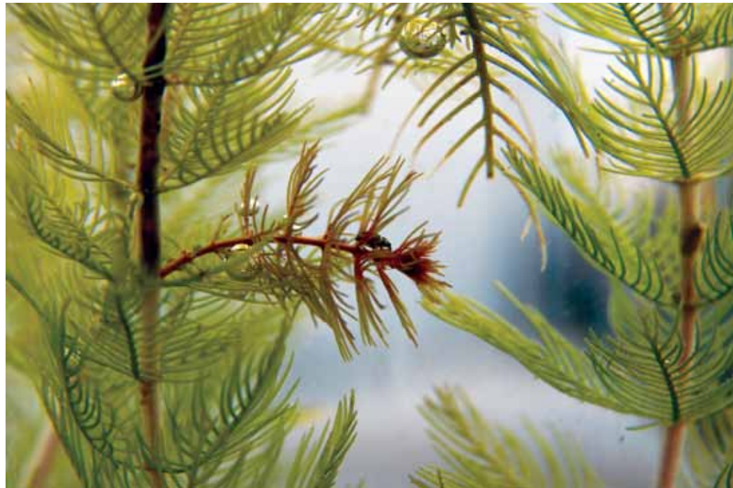
Figure 1. Milfoil weevil adult on milfoil, stem damage typically resulting from larval mining can be seen on the upper portion of the plant.

the 2 nd Annual NALMS conference in 1982 (Kangasniemi 1983). This was a long time ago! Unfortunately, the good work in British Columbia lost traction when their Eurasian watermilfoil program lost funding. A decade later a Eurasian watermilfoil decline in Vermont was investigated by Creed and Sheldon (1991). They found that a native aquatic weevil, the milfoil weevil ( Euhrychiopsis lecontei ), caused the extensive plant damage (Figures 1 and 2). Since then, much additional research has been done on this insect (Newman 2004). This weevil has been the primary focus of Eurasian watermilfoil biocontrol, with many augmentation projects having taken place, both experimentally and commercially.