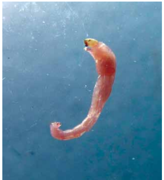
Figure 4. Midge larvae out of its case.