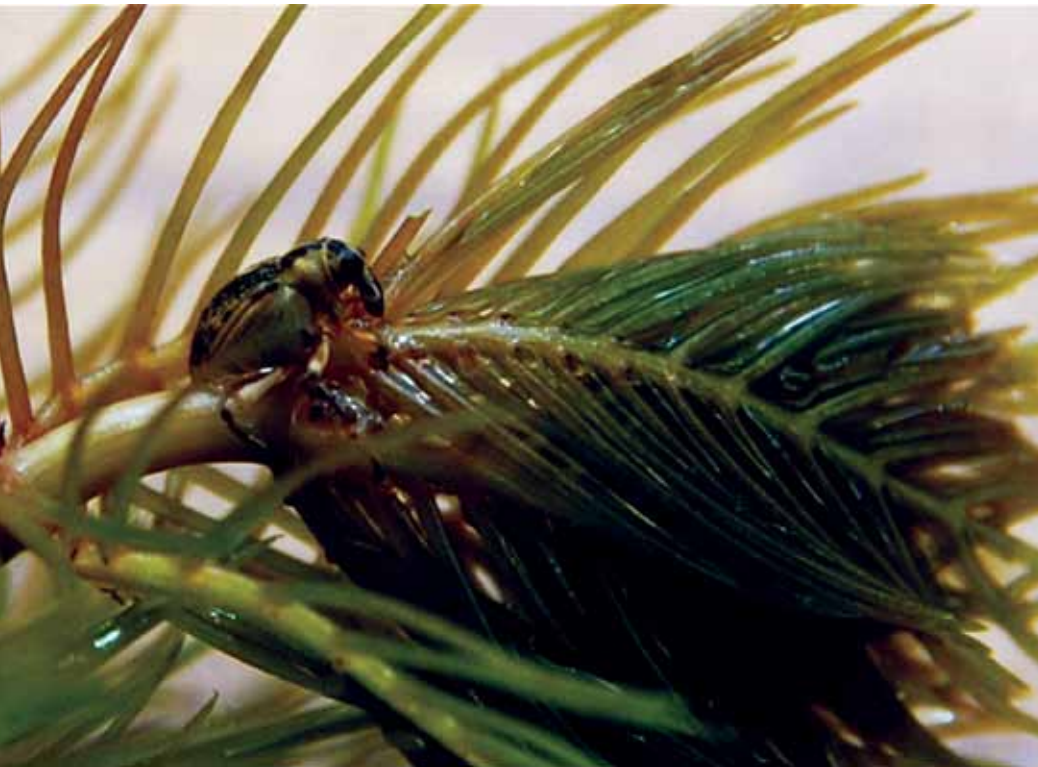
Figure 2. Milfoil weevil adult on milfoil growing tip.

Because the milfoil weevil is already well known, I will spend a little time going over the other, less well-known insect herbivores implicated in causing Eurasian watermilfoil declines. Most of these were noted by Kangasniemi (1983). One such insect is the milfoil