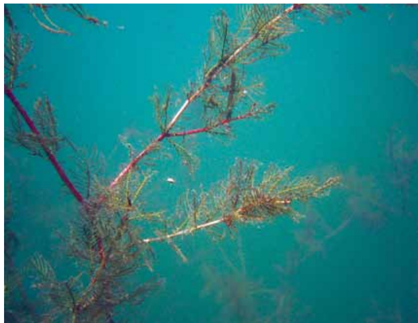
Figure 6. “Ratty”-looking milfoil with two Triaenodes caddisfly larvae and a swimming milfoil weevil from Lavender Lake.