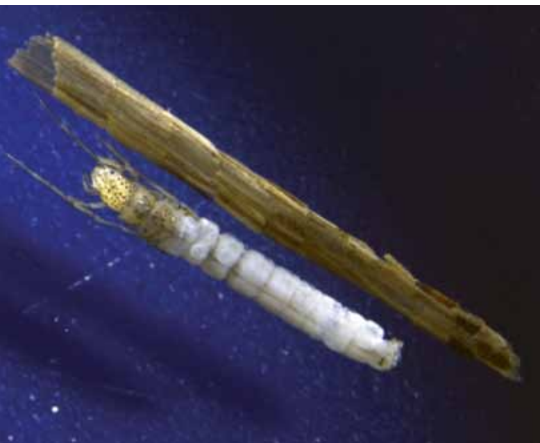
Figure 5. Triaenodes larvae and case.

The third lake, Stan Coffin Lake in central Washington, also has a natural population of milfoil weevils. In fact, the weevils were so abundant in 2002 that