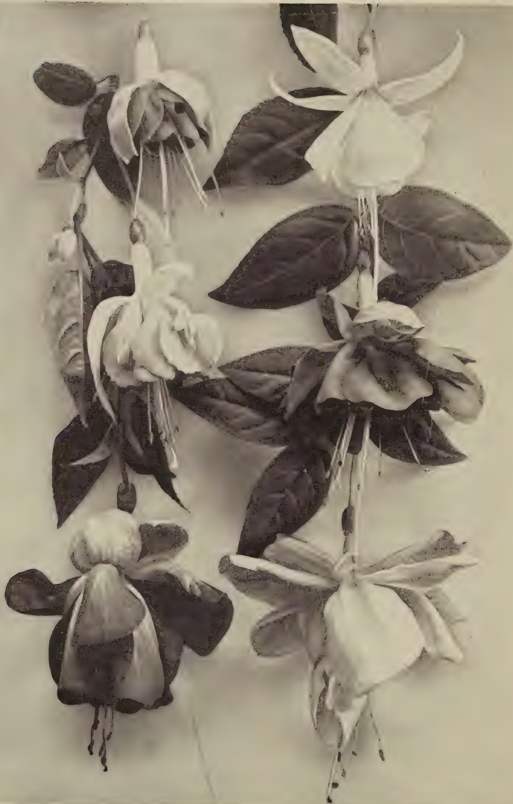
BLUE PENDANT FLIRTATION SAN MATEO