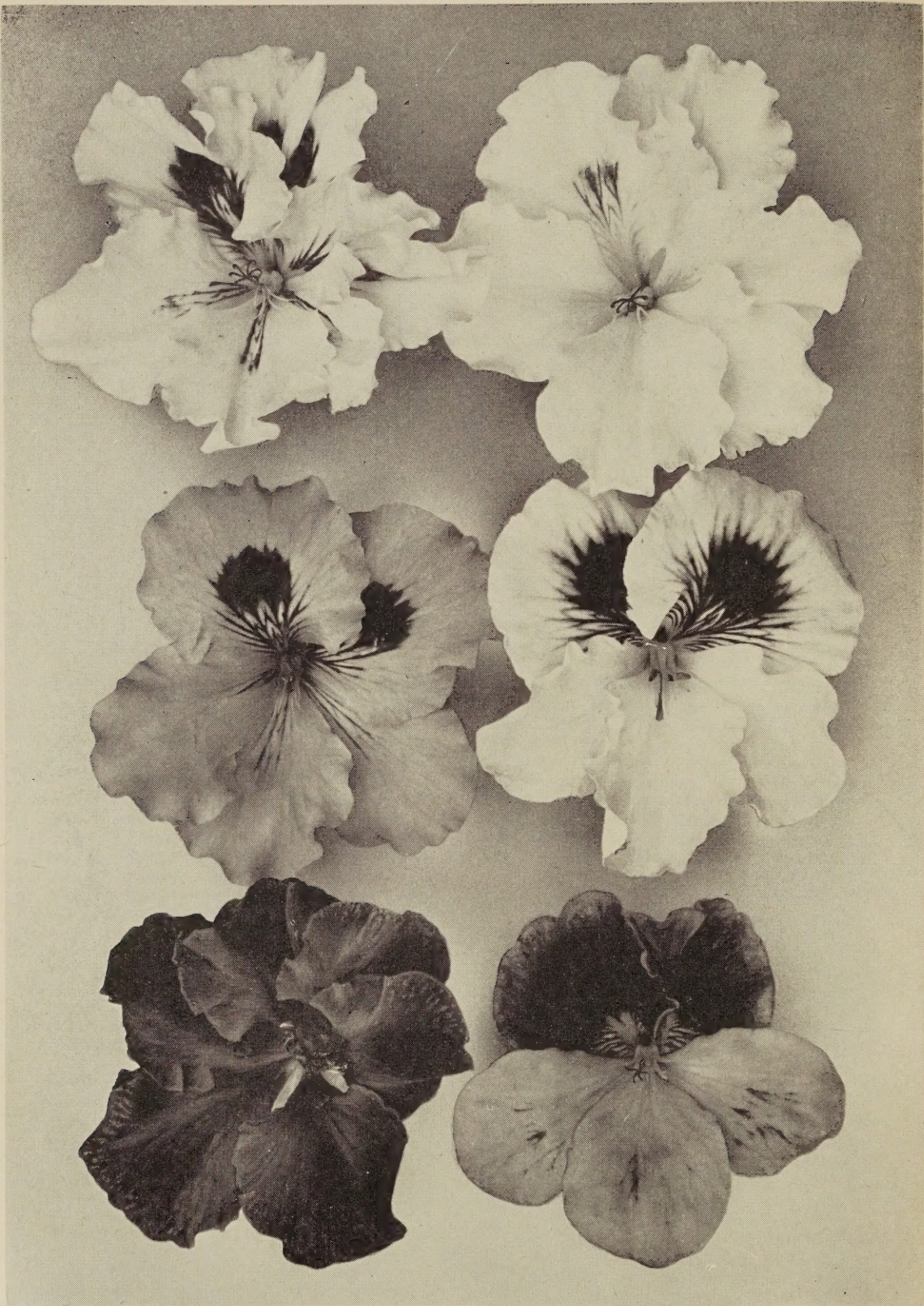
VALENTINE GIRL GRAND SLAM BLACK PRINCE