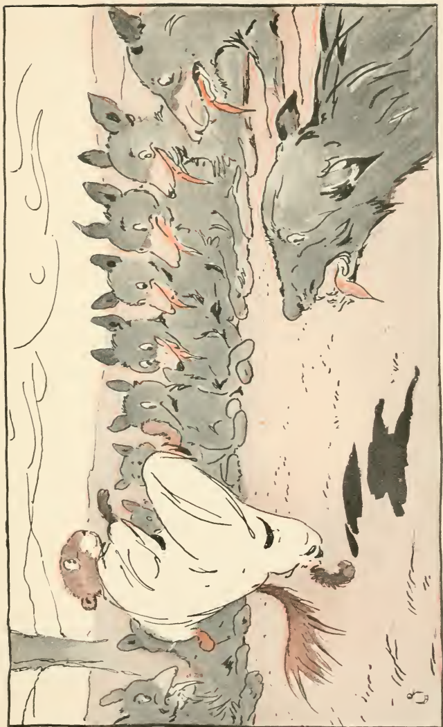
GROUN'-HOG WUZ DARNIN' FER HIS LIFE