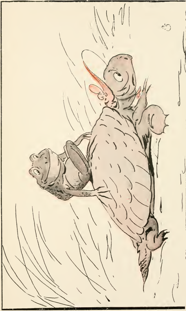
TOAD-FROG PERCHED UP DAR CUTTIN' ALL SORTS ER SHINES