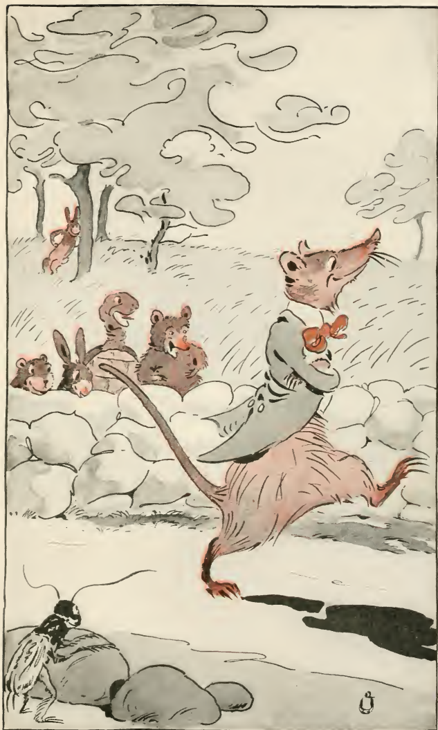
DEY SEED 'POSSUM SWITCHIN' DOWN DE ROAD