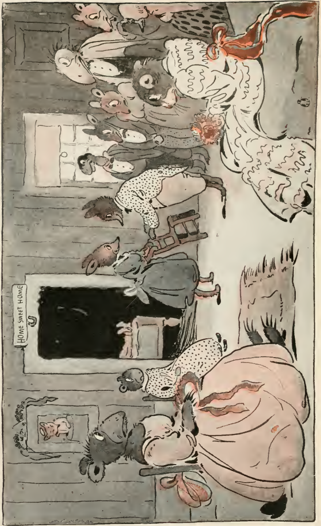
OH, BOY, GIN 'EM CHEERS