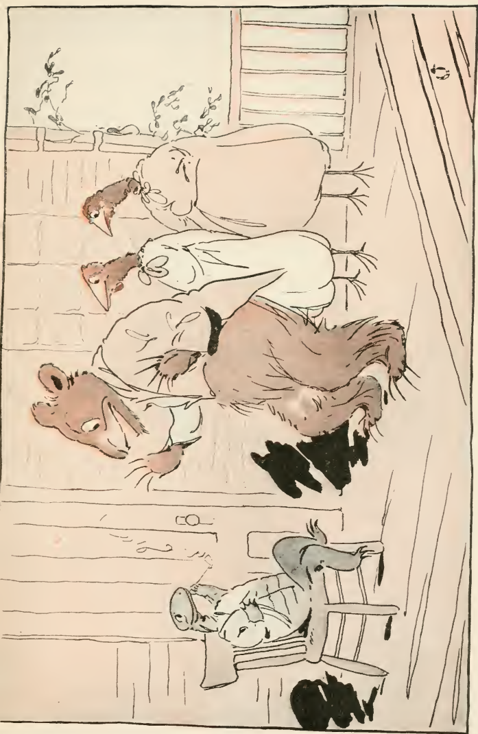
"NAME ER COMMON SENSE! HOW DID YOU GIT YER?"