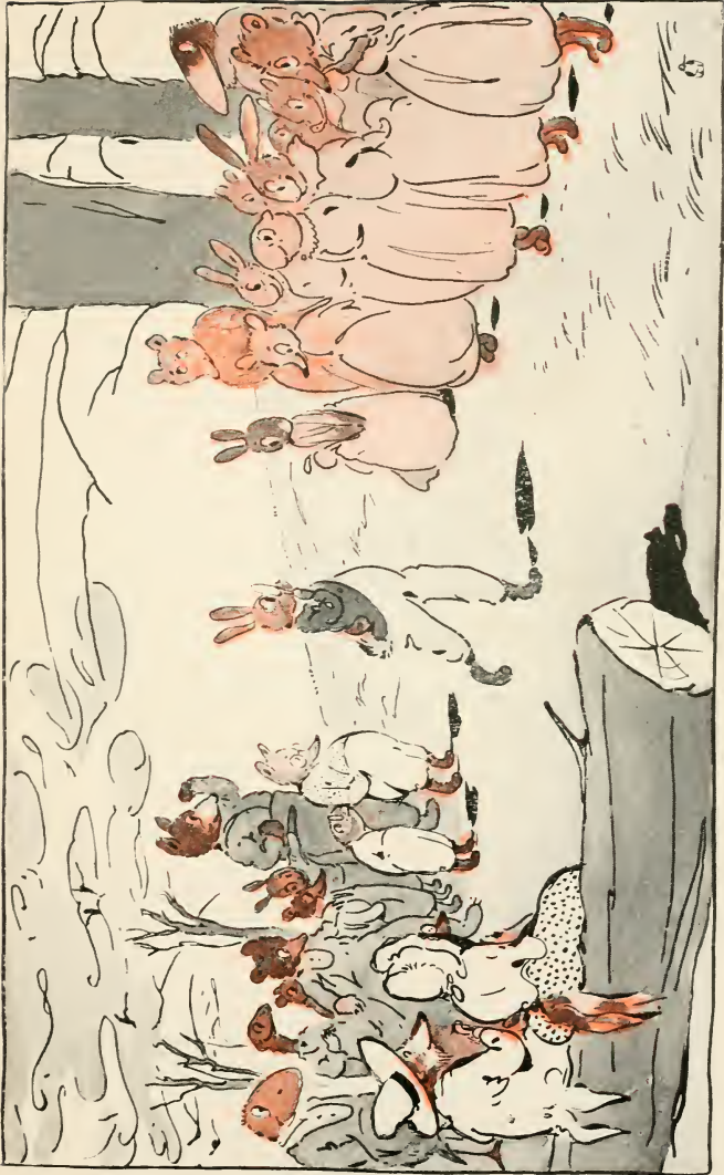
MISTAH HYAR WAS GWINE UP AN' DOWN DE LINE