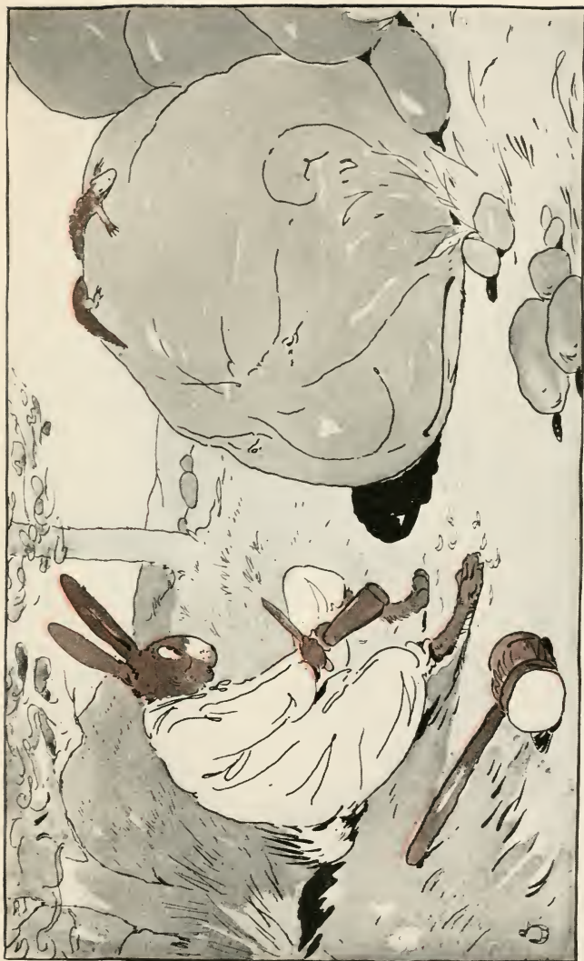
MISTAH HYAR' WUZ WU'KKIN' 'WAY ON DE WOOD