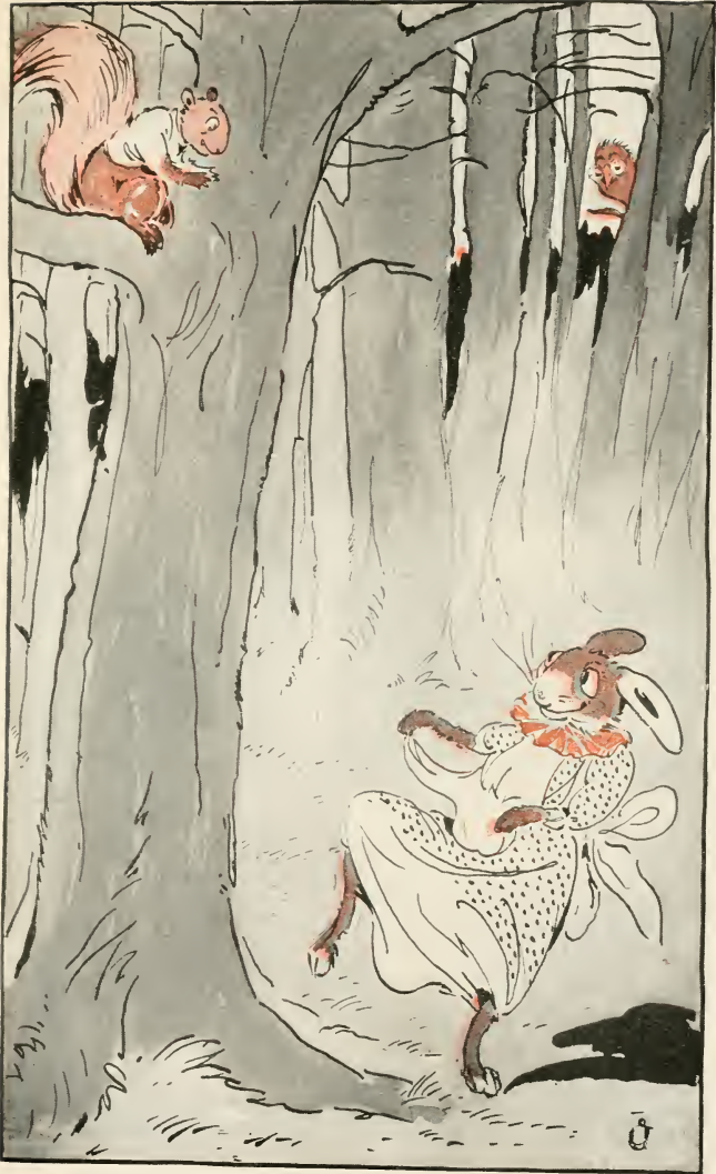
BRER SQU'L CLAP HIS LI'L PAWS