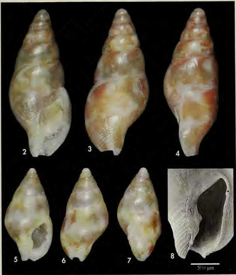
Figures 2-4. Mitrella cabofrioensis sp. nov. holotype (MORG 39010), shell length 9.5 mm. Figures 5-8. Mitrella antares sp. nov. 5-7: holotype (MORG 33314), shell length 3.6 mm; 8: detail of aperture showing denticles on columella (paratype: ANSP 367004).

Figuras 2-4. Mitrella cabofrioensis sp. nov. holotipo (MORG 39010), longitud de la concha 9.5 mm. Figuras 5-8. Mitrella antares sp. nov. 5-7: holotipo (MORG 33314), longitud de la concha; 8: detalle de la apertura mostrando los denticulos de la columela (paratipo: ANSP 367004).