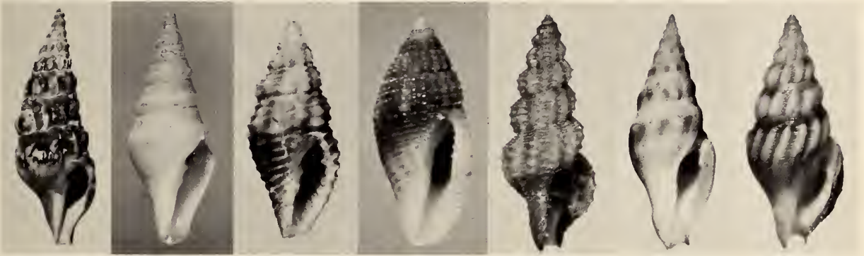
Figure 35 Figure 36 Figure 37 Figure 38 Figure 39 Figure 40 Figure 41