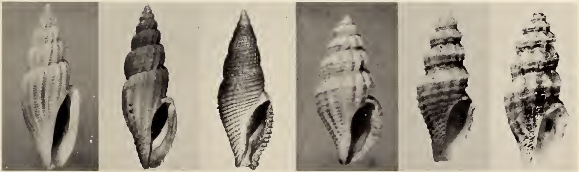
Figure 42 Figure 43 Figure 44 Figure 45 Figure 46 Figure 47