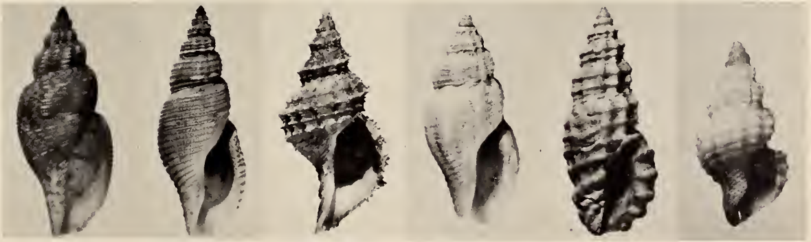
Figure 48 Figure 49 Figure 50 Figure 51 Figure 52 Figure 53