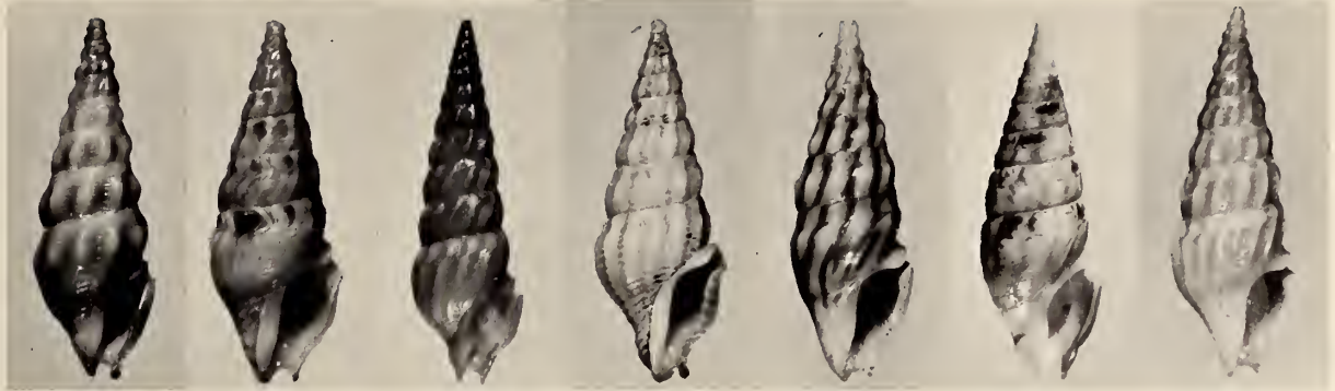
Figure 1 Figure 2 Figure 3 Figure 4 Figure 5 Figure 6 Figure 7