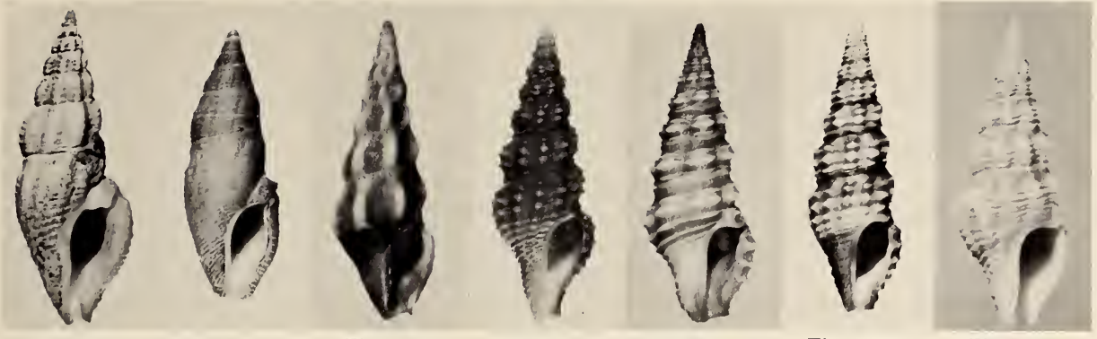
Figure 28 Figure 29 Figure 30 Figure 31 Figure 32 Figure 33 Figure 34