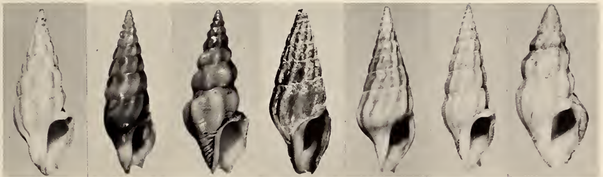
Figure 15 Figure 16 Figure 17 Figure 18a Figure 18b Figure 19 Figure 20