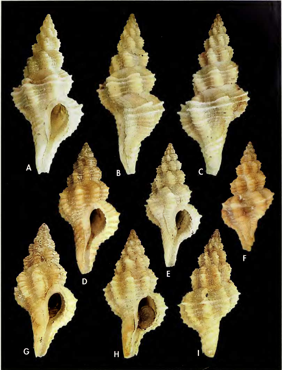
Figure 1. Fusinus buzzurroi n. sp., Mljet Island (Croatia), 60-100 m. A-C: holotype (MNHM Mo 33638), apertural, lateral and dorsal views, 26.4 x 11.7 mm; D: paratype A, apertural view, 21.8 x 10.4 mm; E: paratype I, apertural view, 20.5 x 9.6 mm; F: paratype D, dorsal view, 18.4 x 8.9 mm; G: paratype F, apertural view, 22.4 x 10.2 mm; H, I: paratype B, apertural and dorsal views, 21.4 x 10.7 mm.

Figura 1. Fusinus buzzurroi n. sp., Mljet Island (Croatia), 60-100 m. A-C: holotipo (MNHM Mo 33638), vista apertural, lateral y dorsal, 26,4 x 11,7 mm; D: paratipo A, vista apertural, 21,8 x 10,4 mm; E: paratipo I, vista apertural, 20,5 x 9,6 mm; F: paratipo D, vista dorsal, 18,4 x 8,9 mm; G: paratipo F, vista apertural, 22,4 x 10,2 mm; H-I: paratipo B, vista apertural y dorsal, 21,4 x 10,7 mm.