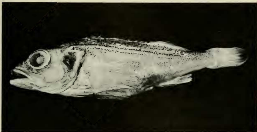
FIGURE 1. Lateral view of Helicolenus avius , CAS 13614, paratype, 172 mm. in standard length.

NAME. The specific name avius is the Latin word for "out of the way, remote or solitary." This name is in reference to the type locality, an isolated seamount. A Japanese name, "okikasago," meaning Sebastes -like or Helicolenus hilgendorfi -like fish, was given to this species (Abe, 1970).