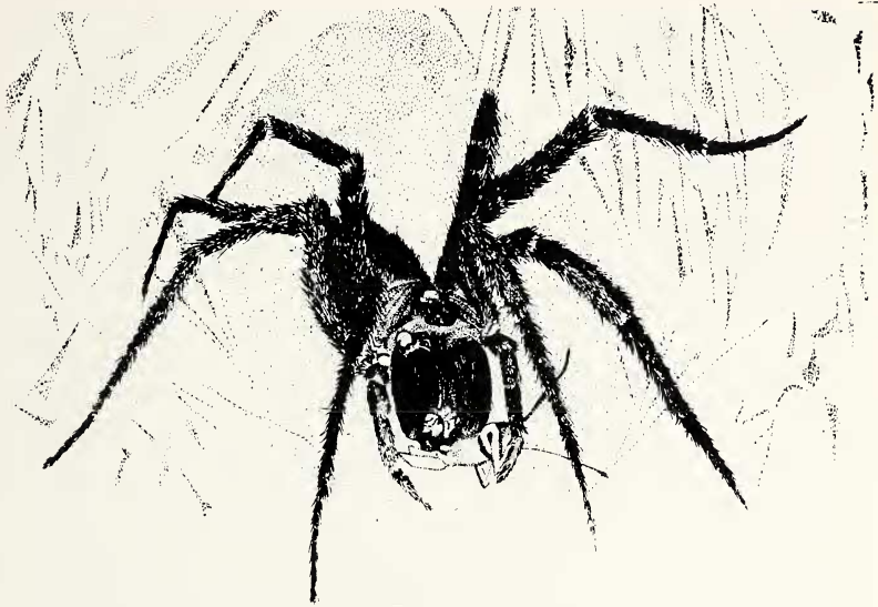
Figure 1. The mygalomorph spider Diplura sp. in its silken retreat, feeding on a grasshopper. Perched on its eyes and on its chelicerae is the symphytognathid associate Curimagua bayano .

When I brushed Curimagua off the dipluran cephalothorax, they crawled about in the web and, as soon as contact was made with an extremity of the host, they started to climb it to regain their former position. During an experiment, a Curimagua female was taken from the back of a Diplura and confined to a Petri dish (diameter 5 cm) with another mygalomorph spider of approximately the same size as the diplurid. The Curimagua did not attempt to mount this spider.