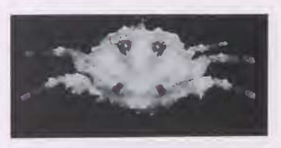
FIG. 2. Exopalicus maculatus (Edmondson, 1930), of (OMW25171) showing pattern of live colouration.

MATERIAL. North West Shelf, Western Australia, CSIRO, RV Soela (64 stations between 19°03.0'S, 119°02.4'E and 20°01.2'S, 116°57.6'E, 36-82m depth, epibenthic sledge or beam trawl, from 8.12.1982 to 30.10.1983): QMW25123, 2 juv. ♀; QMW25134, ♂; QMW25110, 2♀; QMW25126, ♂; QMW25144, 2&; QMW25138, juv. ♀; QMW25139, 2&; QMW25116, δ; QMW25146, δ; QMW25115, 9; QMW25124, juv. 9; QMW25133, d; QMW25127, 9; QMW25156, 29; QMW25160, unsexed juv.; QMW25125, 9; QMW25154, 29; QMW25132, ♂; QMW25166, 9; QMW25129, juv. 9; QMW25155, 2 juv. 9; QMW25162, d; QMW25111, d 9; QMW25147, d incomplete specimen; QMW25114, & 9; QMW25117, 78 39 juv. 9; QMW25141, & 2 unsexed juv.; QMW25135, juv. $; QMW25140, $; QMW25131, juv. $; QMW25106, $ 2$; QMW25158, & 29; QMW25145, &; QMW25163, & 3 juv.; QMW25120, juv. ♀; QMW25130, juv. ♀; QMW25157,39 juv. 92 unscxed juv.; QMW25159, 829; QMW25148, & 5 unsexed juv., 2 incomplete specimens; QMW25165, juv. & 29; QMW25152, damaged specimen; QMW25167,29;QMW25128,39;QMW25108,2d 39 5 juv. ♀; QMW25164, ♂ 2 juv.; QMW25161, ♂ 2 juv. ♀ 15